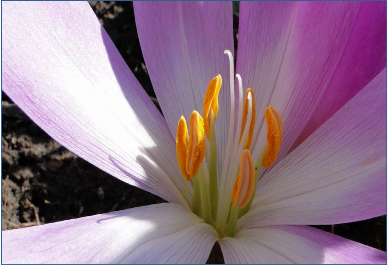
Colchicum 'Dick Trotter'