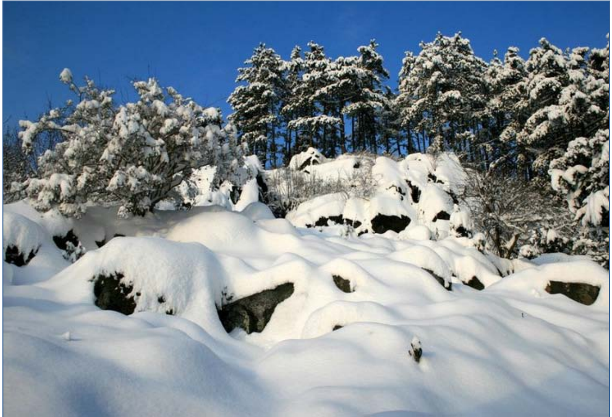
Beauty Slope in Snow