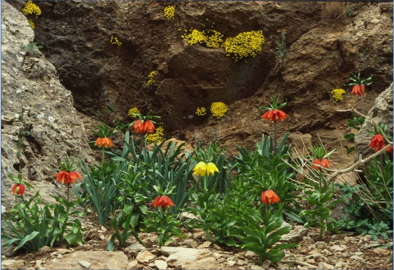
Fritillaria imperialis and Dionysia hausknechtii