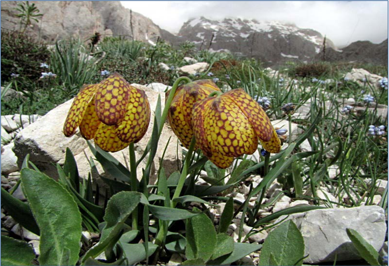
Fritillaria aurea f. cilicio-aurica