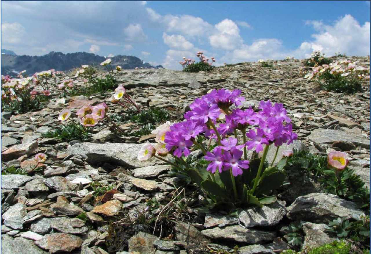
Ranunculus glacialis and Primula daoensis