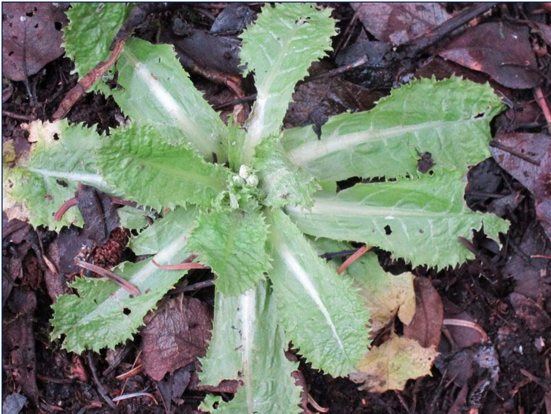
P. moupinensis typically only has 3 or 4 flower buds, as shown in the photo above.