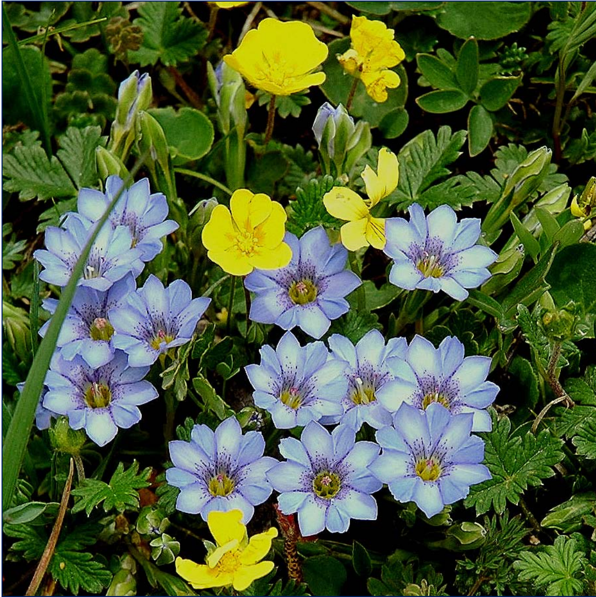
G. nanobella , near Chola Pass