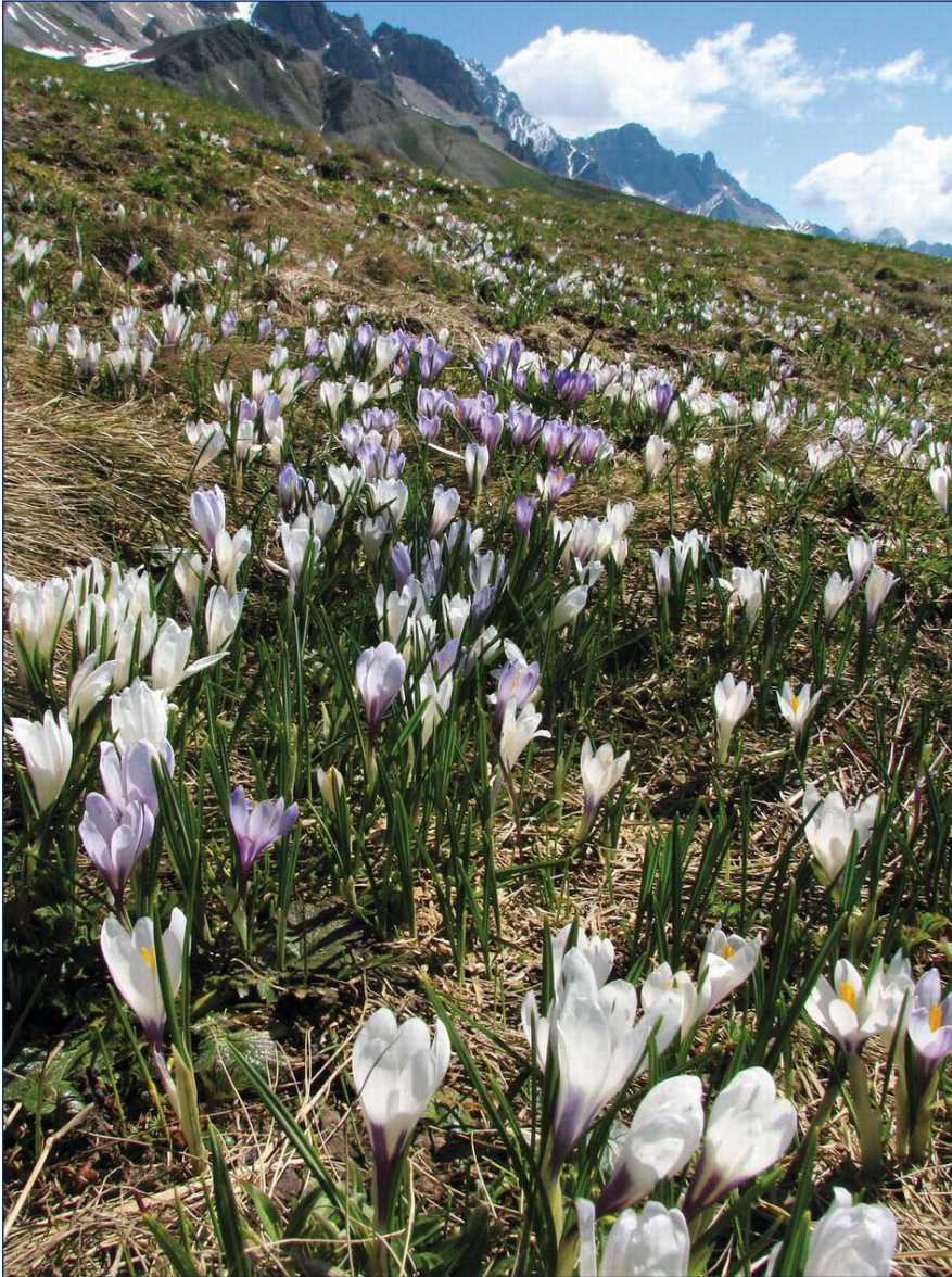
Crocus vernus subsp. albiflorus San Pellegrino Pass

I should have told him it was a little too early for the edelweiss, but he went on by. It was 22nd June. The crocus monopolized a large area with no other flowers blooming nearby at that time. On the other side of the rather wide track were no more crocus, but there we found Gentiana verna in blue and lilac forms, Pulsatilla vernalis , Primula halleri and Trollius europaeus .