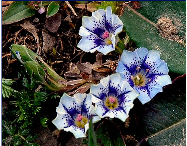
G. squarrosa , Balang Shan

Other examples of annual gentians with blue and violet flowers, all seen by us in Sichuan, are G. curviphylla (one of the most beautiful), G. squarrosa , G. aquatica var. pseudoaquatica , and G. nanobella .