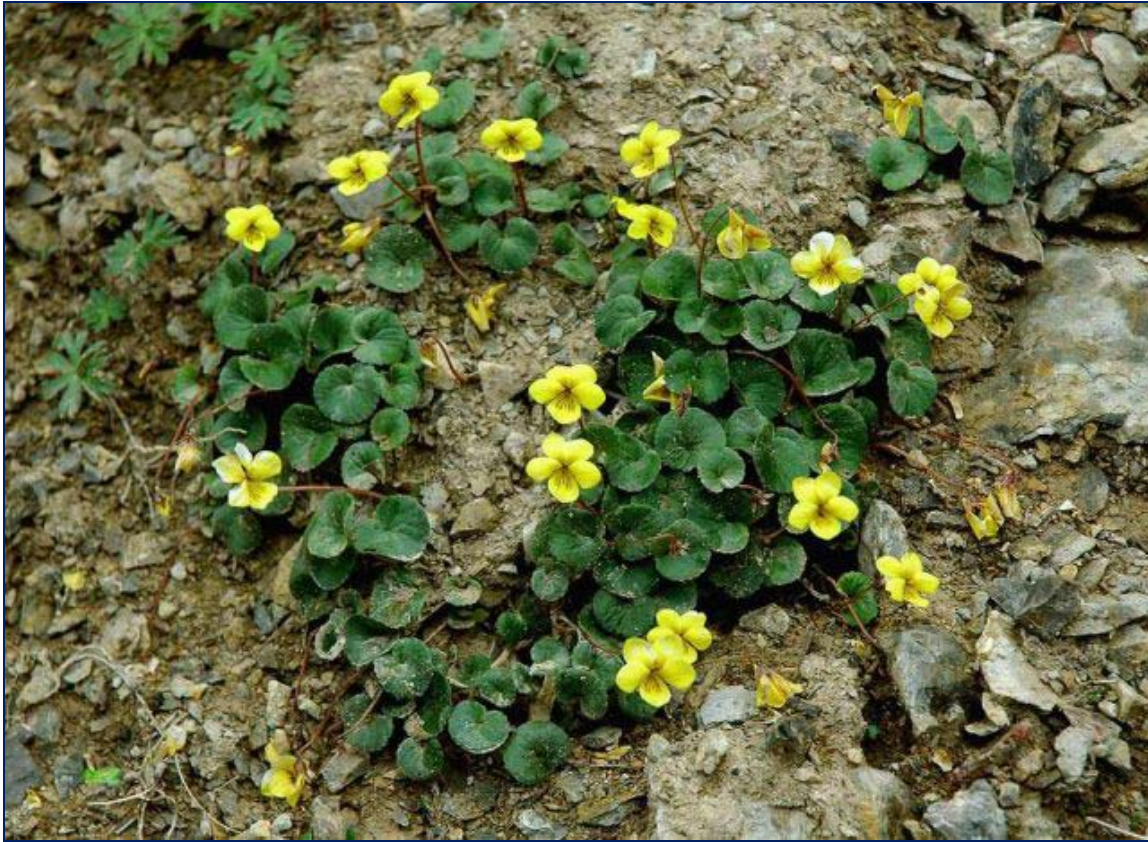
Viola cf. biflora Western Sichuan

The two-flowered yellow violet - Viola biflora L. is placed in section Dischidium , but recent research showed that it should be united with the Chamaemelum section. It is distributed in the Alps, circumpolar in Northern Europe, Asia and North America.