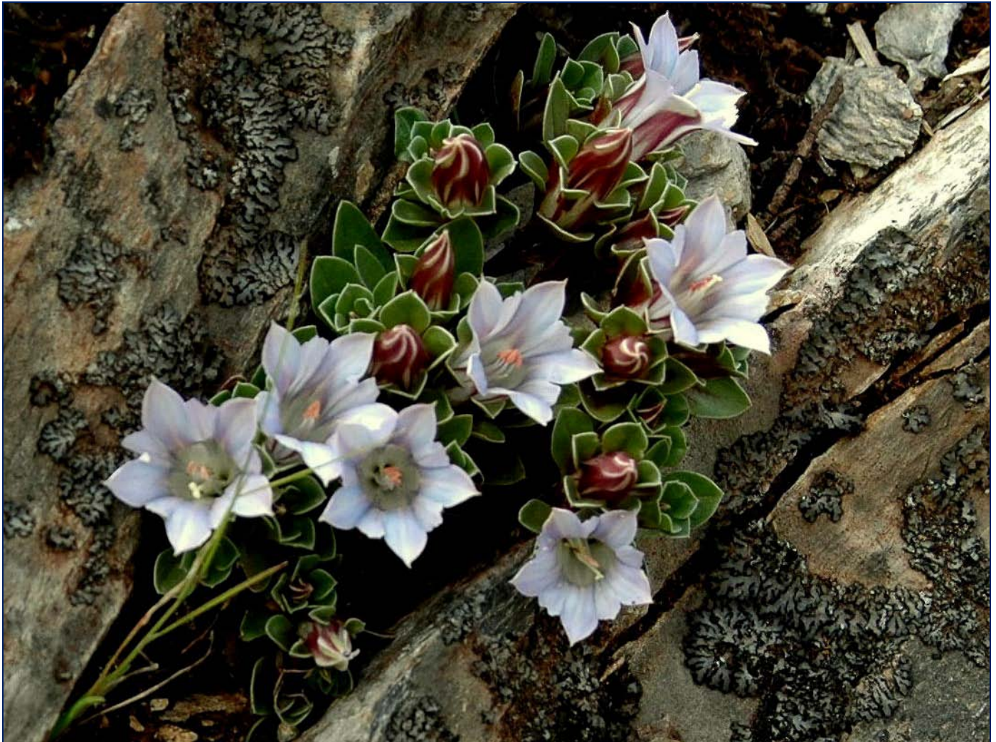
G. cf. delavayi , Napa Hai

At last I want to mention an annual gentian we have seen twice in autumn near Napa Hai. It is Gentiana delavayi , in our opinion, and a member of the section Microsperma .