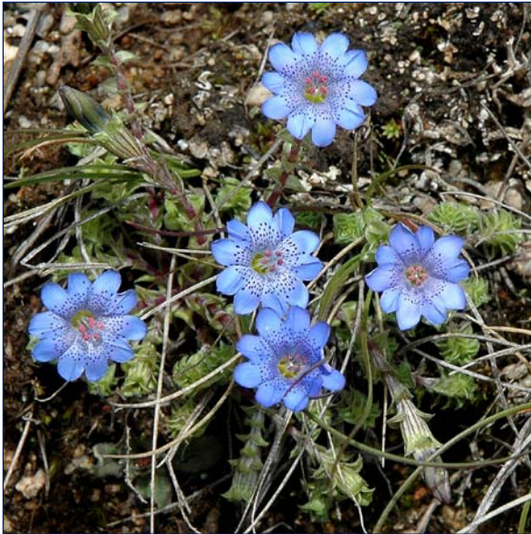
Gentiana curviphylla , near Kangding