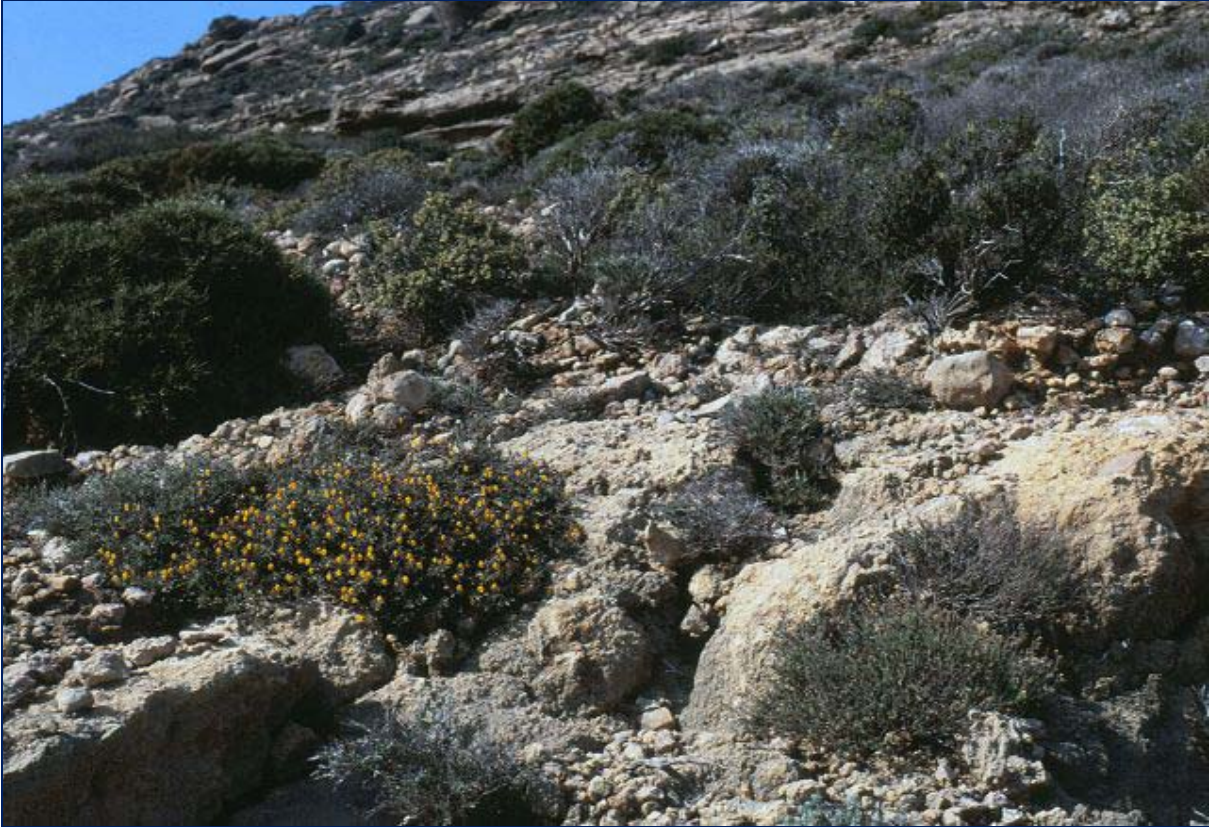
Viola scorpiuroides habitat

Together with its 'cousin' Viola arborescens and Viola decumbens from the Cape Province it is placed in section Xylinosium , where these unusual shrubby species are united. It has a woody, branched base and can reach a height of about 80 cm. The small leaves are spatulate to lanceolate. The tiny flowers are sweetly scented and show two funny black spots on the lower petal.