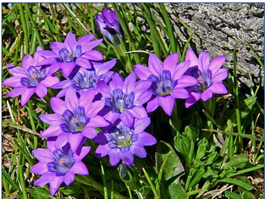
G. syringea, West of Kanding, Sichuan