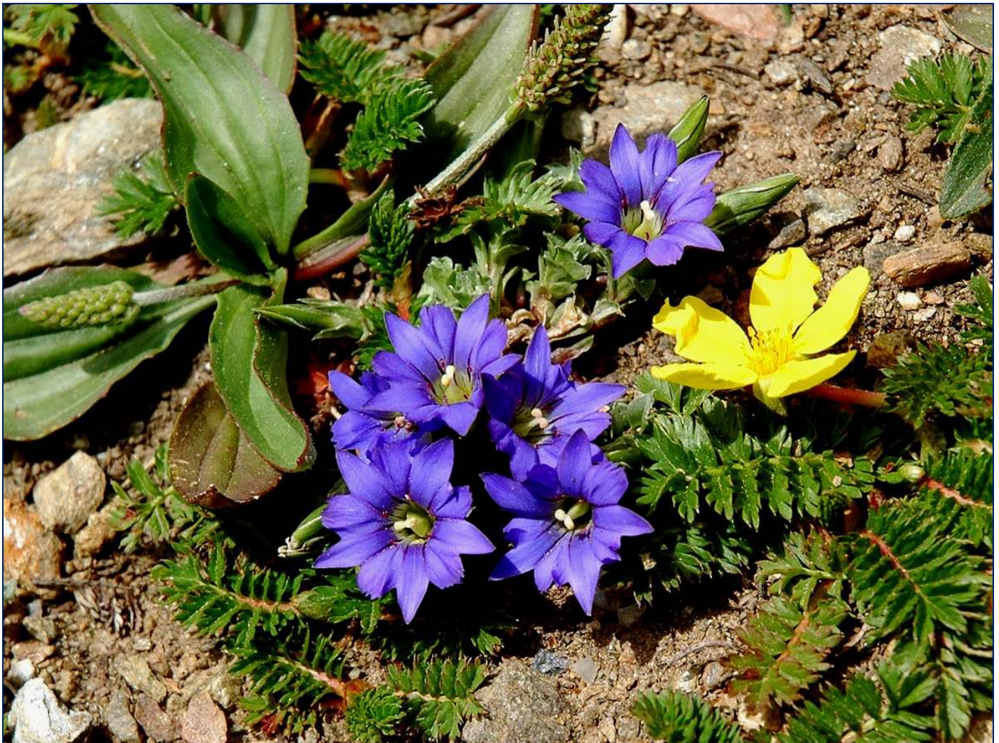
G. aquatica v. pseudoaquatica , near Dege

Other examples of annual gentians with blue and violet flowers, all seen by us in Sichuan, are G. curviphylla (one of the most beautiful), G. squarrosa , G. aquatica var. pseudoaquatica , and G. nanobella .