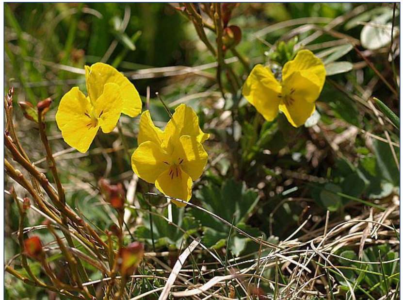
Left: V. altaica , pale yellow Above: Viola altaica , yellow

Finally I don't want to ignore the Melanium section (the pansies) where, as mentioned above, the colour yellow is widespread, even as a variety of a species which usually flowers in different shades. So, for instance Viola altaica Ker Gawl. occurs in cream, yellow and violet. Its distribution extends from NW China, Mongolia and Siberia to the Caucasus and the Ukraine. It is a typical pansy with slender rhizomes, the short stems are densely covered with numerous leaves. The plant shown here from the Zigana pass in NE Turkey often is classified as Viola altaica subsp. oreades or Viola oreades . This plant is well suited for the garden where it prefers a sunny position in humus-rich, well-drained soil. Just as with the majority of the pansies there are some losses to be expected after hard winters. Propagation by means of cuttings is easy. So it is recommended to keep some rooted young plants inside to replace missing ones if necessary. G. K.