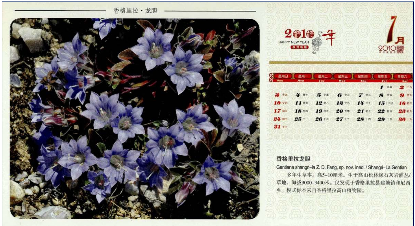
G. shangrila from the calendar

Back to the plant itself: it was easily found beside the road which leads around Napa Lake (near Zhongdian) and on the 23rd of September 2010 was flowering abundantly on rocky steep slopes. With it were growing Saxifraga candelabrum (mostly past flowering), Corallodiscus flabellatus , ferns, and Daphne calcicola . The plant was not yet at its peak of flowering but a few flowers were over. We collected a little seed with very small grains (hence section Microsperma ). These were sown in 2010 and we have not had any seedlings. Perhaps the seed was not ripe enough. The confusion with the identity of this gentian is only one example of the existing deficiencies we (and also some botanists) have noticed with the determination of obscure plants. The determination of plants only by photographs is difficult or impossible. So with some of the names in this article we could, or should, have used "cf." too.