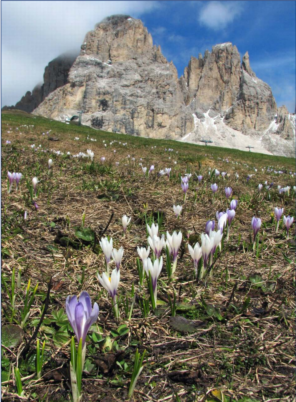
Crocus vernus subsp. albiflorus – Zahnkofel