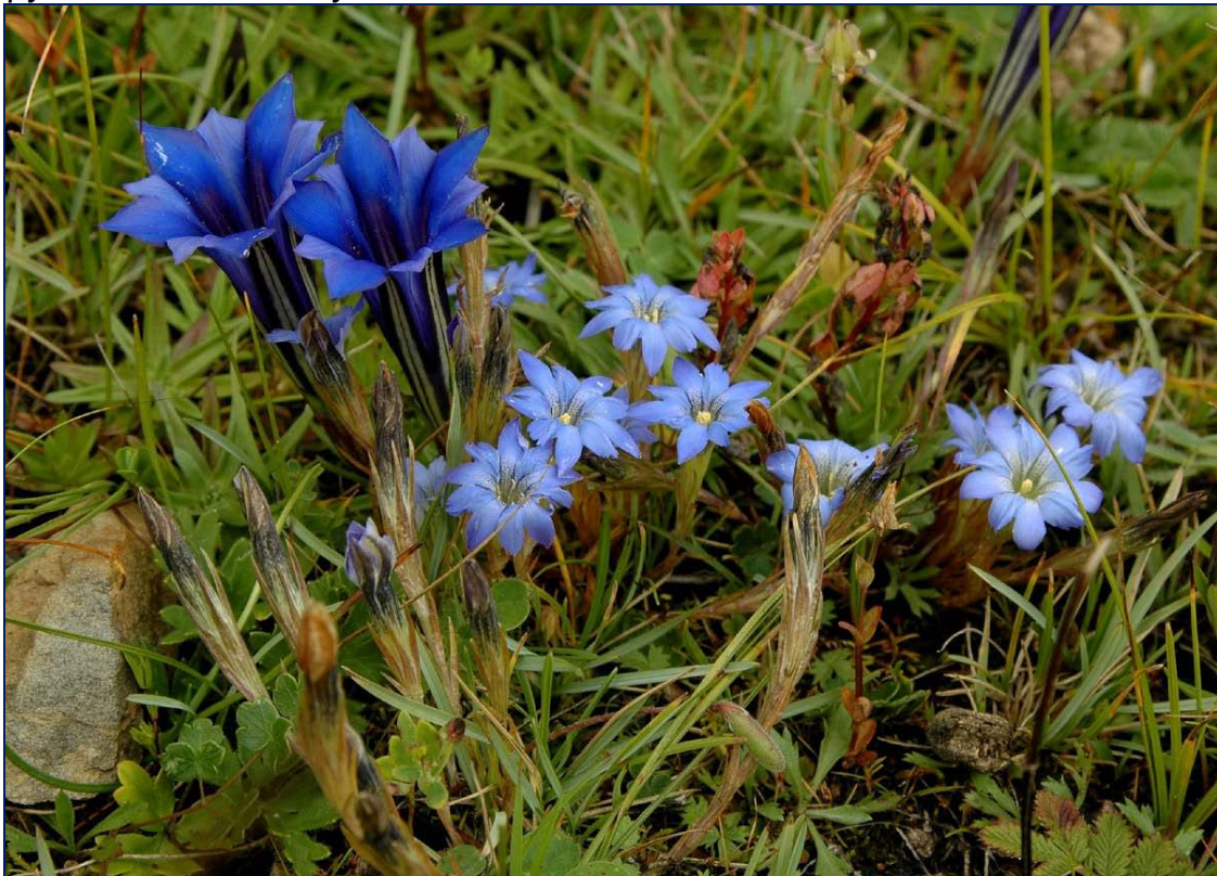
Gentiana haynaldii with G. veitchiorum , Zhongdian

The annual gentians of the sections mentioned are mostly dwarf plants with beautiful flowers in blue, violet, pink and white. Most form small tufts or even cushions with small leaves and have typically formed flowers with plicae nearly the size of the main petals like their European relatives Gentiana pyrenaica and G. boryi .