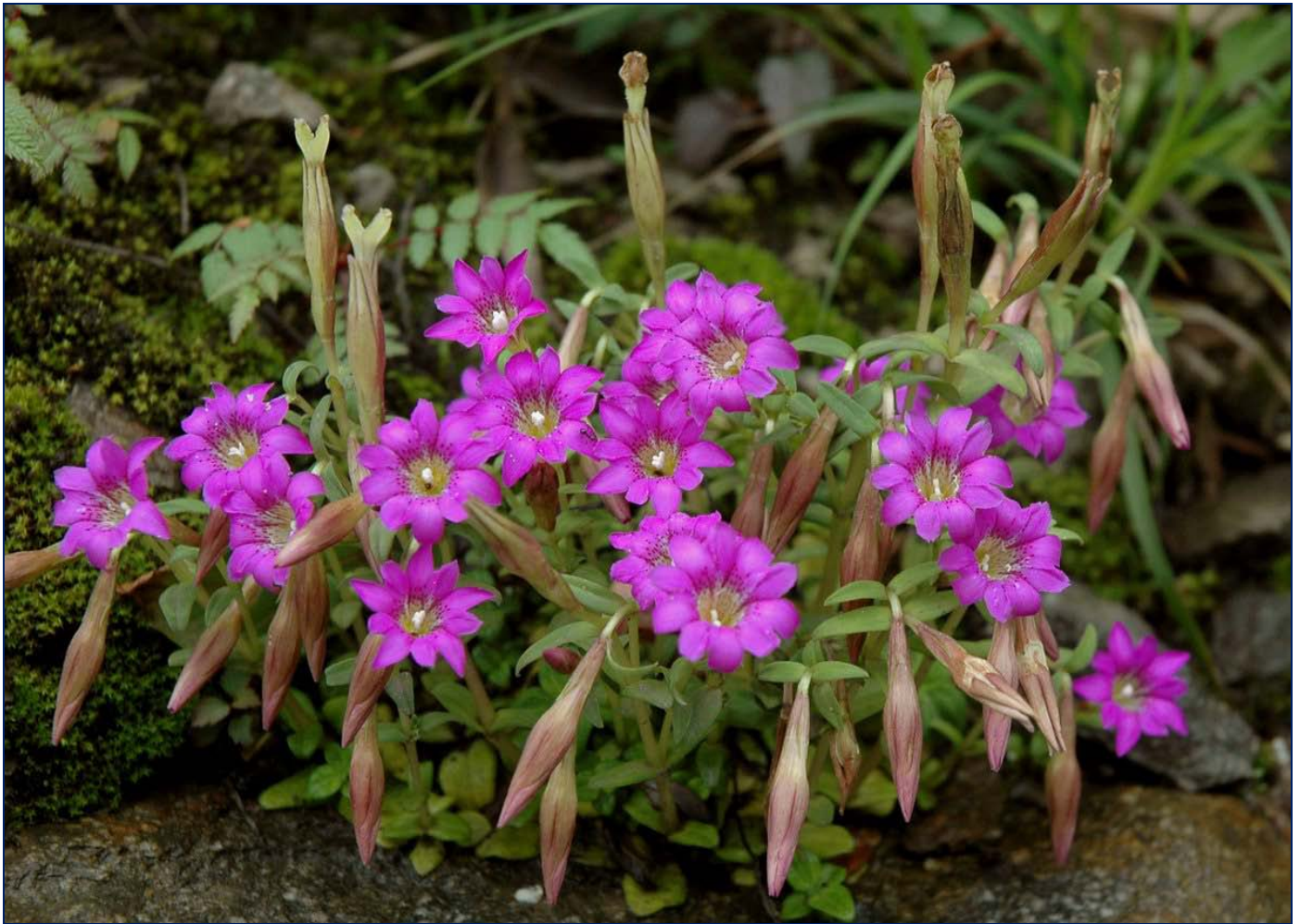
G. rubicunda , Sichuan

Several years ago we grew it from seed. We had a pot full of seedlings which flowered the second year after sowing and seeded themselves in the sand where the pot was plunged. We rejoiced to finally have a very beautiful new “weed”, very welcome in the whole garden, but unfortunately the plants disappeared without flowering and we have lost it now. This year’s seed distribution of the SRGC enables us to have another try.