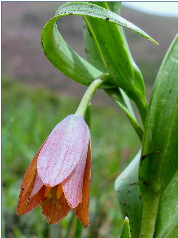
Far left: Fritillaria minima - pictured in Turkey