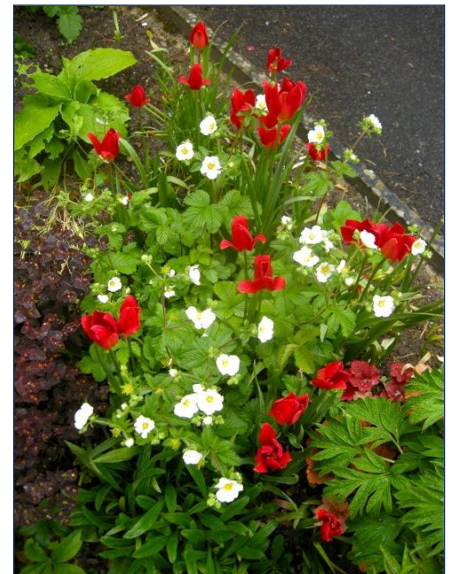
Right: A pleasing combination planting.