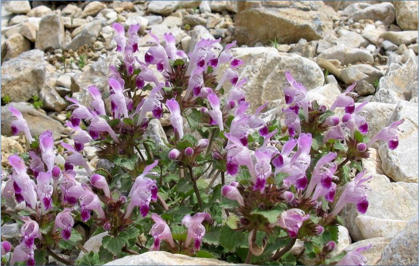
The high screes were decorated with a well-marked form of Lamium gargaricum .

The lower altitudes of the Kavuşşahap Mountains, south of Lake Van, offer interesting bulbs like Fritillaria crassifolia var. kurdica (below left) and the pale yellow Iris (Juno) caucasica (below right).