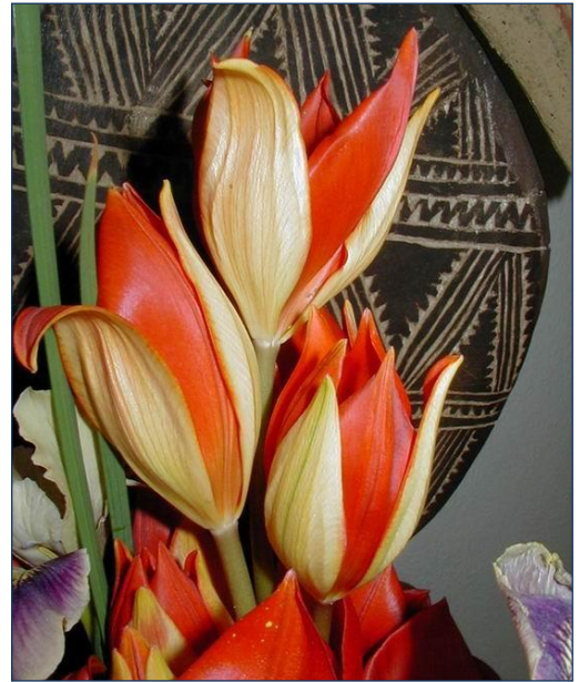
Above left: T. sprengeri seedheads, – said to be the delight of flower arrangers. Above right: The beautiful reverse of the flowers - the cut flowers also stand well in a vase.