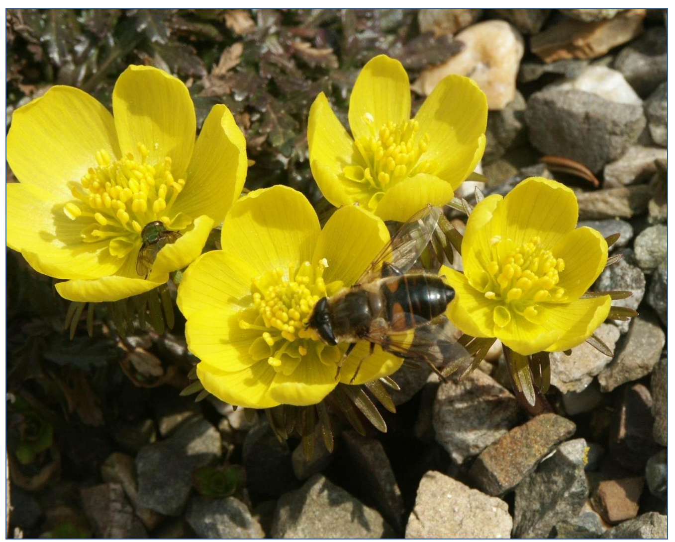
Eranthis cilicica in the garden of Luc Gilgemyn

The yellow flowering species: These 3 species and one hybrid are all easily distinguishable.