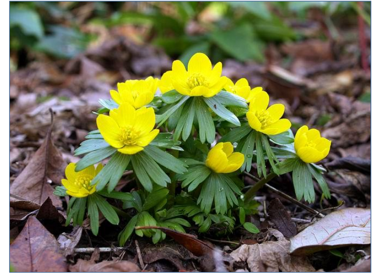
Eranthis longistipitata (Syn.: Shibateranthis longistipitata )

This yellowish-orange flowering species is native to Central-Asia (i.e. Uzbekistan, Afghanistan, Iran, Kyrgyzstan, Turkmenistan). It grows in places which are reasonably humid during the growing season. After the plants die down, their growing places become very dry and that's exactly what this magnificent plant appreciates in the garden! The more orange coloured plants might be another species, subspecies or variety, but this has not been researched as yet.