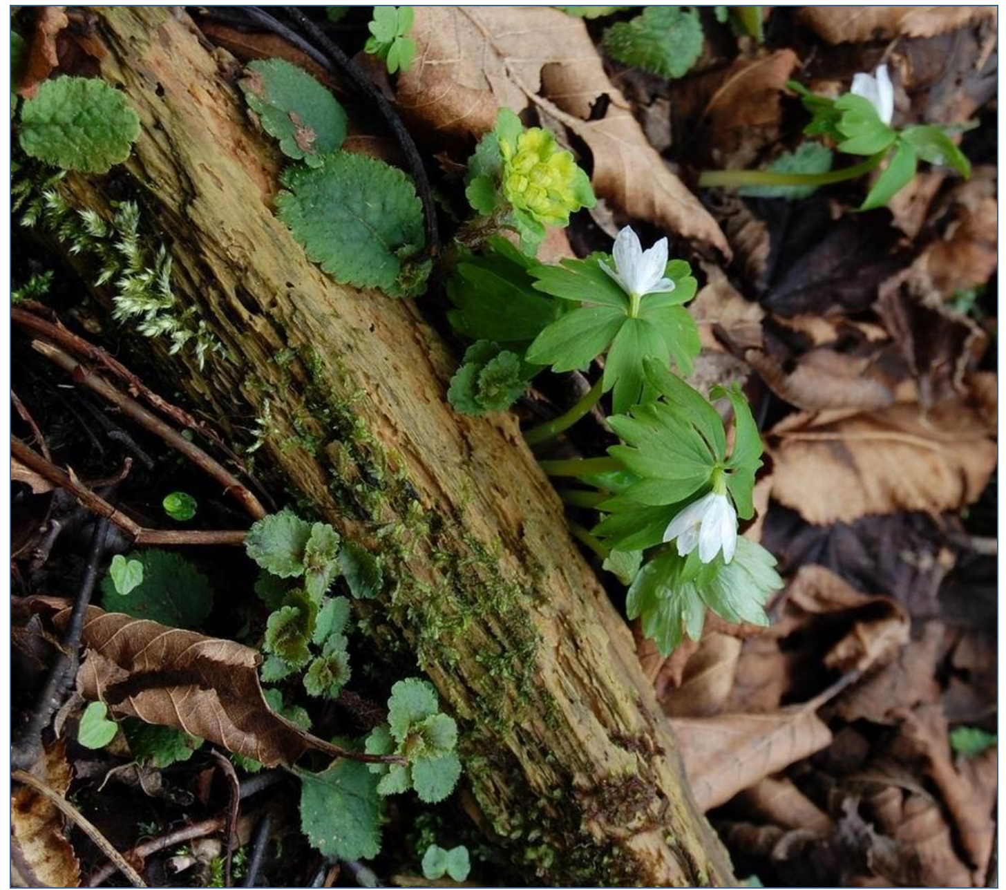
Eranthis lobulata var. elatior pictured in bloom at Hailuogou, Sichuan

clearer difference is that the petals*, which are funnel-shaped in E. byunsanensis , are bifid in E. pinnatifida . Some taxonomists would like to put E. byunsanensis in with E. stellata . In my opinion E. byunsanensis is more similar to E. pinnatifida and E. albiflora than to E. stellata . Possibly there's also a variety of this species: E. byunsanensis var. pungdoensis , with broader petals*, that grows in a very small area in Korea.