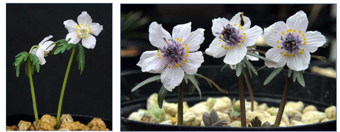
E. pinnatifida - albino form, left and pink form, right - from Soryo-Cho, Shobara-Shi, Hiroshima-Ken in the garden of Tatsuo Yamanaka in Japan.

This white-flowering species is endemic in Japan. E. pinnatifida has very distinctive flowers with blue anthers. This is one of the small differences with E. stellata , which grows on the mainland of Asia and has pink coloured anthers. E. pinnatifida also has finer laciniate leaves. Some quite <u>special forms</u> have been collected in Japan, including forms without anthocyanin. The flowers of these forms have white anthers, filled flowered forms or flowers with a pink touch on the sepals<sup>*</sup>.