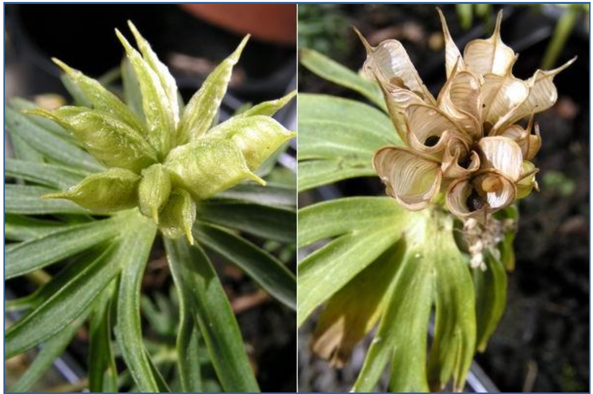
Eranthis hyemalis seedheads

The sowing of these species and cultivars is quite easy too and many of the named cultivars come back true. It's always best to sow the seeds as fresh as possible. Seeds which have been kept dry and at room-temperature for a couple of weeks will certainly have lost their germinating capacity. Sow them on a well-drained medium which never dries out completely. A sowing medium consisting of equal parts of potting soil and sharp grit or perlite does quite well for me. Leave the sowing pots outdoors. They need at least one period with frost to germinate. Most of the time they will give 100% germination in the following spring.