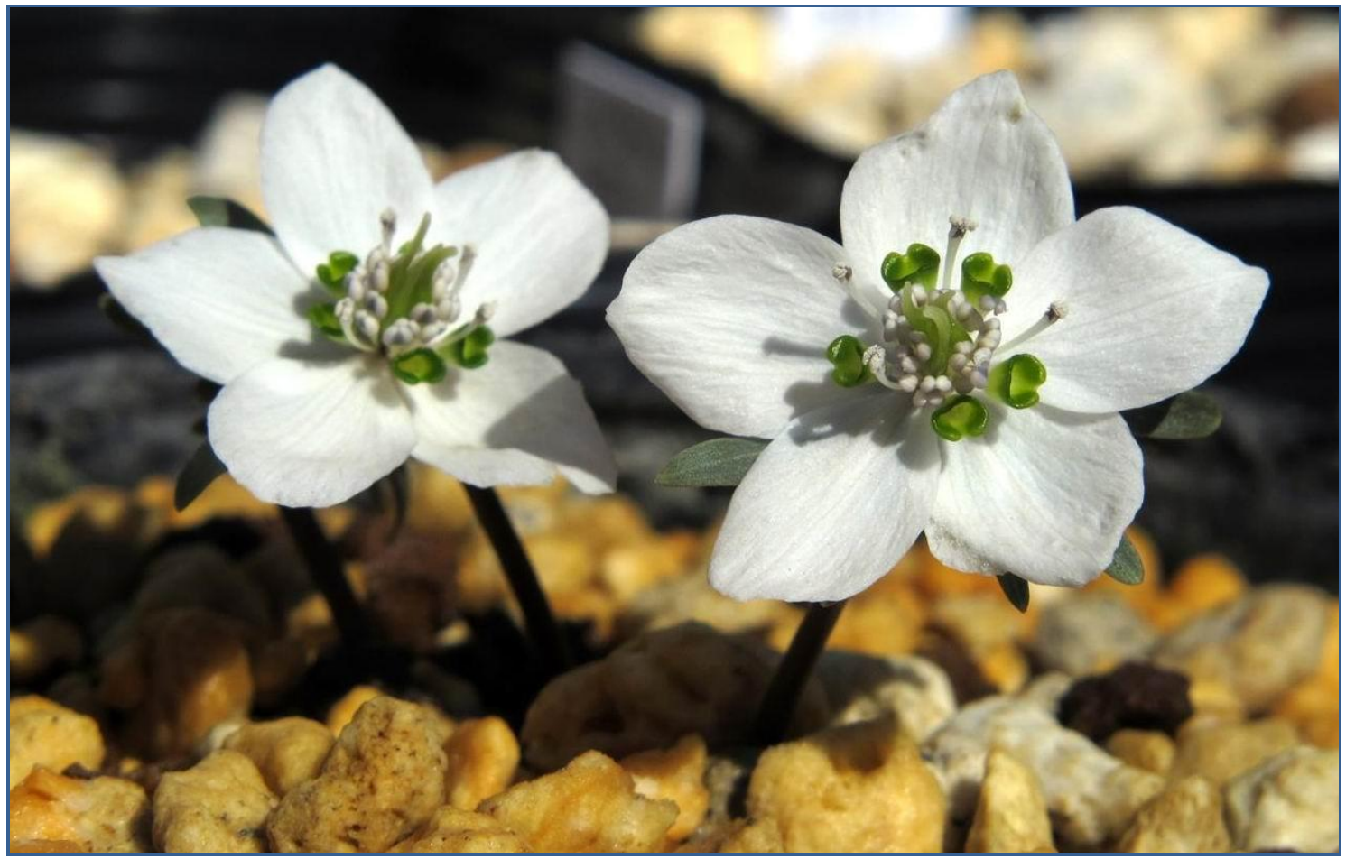
Eranthis byunsanensis grown in the garden of Tatsuo Yamanka

A Chinese species, native to the west of Sichuan, with white flowers, very similar to E. stellata . There are a few, very small differences between them. E. albiflora has glabrous flowering stems, while E. stellata has pubescent flowering stems. E. albiflora has 4-5 sessile carpels which are glabrous and E. stellata has 6-9 pubescent carpels on a small stalk.