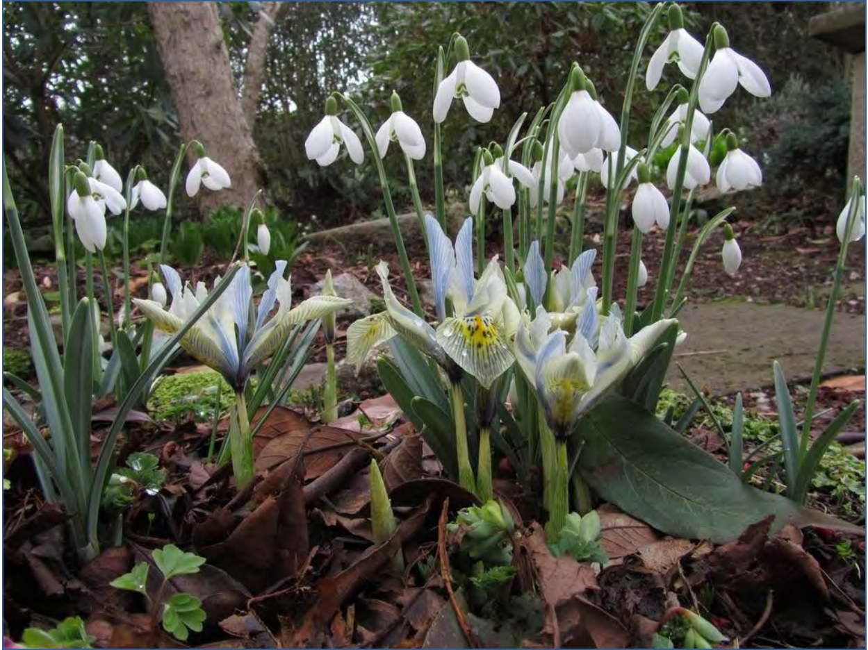
Galanthus and Iris 'Katharine Hodgkin'