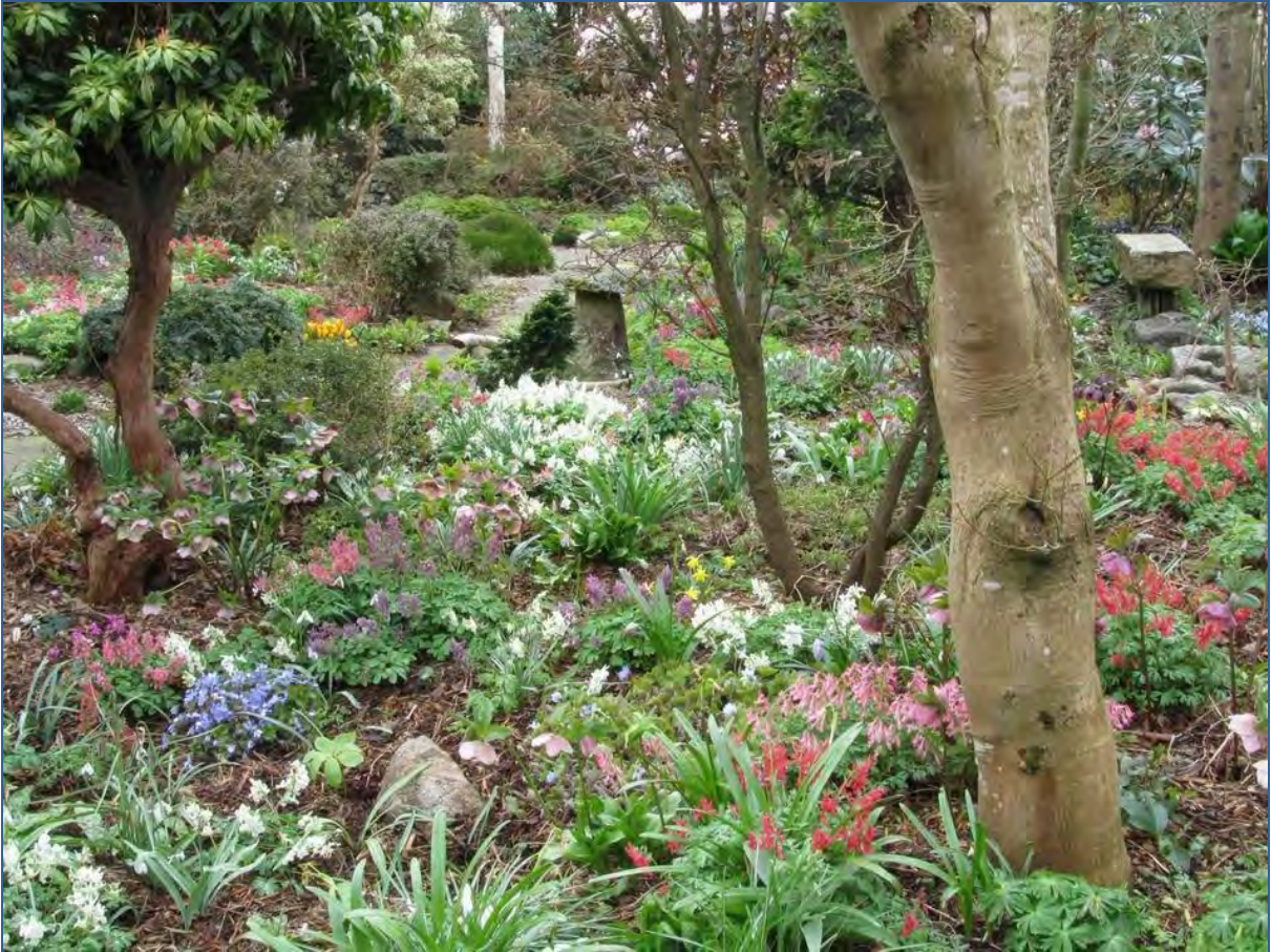
Corydalis malkensis and C. solida coming into their own.