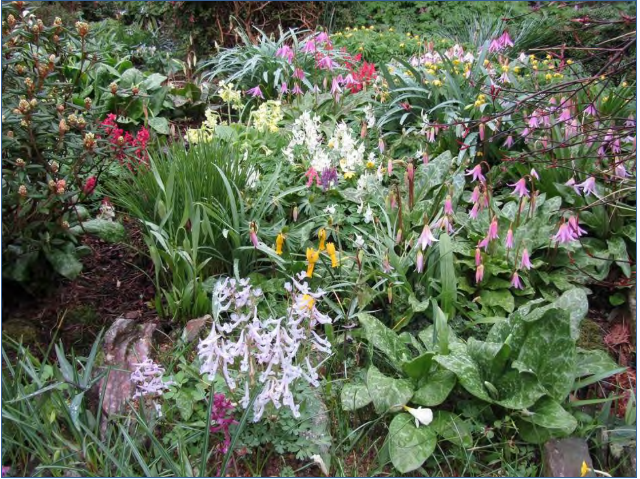
We favour a lush planting with as much ground covered as possible.