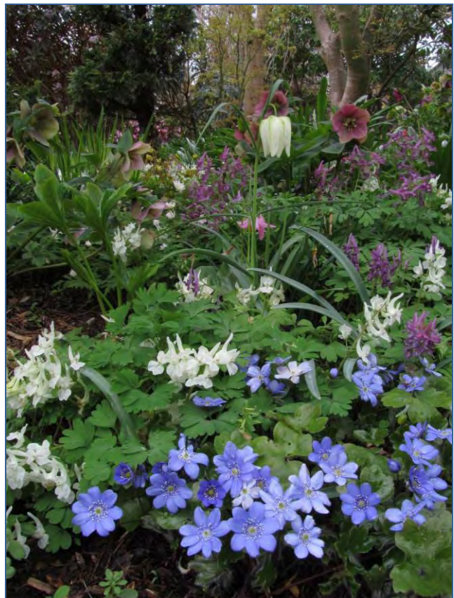
Mixture with Hepaticas and Helleborus .