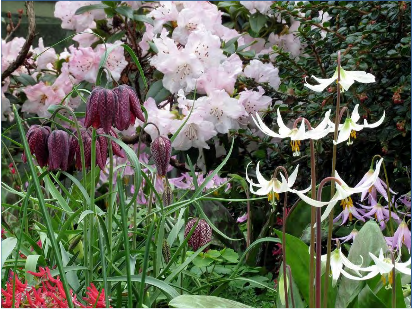
Variations of form whether in shape, colour, size or foliage all add to the interest of a flower bed.