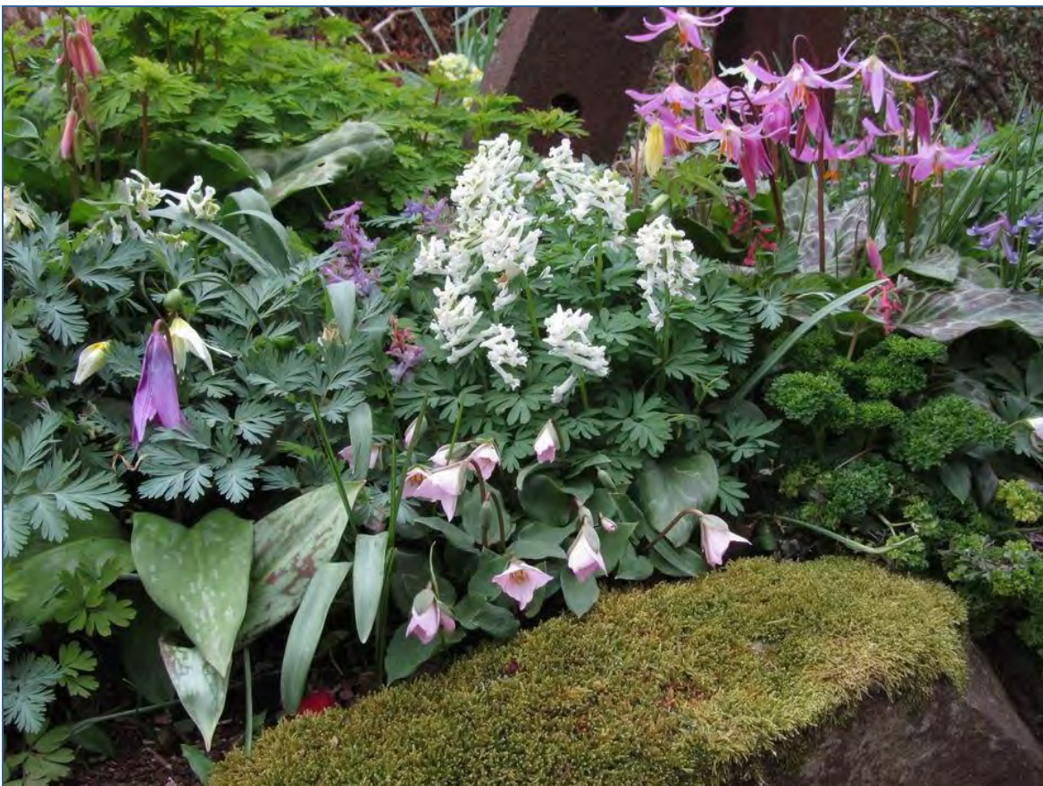
A white form of Corydalis solida grows in a community with Trillium rivale , Erythronium revolutum , E. japonicum , Dicentra cucullaria and a stray culinary herb Petroselinum crispum forming a beautiful tapestry of foliage with colour highlights provided from the flowers.