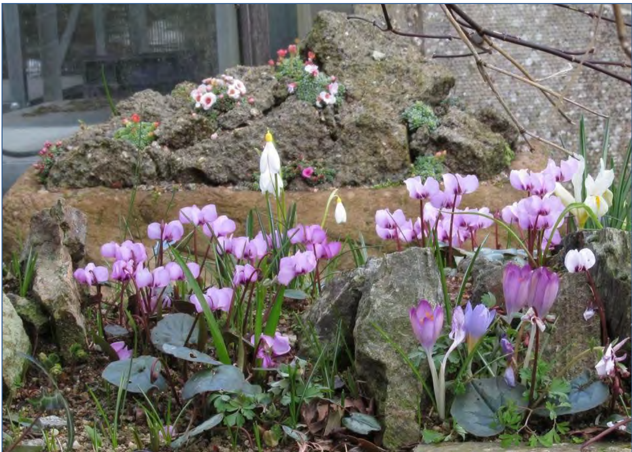
Cyclamen coum , Galanthus 'Elizabeth Harrison', Crocus , Iris , with a new Saxifraga trough behind.