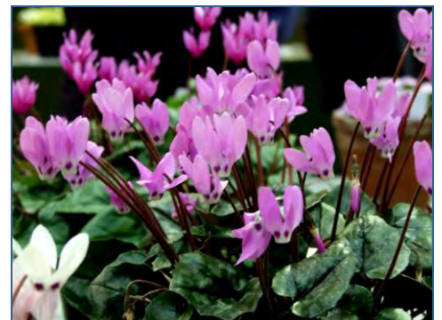
C. pseudibericum ; C. x schwarzii C. x schwarzii