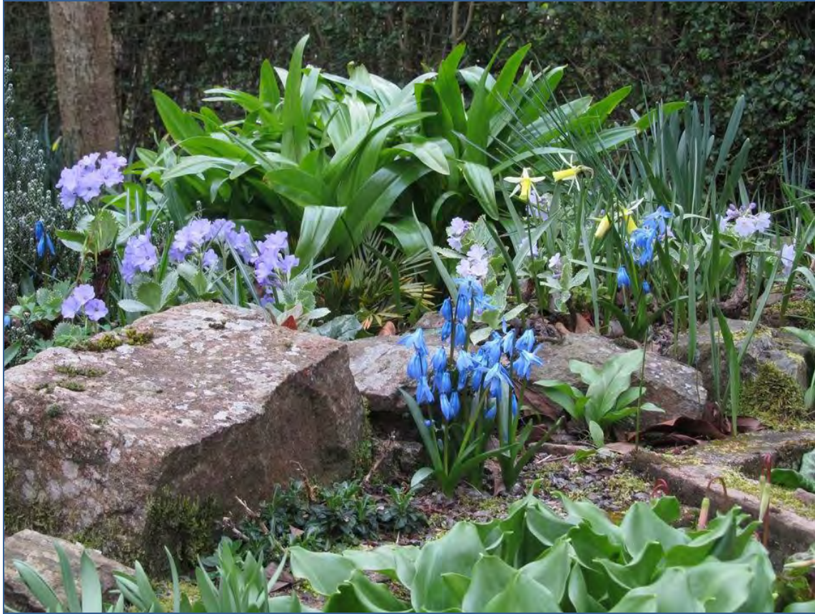
Colchicum agrippinum foliage, Scilla , Narcissus 'Snipe' and Primula marginata forms.