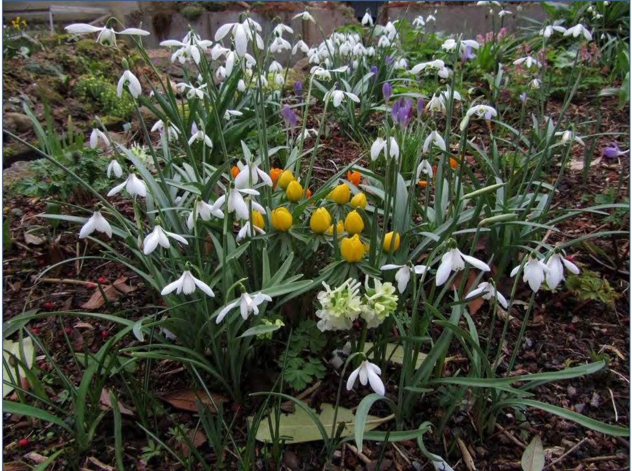
Eranthis hyemalis centrepiece with the first Corydalis malkensis .