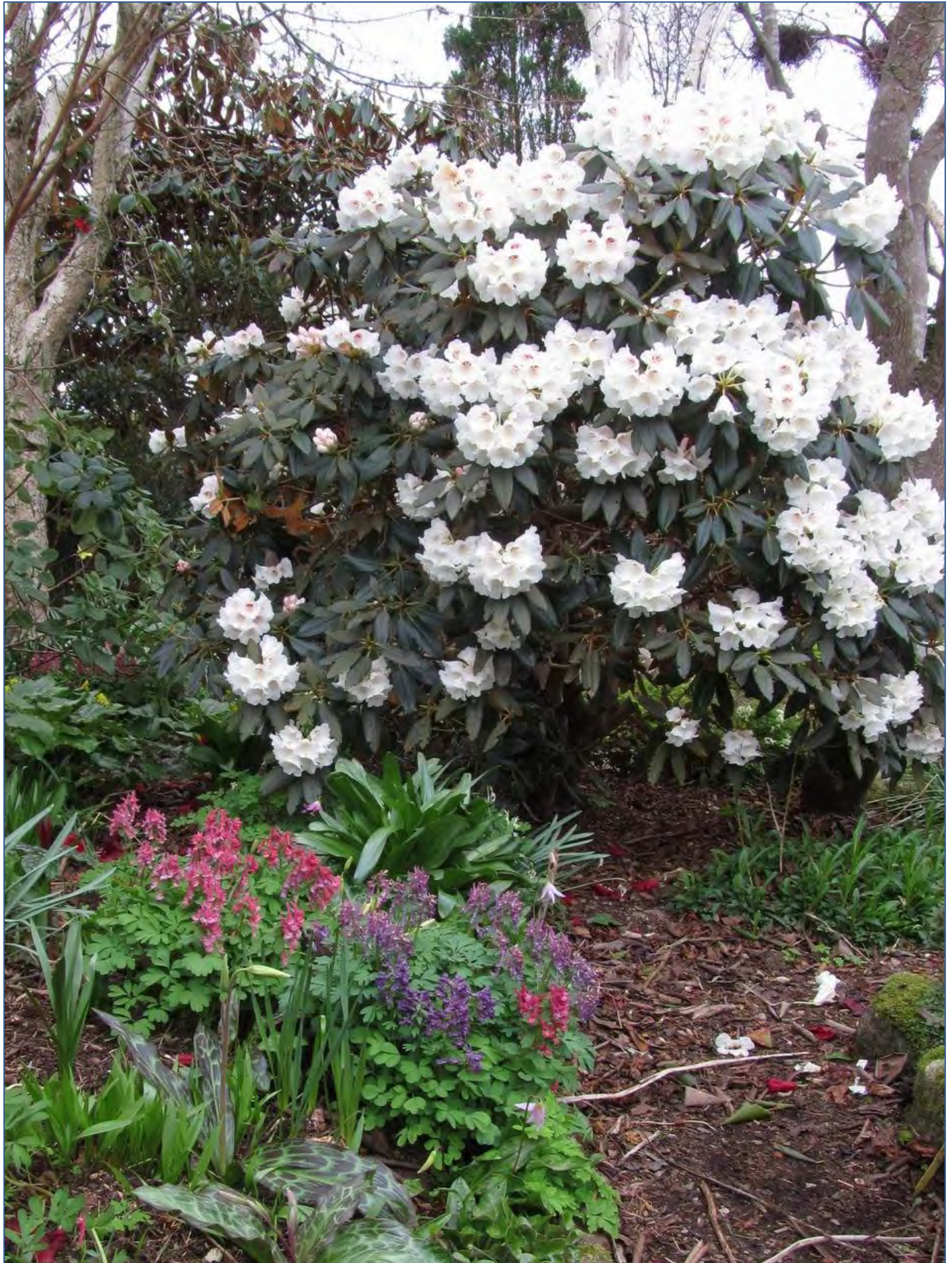
Rhododendron pachysanthum is an old favourite, flowering just as the Erythronium season begins.