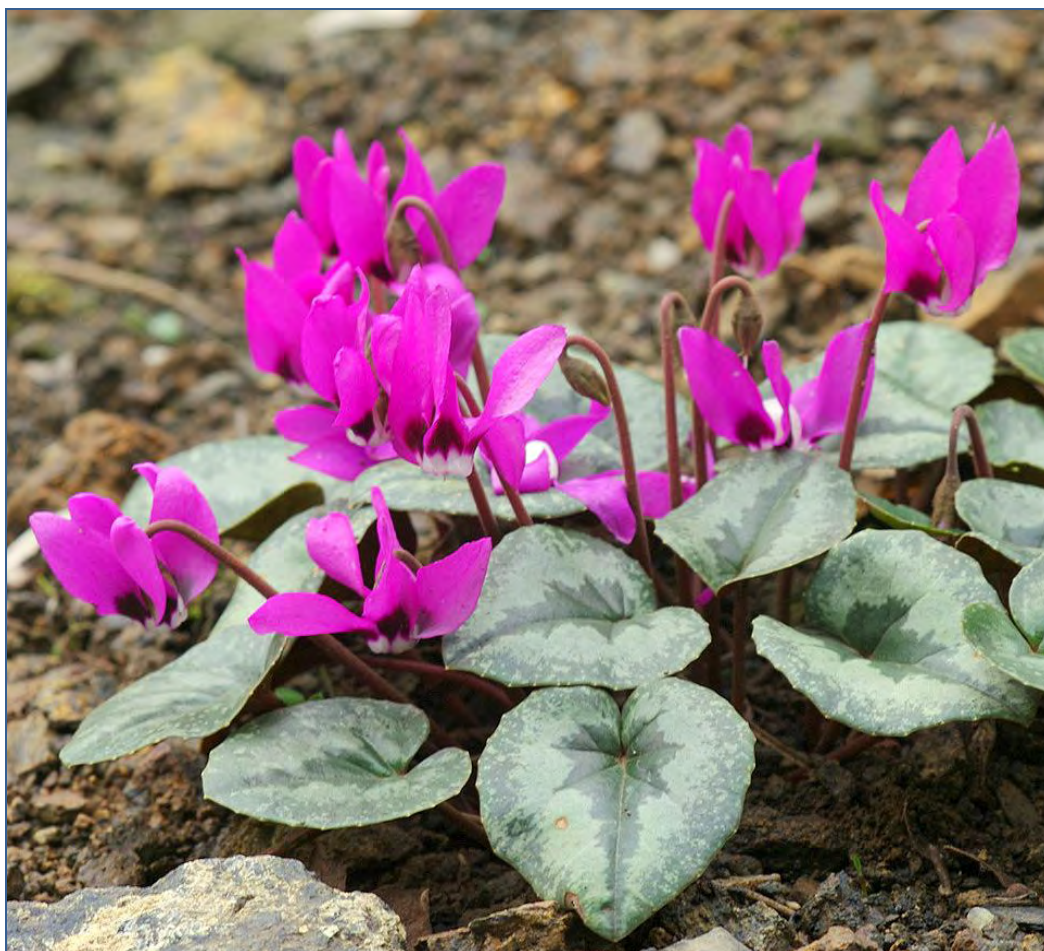
Cyclamen pseudibericum var. pseudibericum from Turkey

My Cyclamen purpurascens ( C. europeum ) is from Slovenia, Slovakia (plain leaf C. p. forma fatrense ) and Moravia. They do not provide self sown seedlings in my dry spring steppe conditions. I tried the white Cyclamen hederifolium from Stara Planina Mts. of Bulgaria and it died, so I keep this species from the late Joyce Carruthers' garden in Victoria, BC, Canada; this species is also reluctant to make seedlings here. Cyclamen mirabile is established in a flat area shaded under a larger shrub of Daphne transcaucasica . My Cyclamen colchicum from Kirsten Andersen was somehow lost too. Of course the best rock garden show is orchestrated by Cyclamen coum var. coum and partly by C. coum var. caucasicum . Hundreds of baby grassy seedlings appeared after every wet autumn and milder winter. Thanks to Joyce I have a broad flexible variation in colours of flowers and leaves. I never water them and they are able to cope with quite lot of the hot Bohemian sunshine and dry winds.