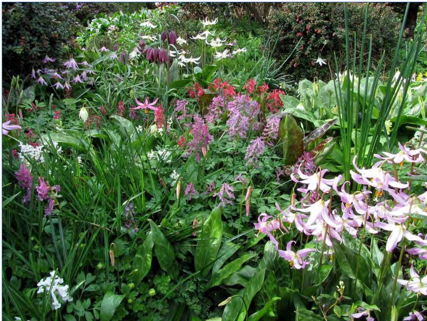
Painting with flowers

Spring in an Aberdeen Garden text and photos J. Ian Young