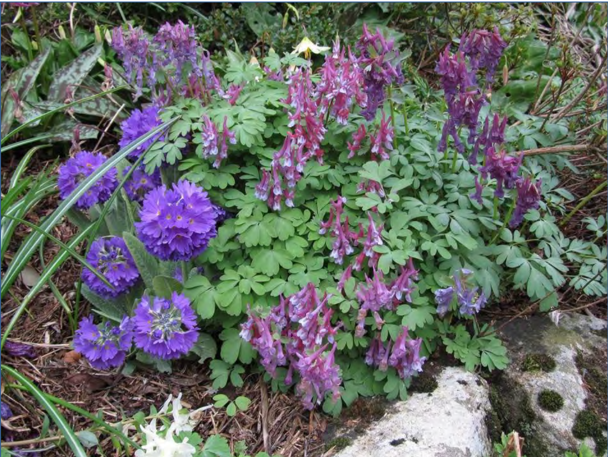
Something of a "purple patch" – Primula cachemiriana and Corydalis solida seedlings.