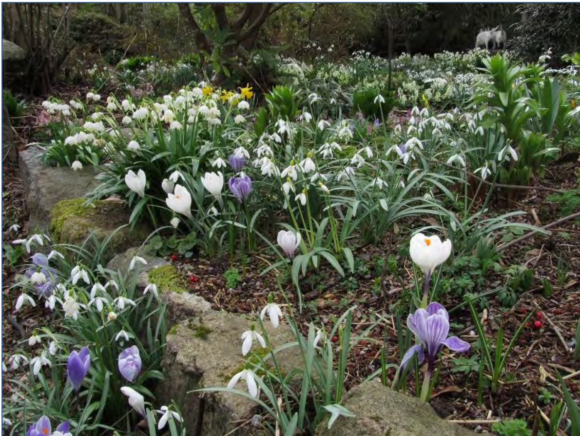
Galanthus with old Crocus vernus hybrids - spot the other 'small whites', top right.