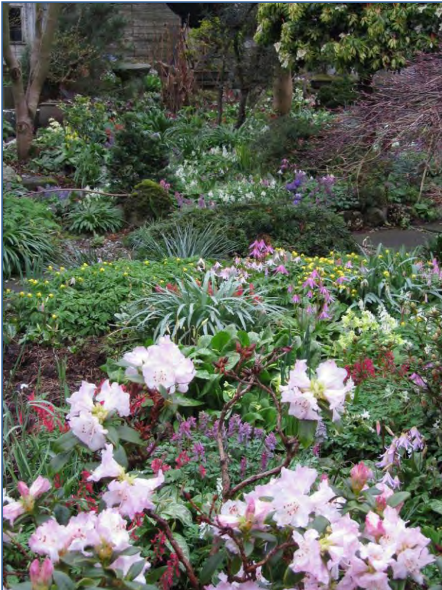
View across a Rhododendron ciliatum .