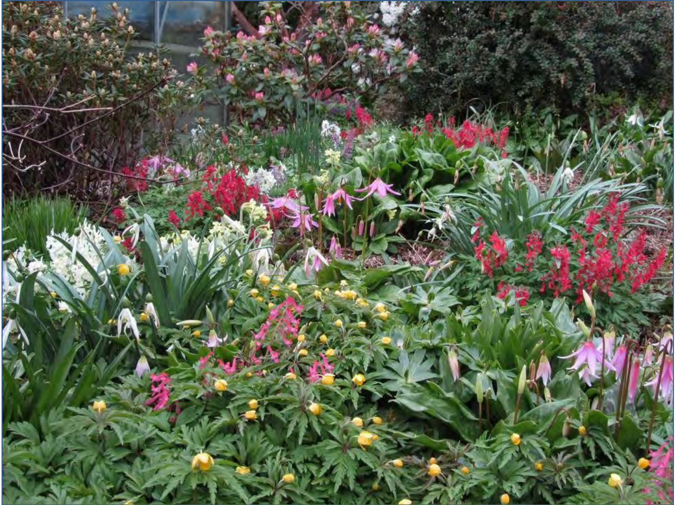
Anemone ranunculoides in the foreground.