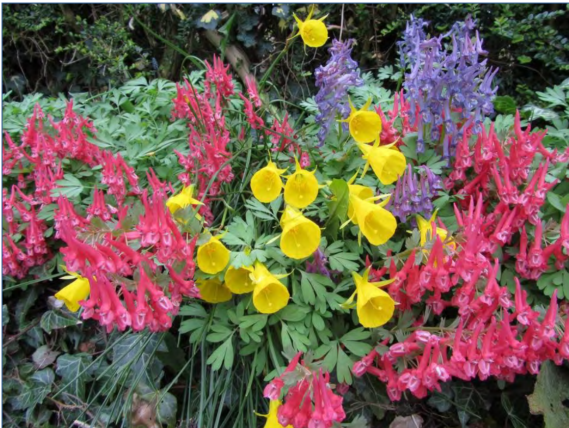
Corydalis solida with Narcissus bulbocodium .