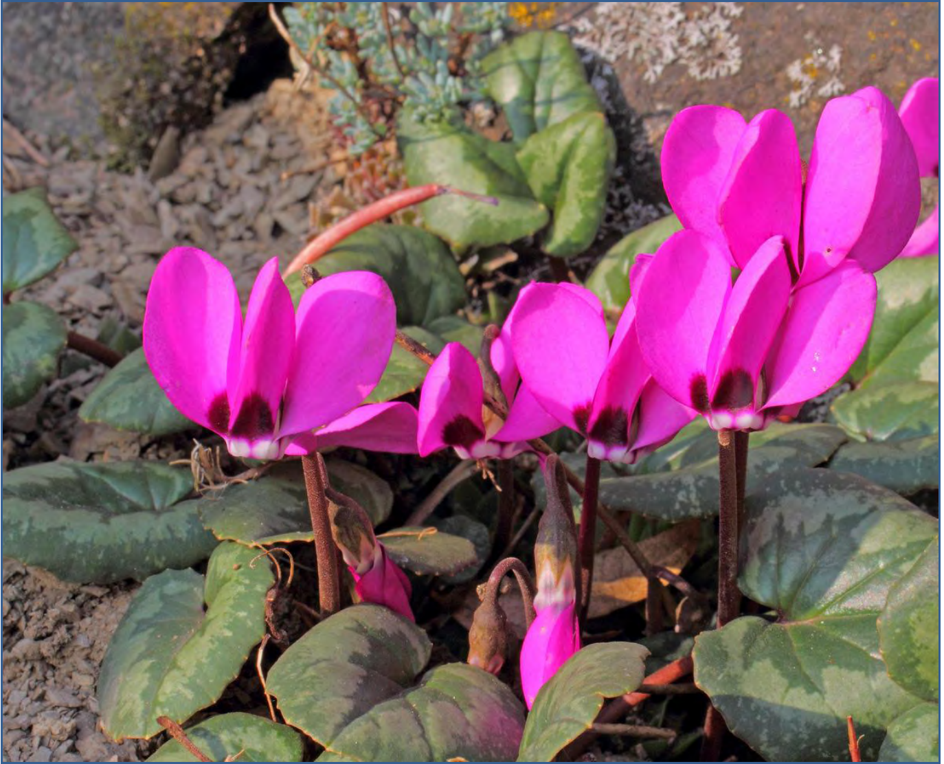
Cyclamen x schwarzii in the Beauty Slope

the stock in a pass at an elevation of 1400m in Anatolia, somewhere north of Kahraman-Maras. The flowers are magenta red and this species flowers later than C. coum and for longer time. The leaves are thicker in substance, heart shaped and pleasantly glossy. All my friends were excited by its large flowers and I distributed a few plants to the best growers. I will pronounce this species hardy, because of a few very tough winters when they survived.