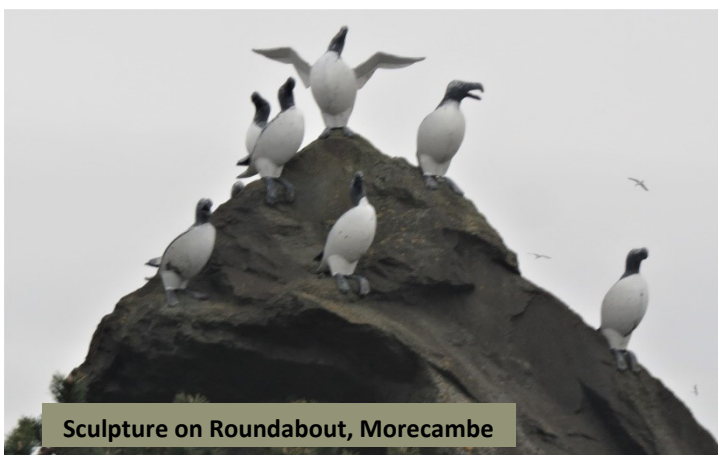
Sculpture on Roundabout, Morecambe

OUR JOURNEY TO KENDAL The Dunblane part of the Leven family planned to visit the Kendal show after a family gathering at Frodsham, a historic market town near Chester. There we stayed at The Old Hall Hotel which proved to be a good base from which to visit Bodnant Garden in the Conwy valley. Spring springs earlier down there than up in Dunblane. The magnolias were flowering in the woodlands. The star attractions were the Winter garden and the Daffodil meadow which is protected by a Ha-ha from marauding members of the public. I think this was the first true day of warm sunshine we had enjoyed for many weeks or months.