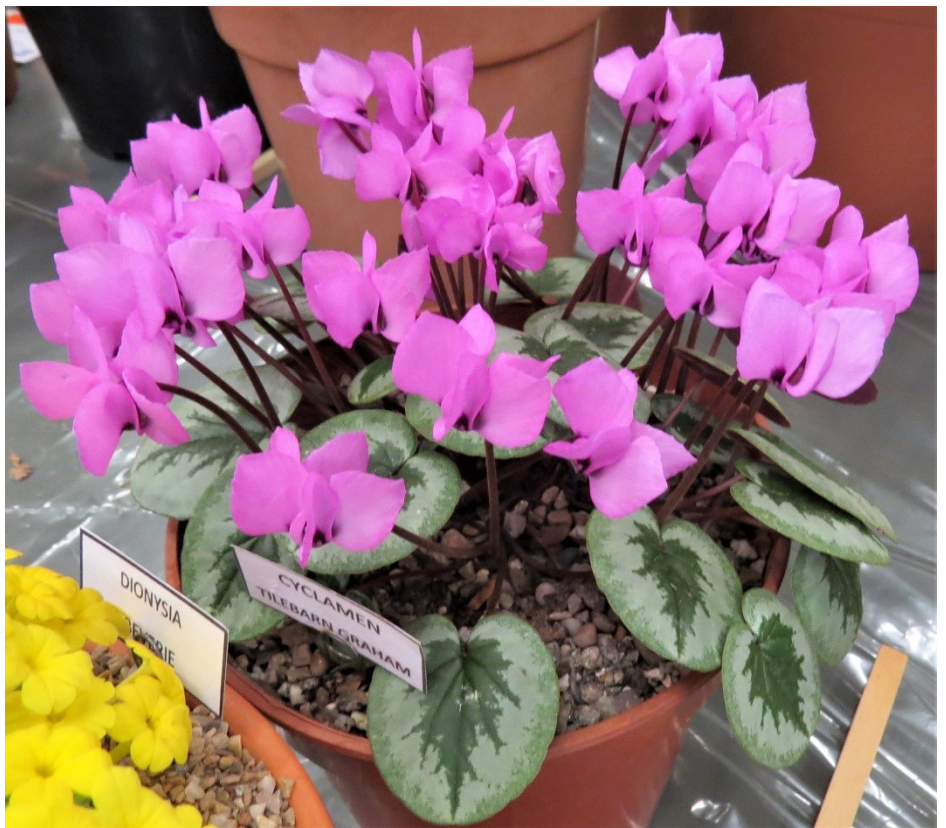
Jim Watson included an excellent plant of silver leafed Cyclamen coum 'Tilebarn Graham', another selection worth seeking out. All these Cyclamen coum make excellent plants for a winter flowering trough. Sometimes the birds regard the buds a winter treat. Class 56 for one pan Asiatic Primula demonstrated attracted a number of attractive plants Peter Hood won with Primula henrici below, left