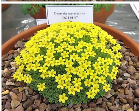
Dionysia sarvestanica DZ 1.01-07