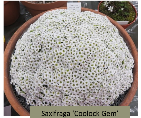
Saxifraga 'Coolock Gem'