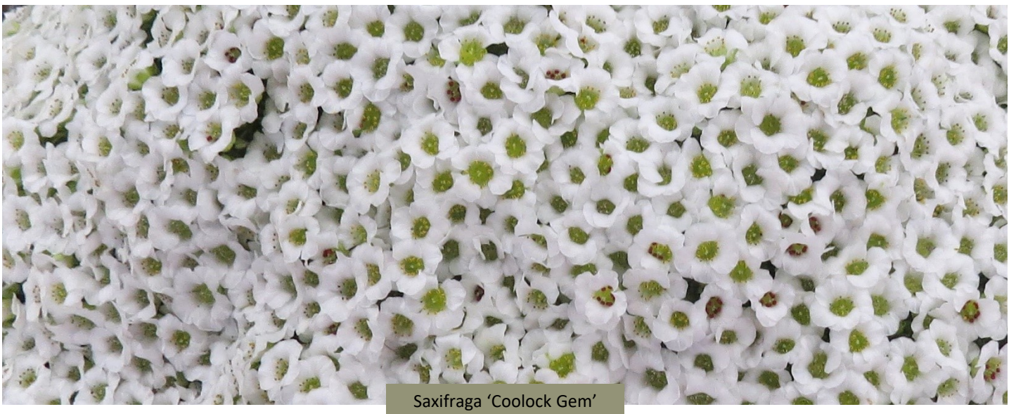
Saxifraga 'Coolock Gem'