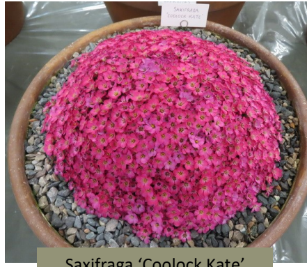
Saxifraga 'Coolock Kate'