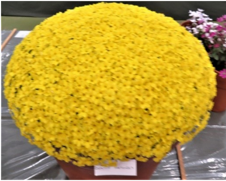
Dionysia aretioides Own seed sown 2008 "Bevere x"

Grown in a very free draining compost of equal parts J12, 5mm grit, sharp river sand, perlite, and vermiculite. The clay pot sits up to the rim in a sand bed, in a well-ventilated greenhouse positioned so as to provide maximum sun light. Shading from intense summer sunshine is provided when necessary. In late January it is placed in water with added potash and seaweed extract, up to half the depth of the pot, where it remains until the compost is thoroughly soaked. It is then returned to a moist sand bed for the remainder of the year. D. aretioides is a vigorous grower which needs to be frequently placed into a larger pot. This has to be done with care as any root disturbance will be fatal. The greatest threat to the plant's well-being is when it is in full flower, because moisture coming from the leaves can be trapped amongst and under the petals. This quickly leads to an onset of botrytis and so, to guard against this, all of the flowers are removed.