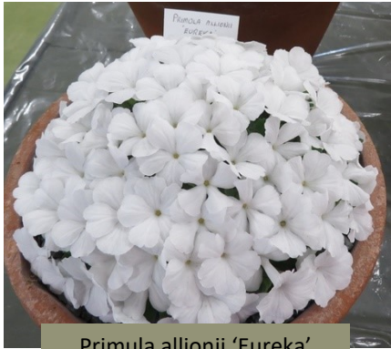
Primula allionii 'Eureka'