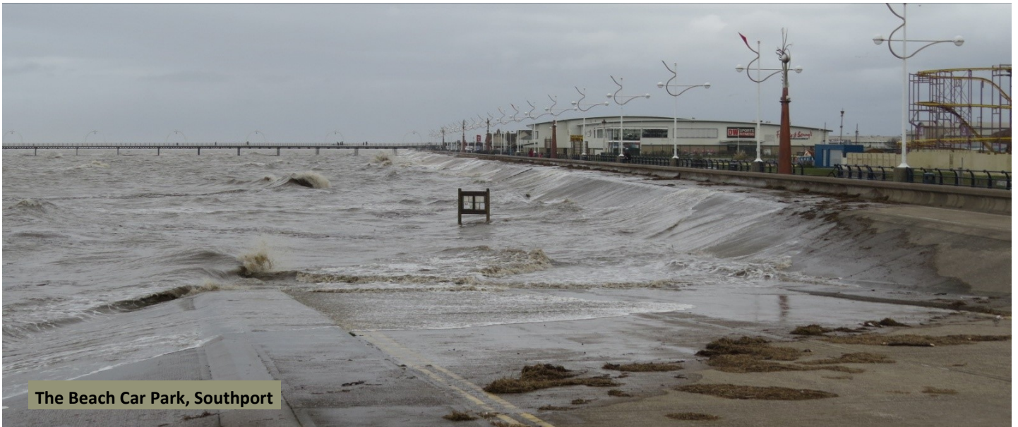
The Beach Car Park, Southport

sculptures scattered throughout Morecambe. They were all over the sea front, on roundabouts and in supermarket car parks. The tide was in so we did not see the beach but had good view over Morecambe Bay to Grange-over-Sands and the mountains of the Lake District.