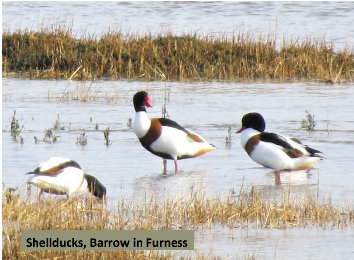
Shelducks, Barrow in Furness