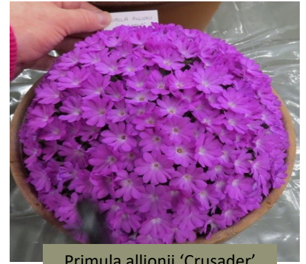
Primula allionii 'Crusader'