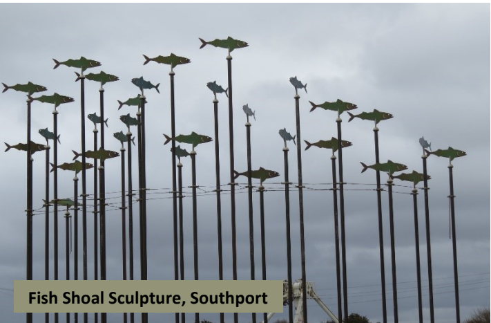
Fish Shoal Sculpture, Southport