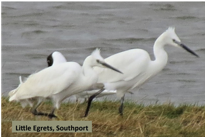
Little Egrets, Southport