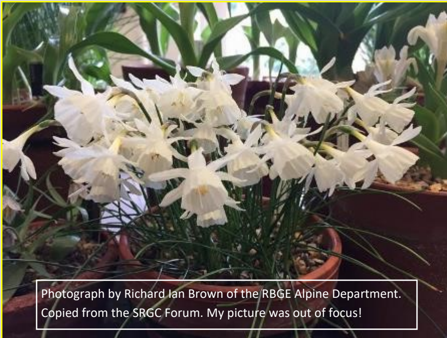
Photograph by Richard Ian Brown of the RBGE Alpine Department. Copied from the SRGC Forum. My picture was out of focus!

Shown by The Regius Keeper of The Royal Botanic Garden, Edinburgh