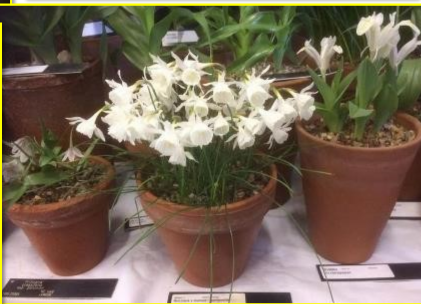
of Narcissus x susannae