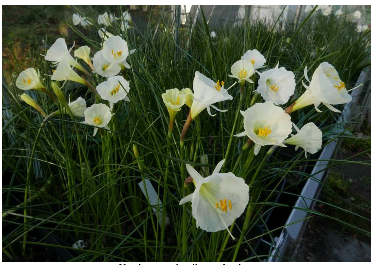
Narcissus romieuxii mesatlanticus