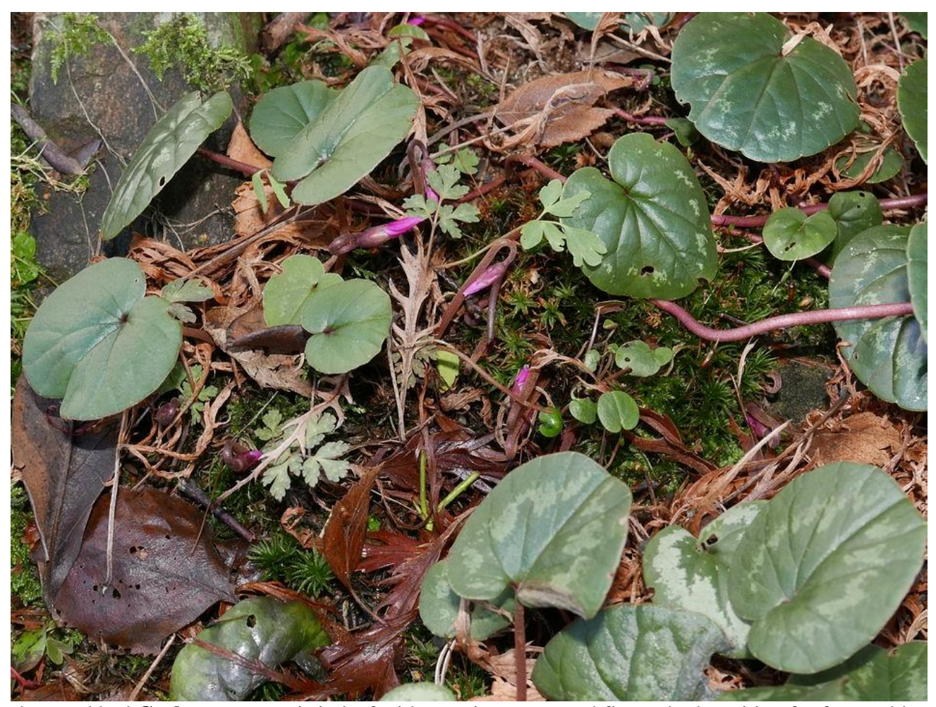
In a garden sand bed Cyclamen coum is in leaf with growing stems and flower buds waiting for favourable conditions to flower and you will notice, from the cluster of small leaves, the seed from last year's flowers are germinating where they fell from the capsule.