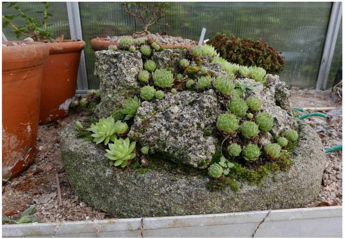
There have been many changes in the glass houses over these years and now that I have been cutting back on the number of pots of bulbs I am finding room for some plants in pots to overwinter including this small demonstration trough planted with Sempervivums. Coincidentally, like in the previous image, there are also pots of Daphne in the background of this image.