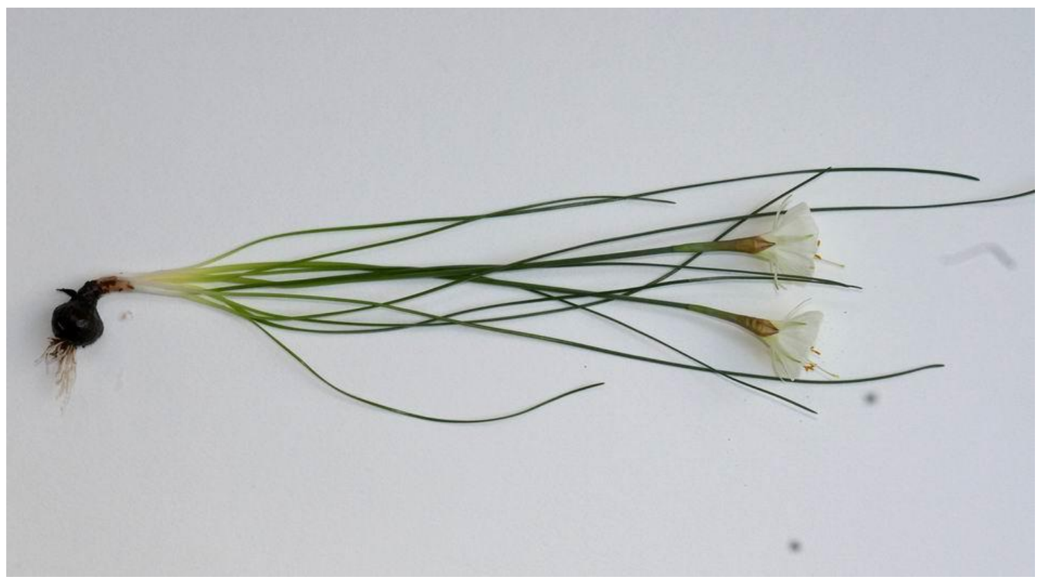
While picking a few flowers I accidentally pulled this bulb out of the sand which gave me the opportunity to record it showing that it has produced two flower stems and nine leaves.