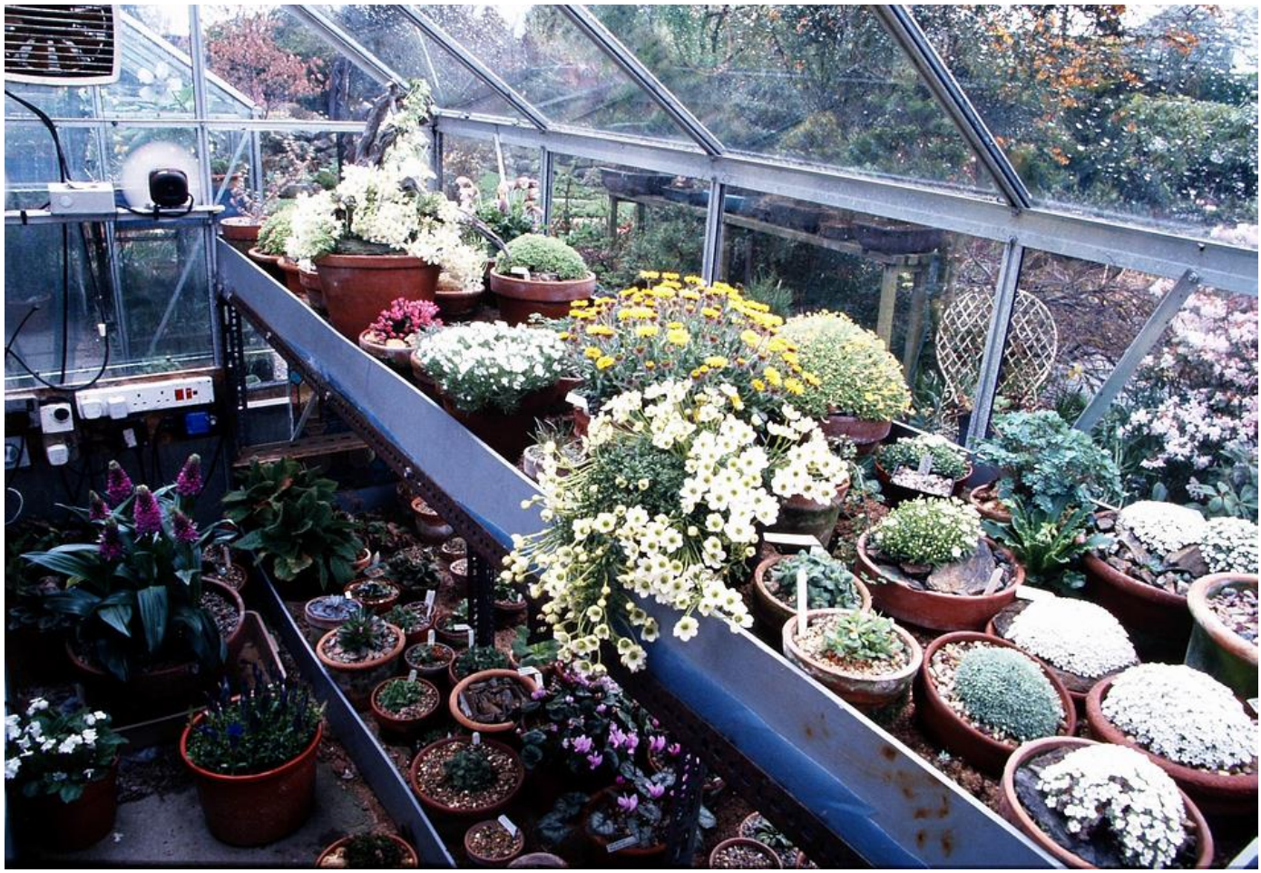
Two more iamges of then and now of the same glasshouse, above sometime in the early 1990's and below as it looks today with the bulbs growing in square plastic pots.