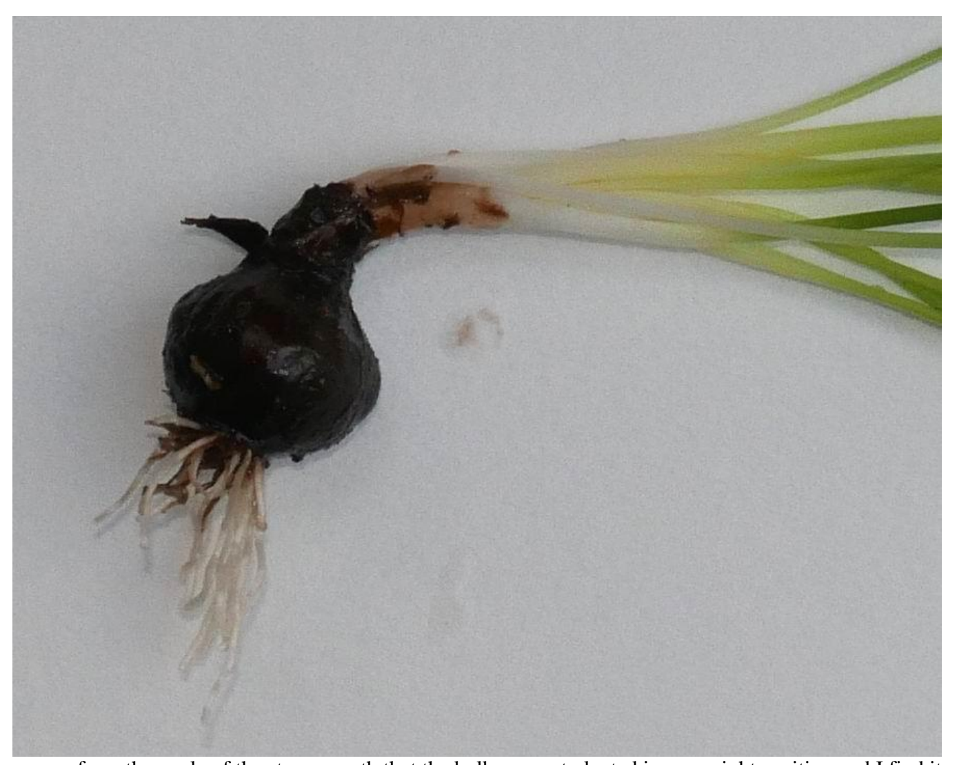
You can see from the angle of the stem growth that the bulb was not planted in an upright position and I find it interesting to observe that while the stems and leaves immediately turn through almost 90 degrees to grow upwards the roots as yet have not worked out the orientation and are coming straight out from the base of the bulb.