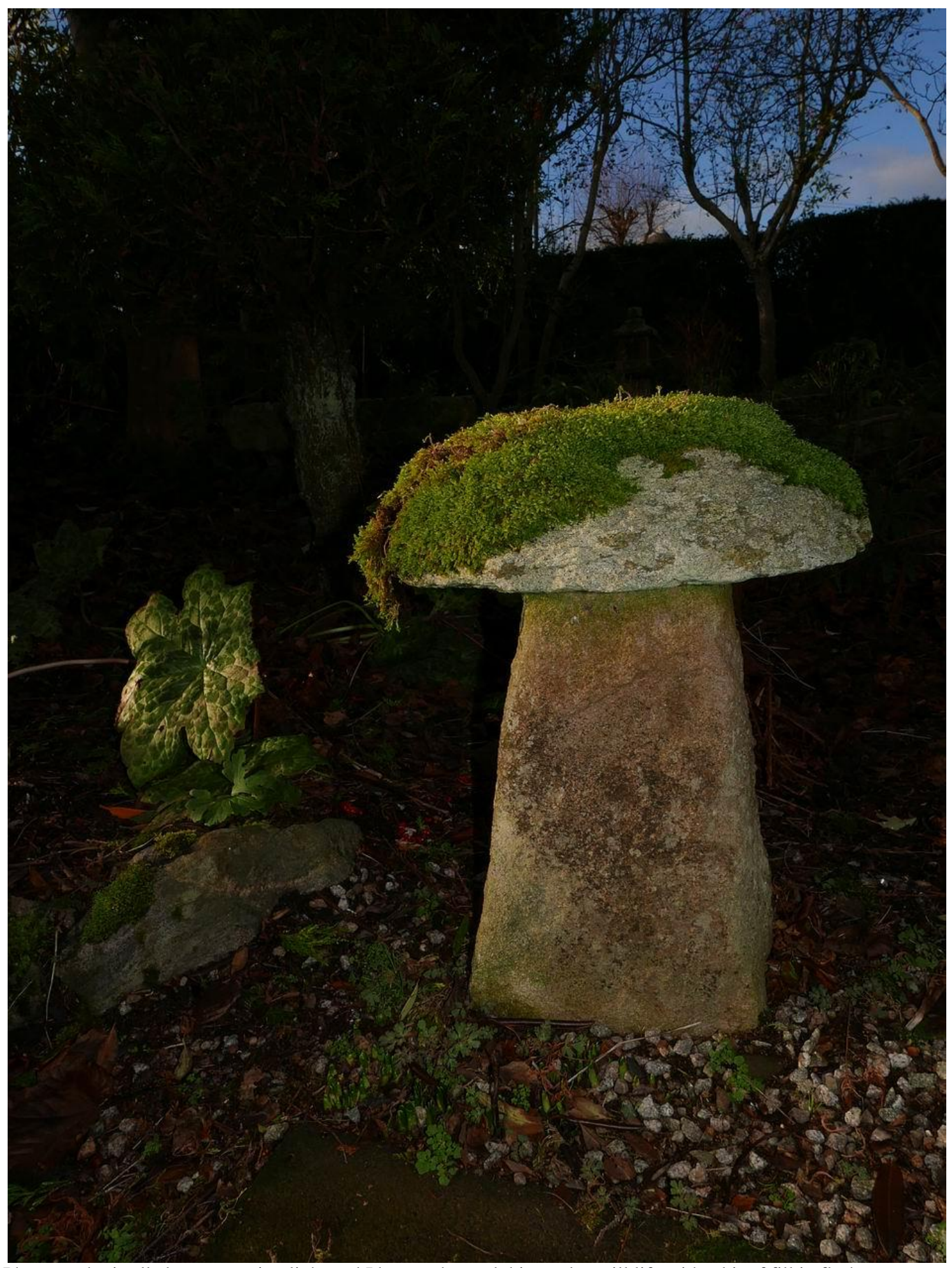
Photography is all about capturing light and I have enhanced this garden still life with a bit of fill in flash. The SRGC Early Bulb Day, where Ian Christie will also be giving a talk, is only eight weeks away so I will need to keep working to complete my talk in time and hope that you will join me in Dunblane on that day -16<sup>th</sup> February.....