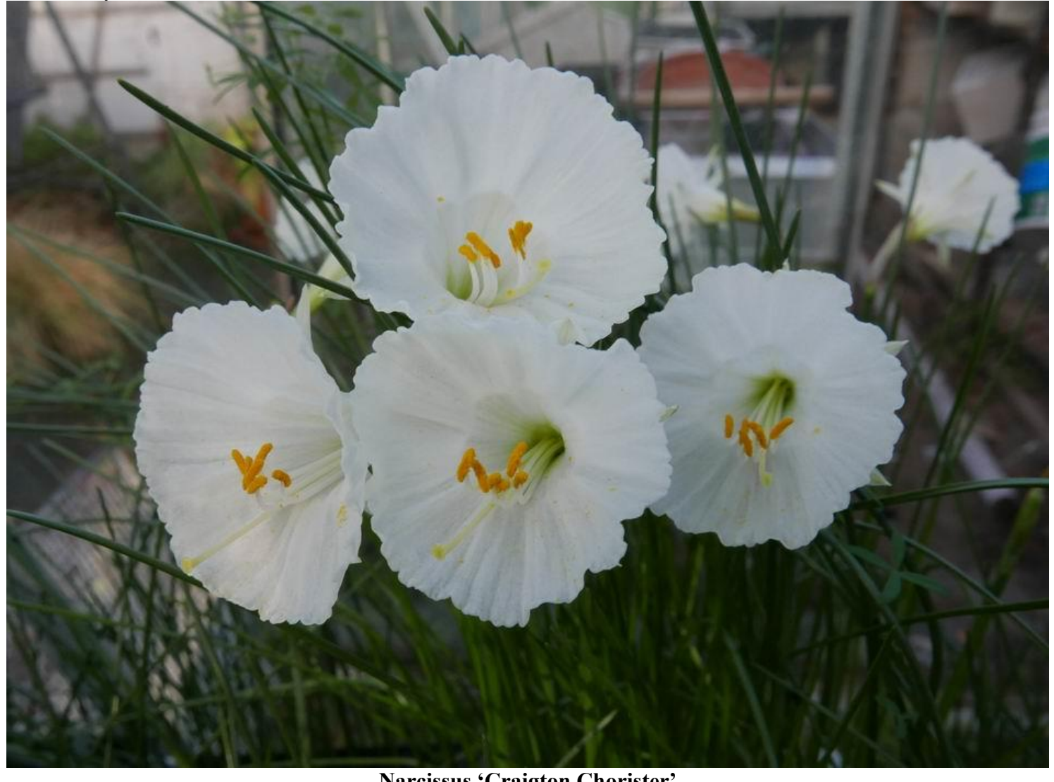
Narcissus 'Craigton Chorister'

Despite the stems being a bit floppy I still get great pleasure from the beautiful variations of flowers that brighten the dark days of winter.