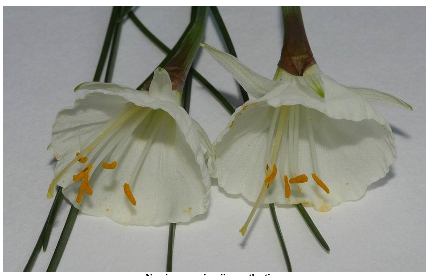
Narcissus romieuxii mesatlanticus