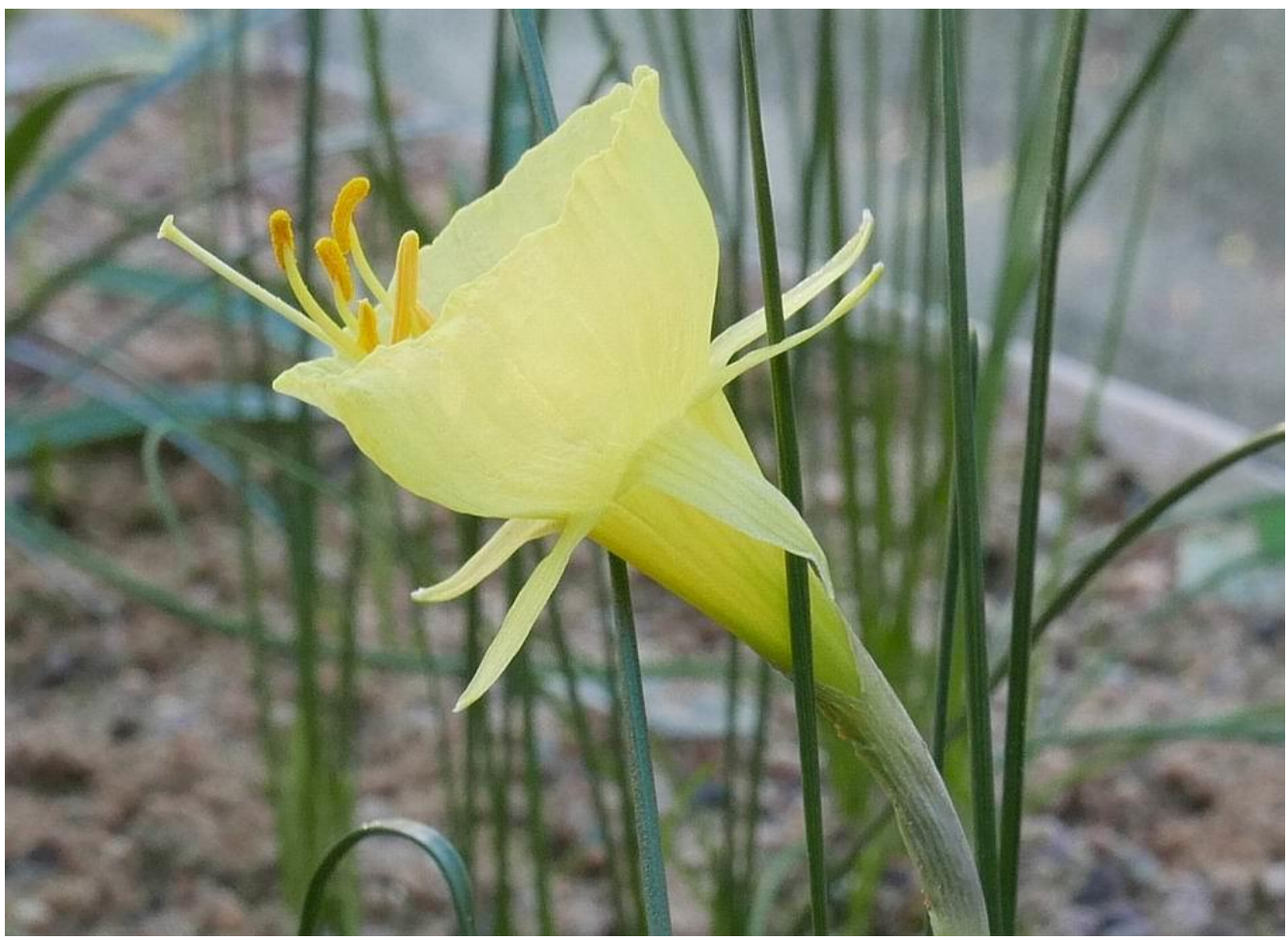
Another yellow Narcissus seedling has more of a funnel shaped corona.