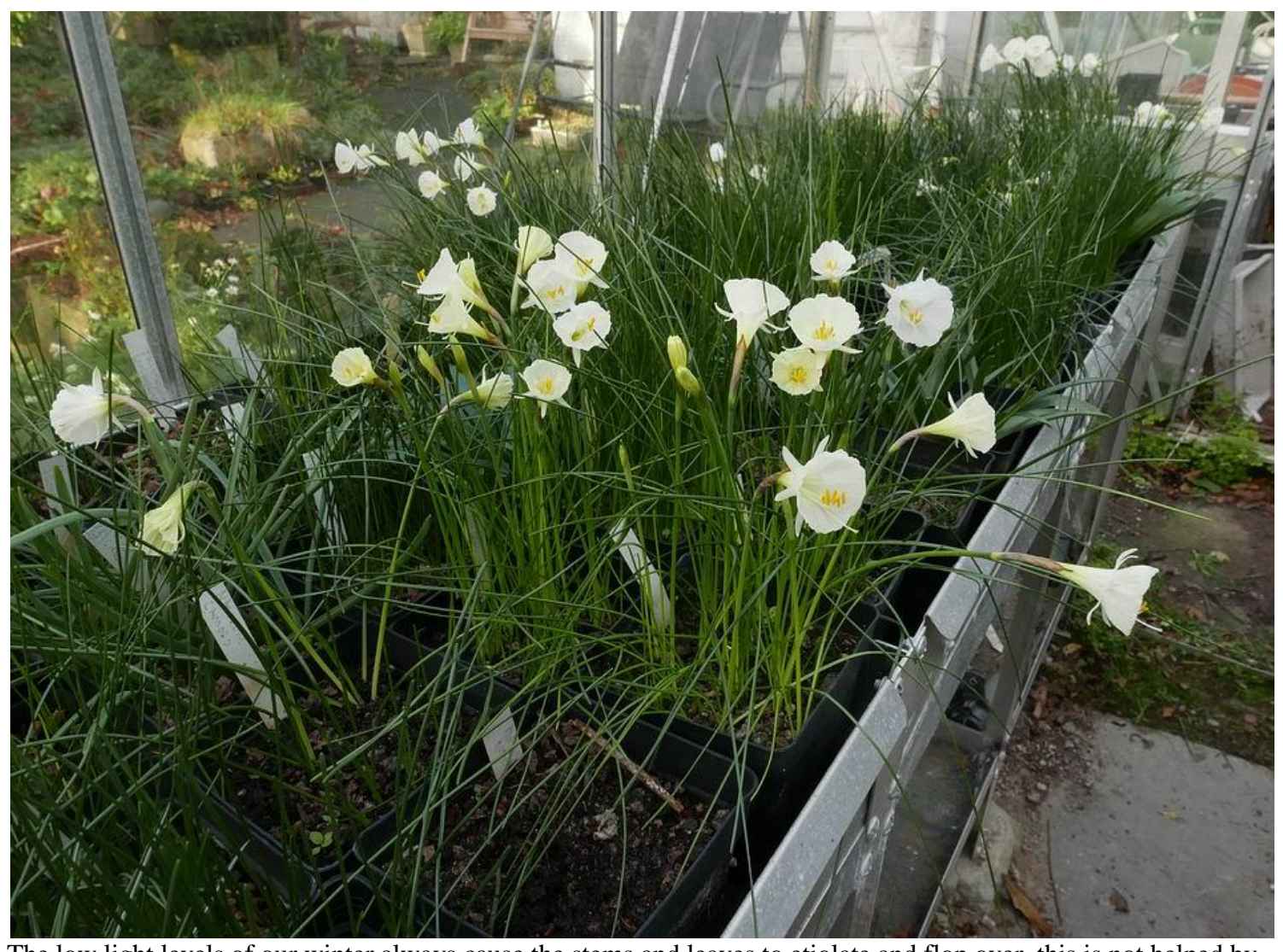
The low light levels of our winter always cause the stems and leaves to etiolate and flop over, this is not helped by them being grown closely packed together.