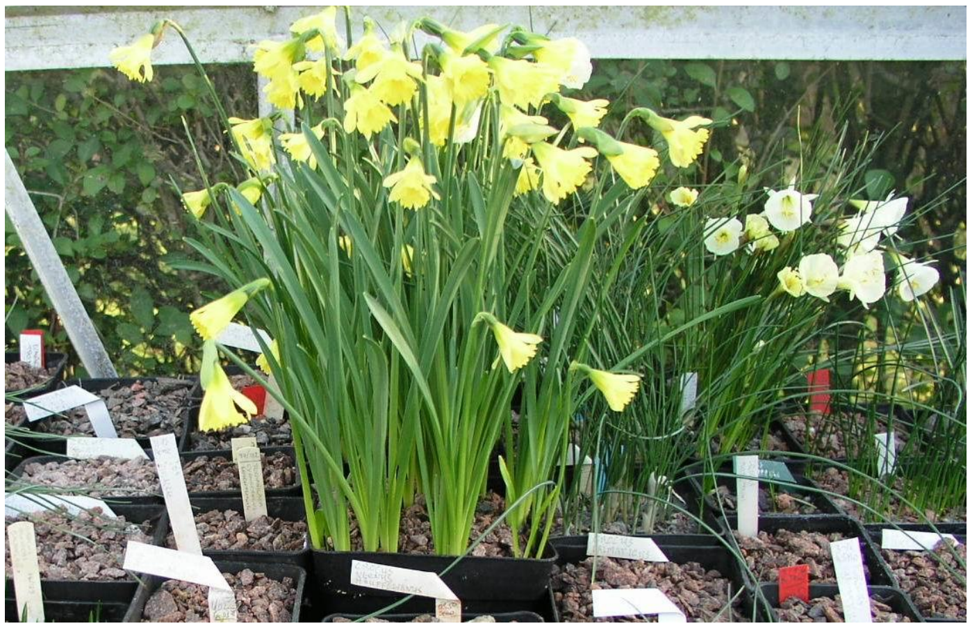
From 2003 this was one of two pots we had of Narcissus 'Cedric Morris' – it used to grow so well but now we only have one small patch of a few stems growing in the garden so I must try and increase it again.