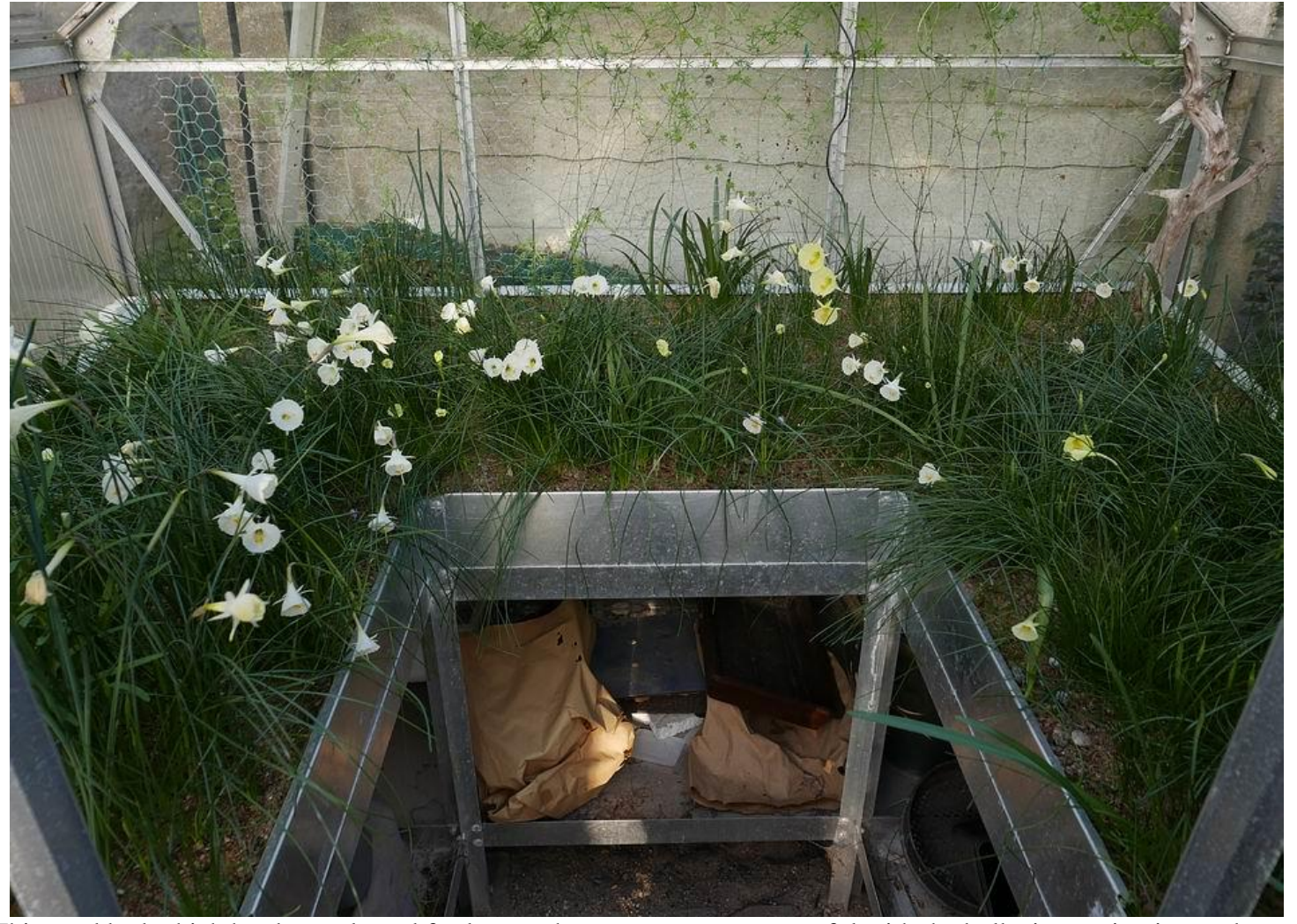
This sand bed which has been planted for longest has proven very successful with the bulbs increasing in numbers to the extent that they are now very crowded and having to compete for space and light.