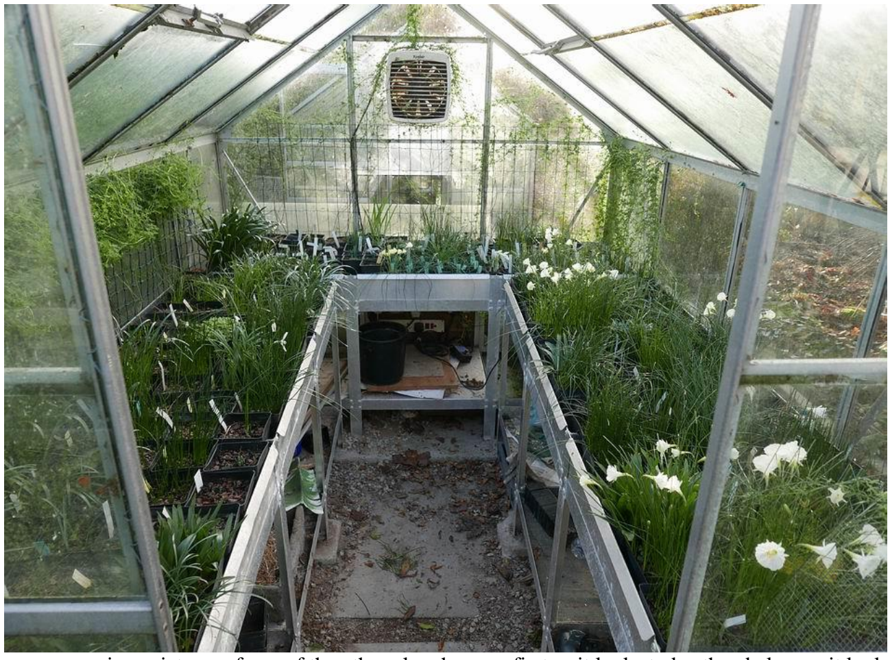
Some more comparison pictures of one of the other glass houses; first as it looks today then below as it looked in the early 1990's when we were still growing plants to take to Shows.