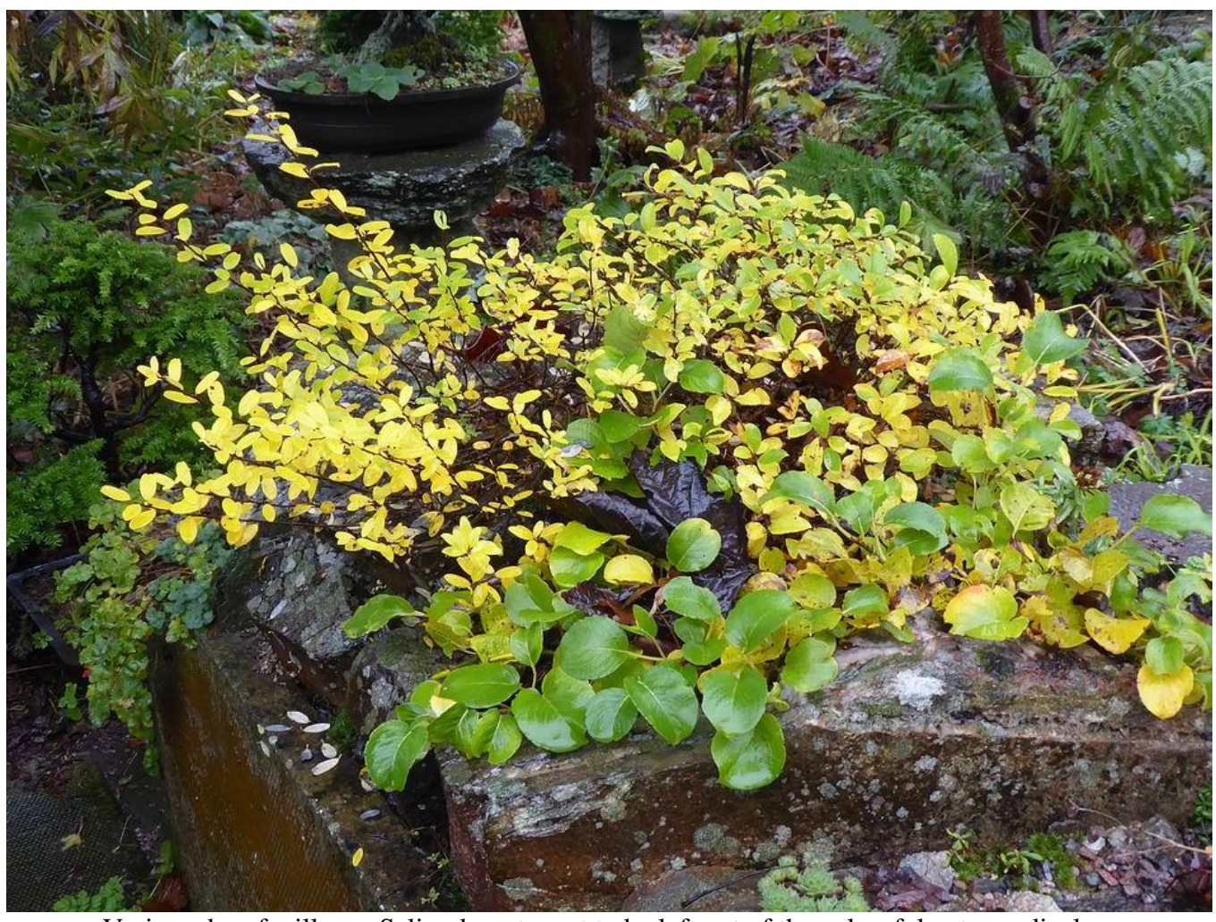
Various dwarf willows, Salix, do not want to be left out of the colourful autumn display.