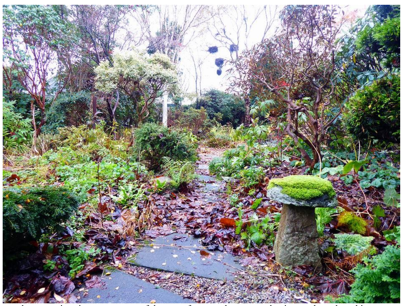
As the garden enters its winter state some of the stone features play a more dominant role such as this moss covered staddle stone.