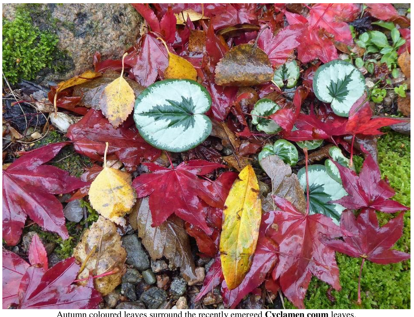
Autumn coloured leaves surround the recently emerged Cyclamen coum leaves.