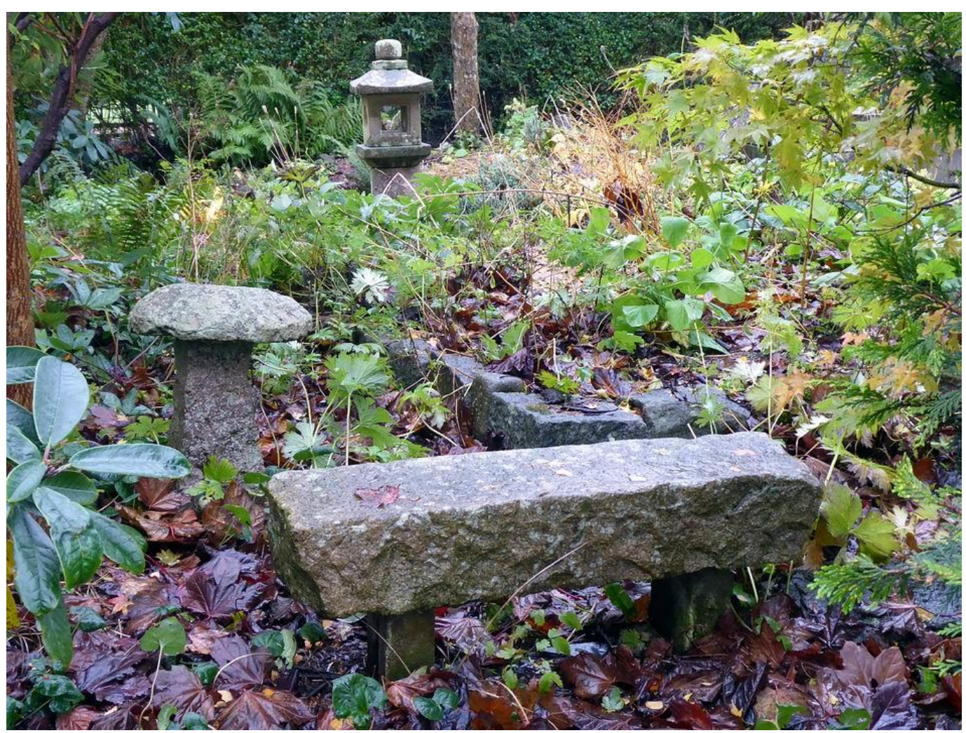
Looking west across the garden from the same path other stone features stand out as the annual growth retreats.