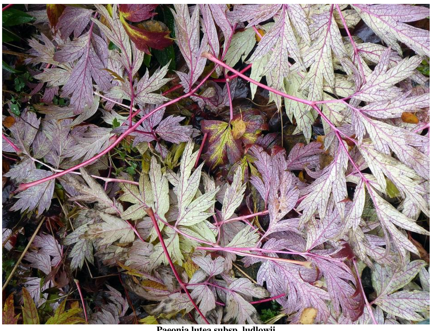
Paeonia lutea subsp. ludlowii