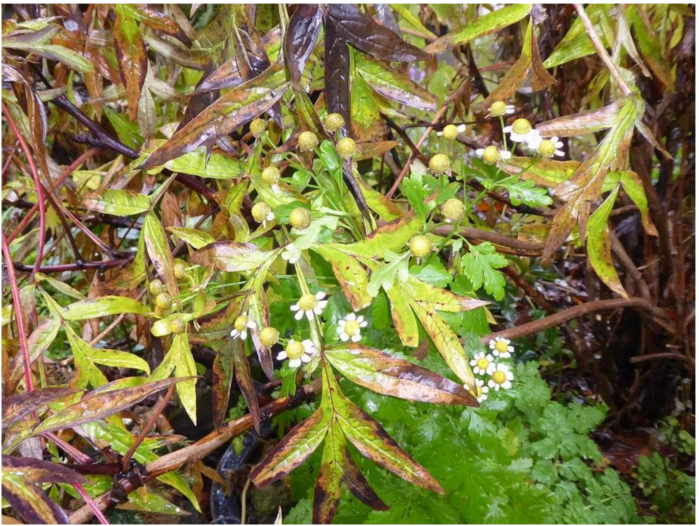
Interesting images can be found everywhere if you look – some Tanacetum parthenium flowers produce highlights among the dying foliage of Paeonia delevayii.