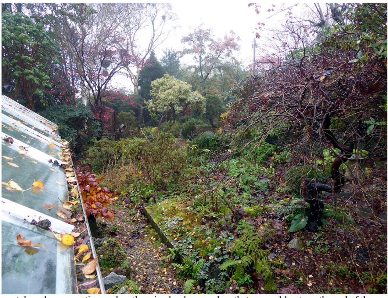
In recent days there were times when the rain cloud was so low that we could not see the end of the garden.