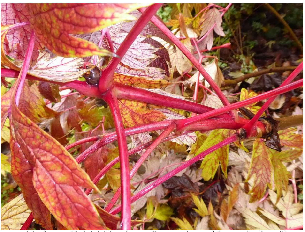
The few remaining leaves with their bright red stems cling on to the top of the stems but they will soon drop.