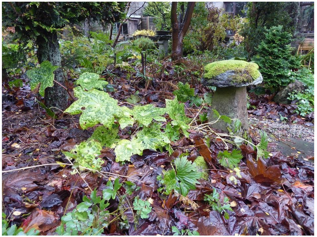
Podophyllum 'Spotty Dotty' still hangs on to its leaves.