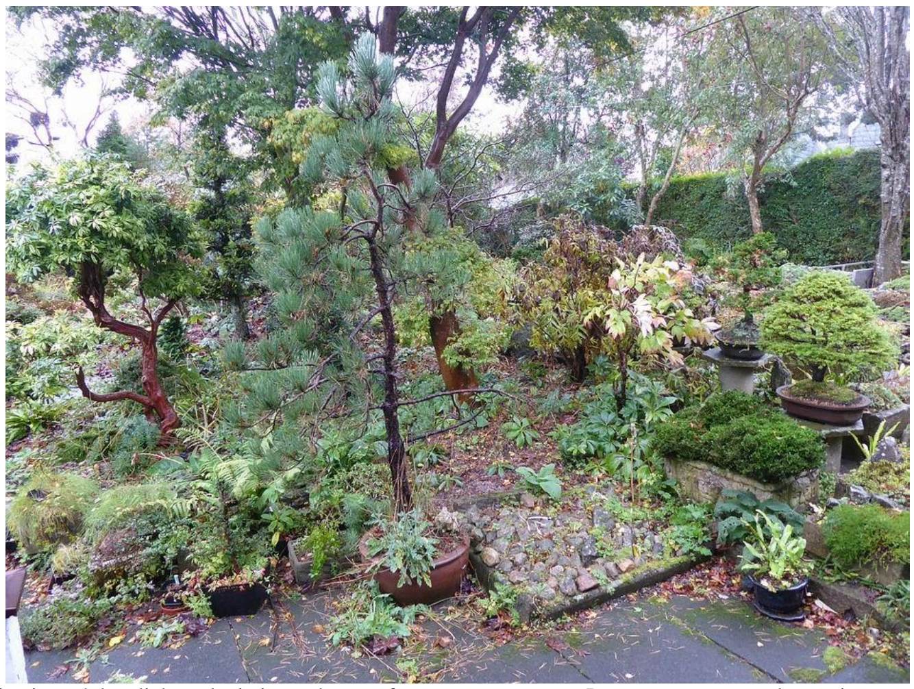
Working in such low light and rain is another test for my new camera as I venture out to record some images starting with the view from the back door step.