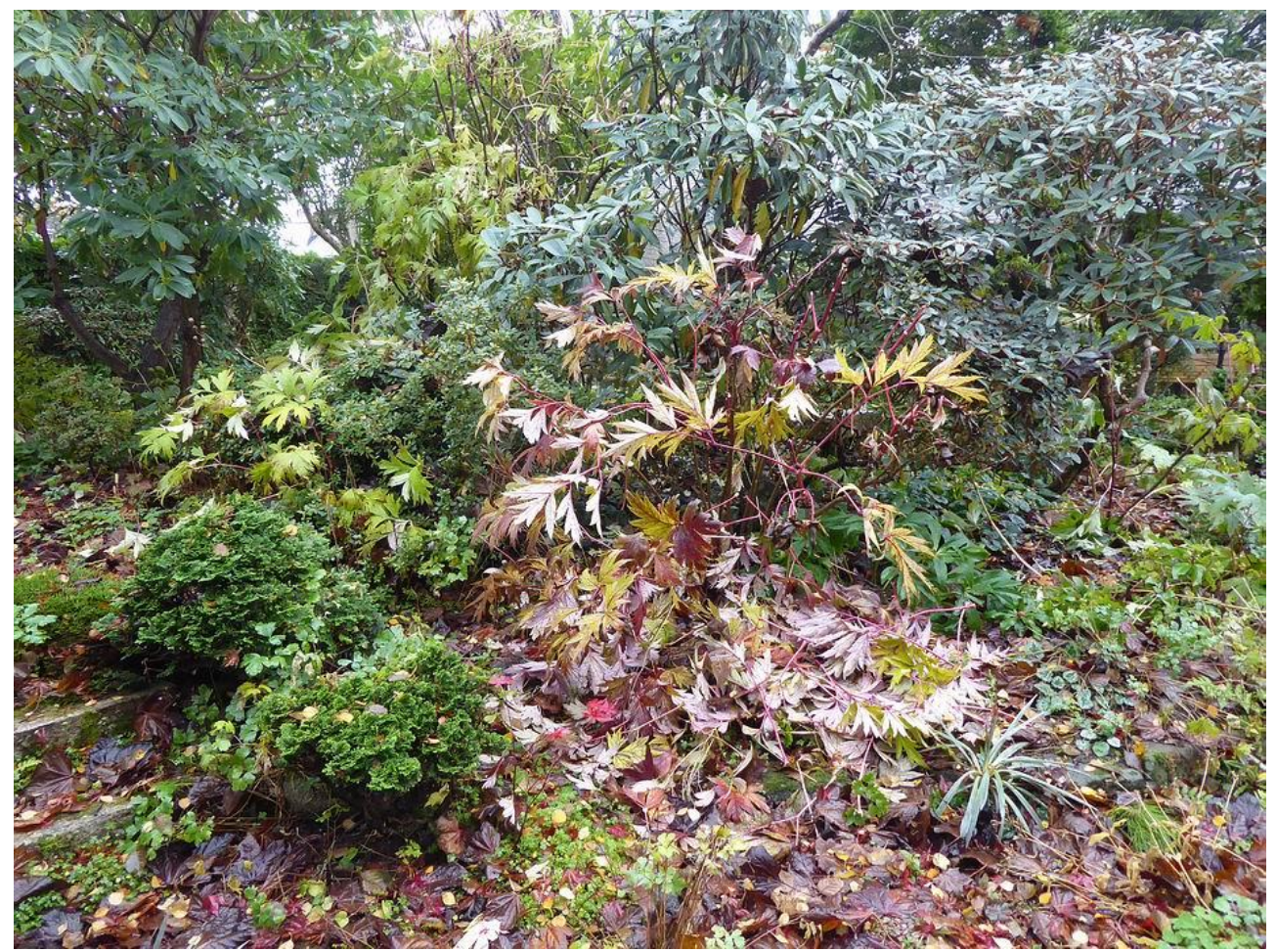
The approaching winter has caused Paeonia lutea subsp. ludlowii to suddenly let go of its leaves, which for a while before they decay, form a colourful decorative pile below the plant.