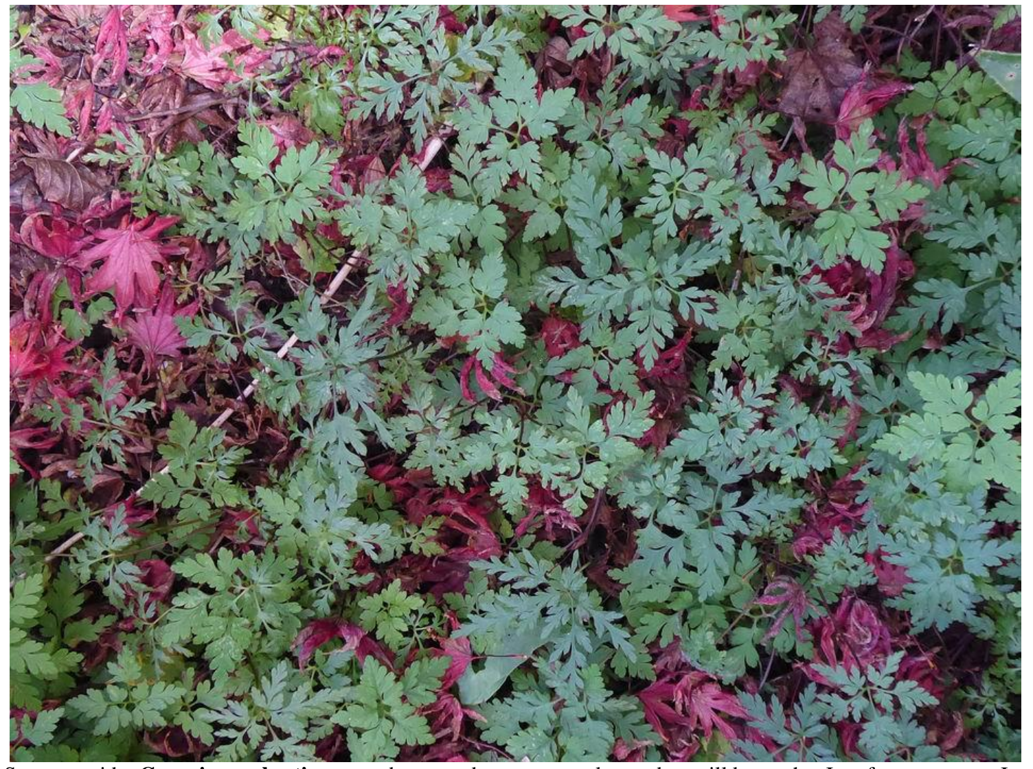
Some consider Geranium robertianum to be a weed - a term regular readers will know that I prefer not to use - I however see it as a welcome volunteer that adds interest and provides ground cover to the bulb beds while the bulbs