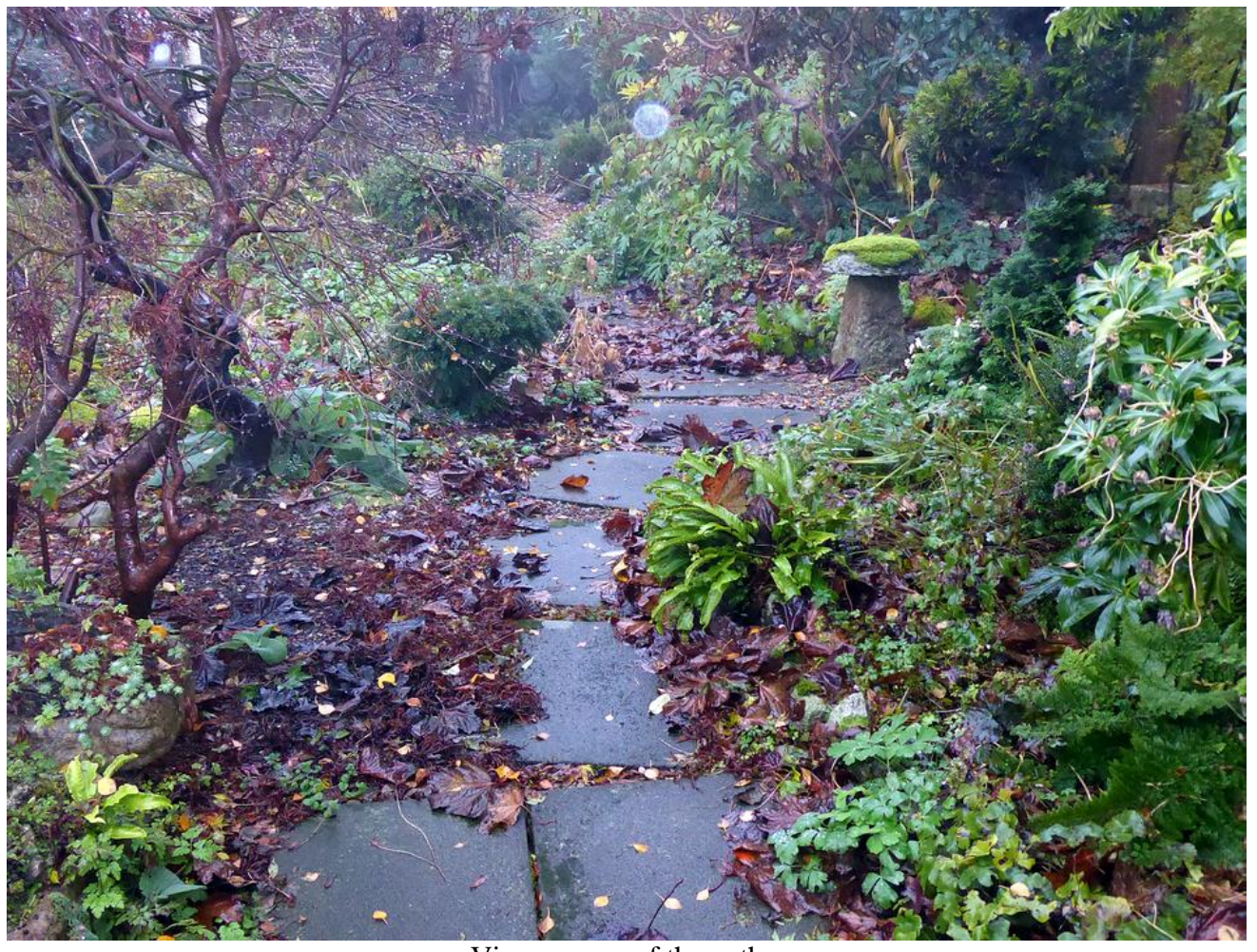
View up one of the paths.