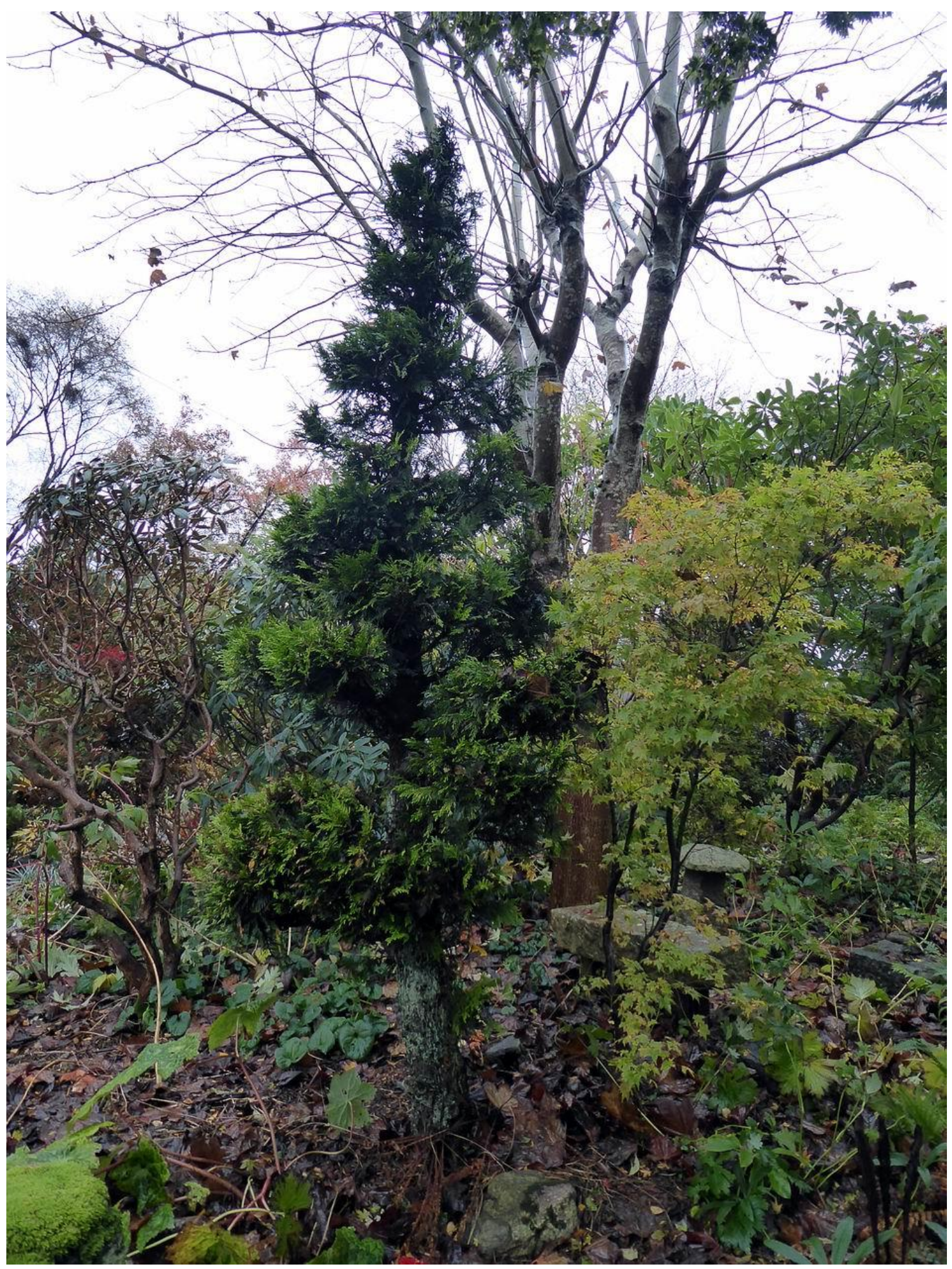
Most of the conifers are thirty to forty years old and have been subjected to some degree of clipping or shaping to give them the shape of a small tree rather than allowing them to grow into a large shrubby mass. Regular pruning also keeps them in scale allowing enough light through to the ground level plantings.