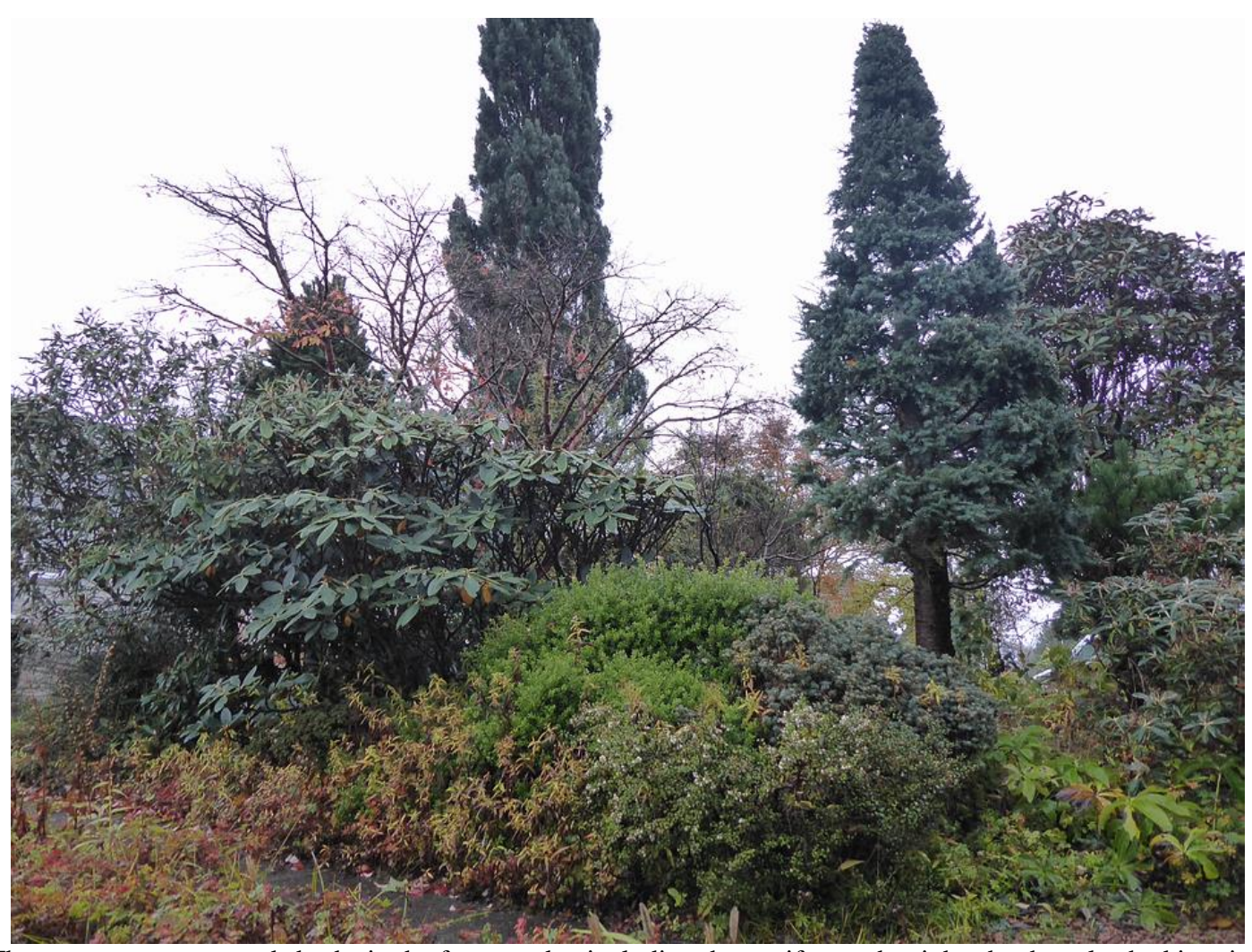
There are many trees and shrubs in the front garden including the conifer, to the right, that has also had its trim.