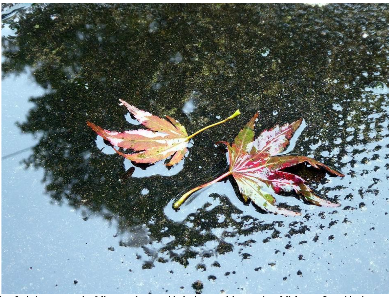
Here I tried to capture the fallen acer leaves with the image of the tree they fell from reflected in the water.