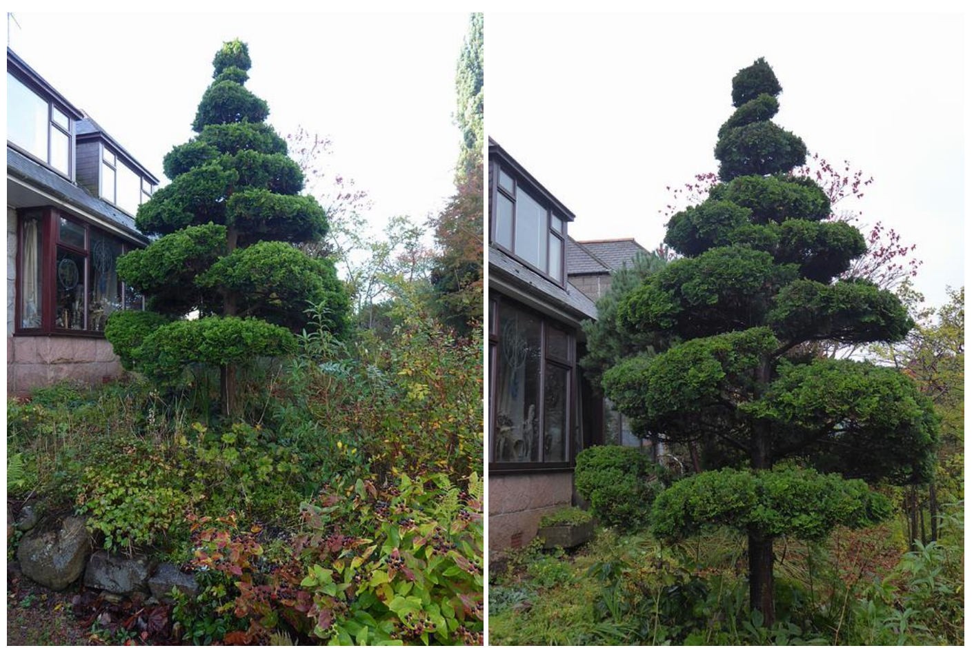
On the last dry day before the rain I gave the 'cloud pruned' tree in the front garden it annual clipping to retain its shape these are the before and after pictures.