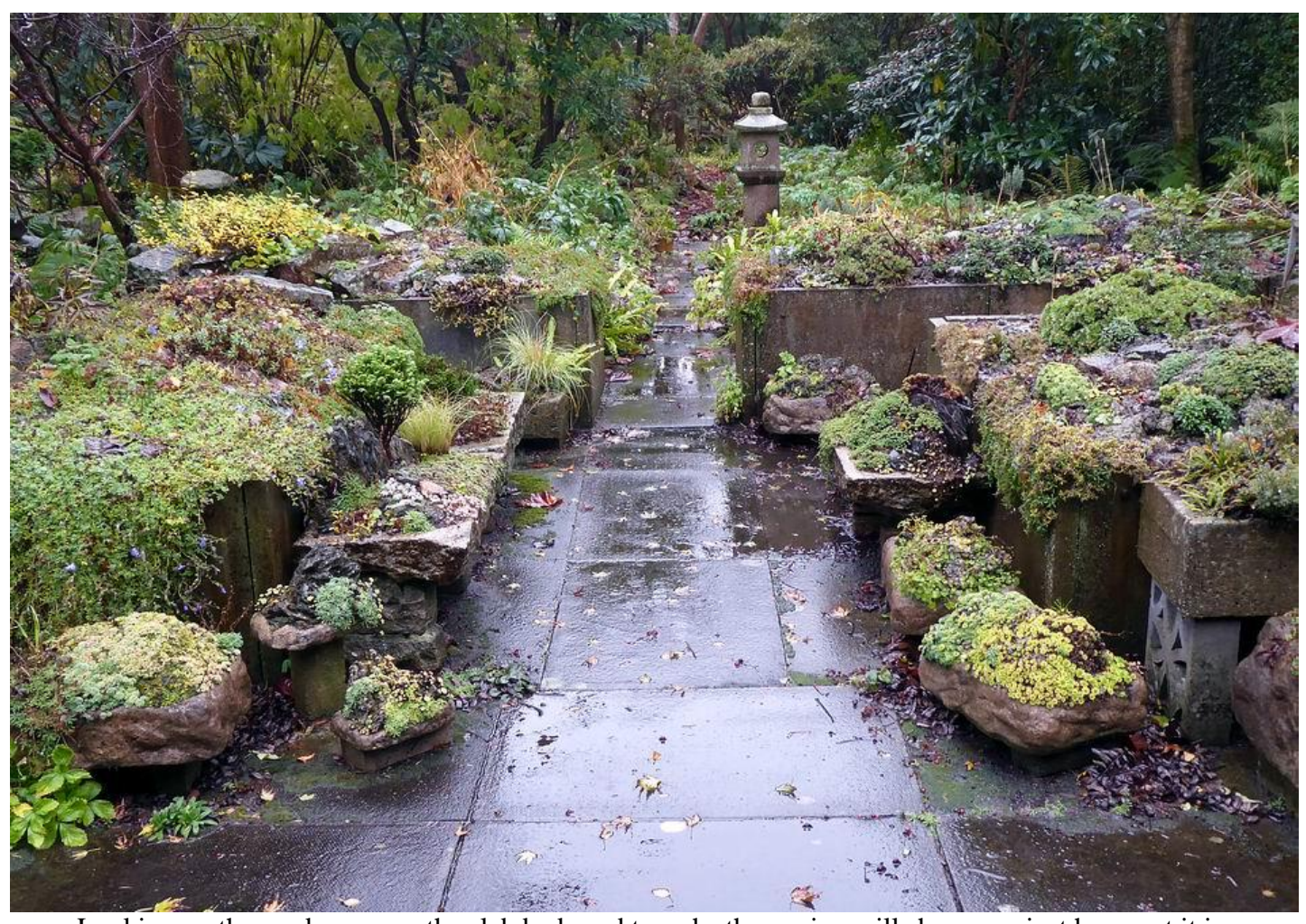
Looking up the garden across the slab beds and troughs the paving will show you just how wet it is.