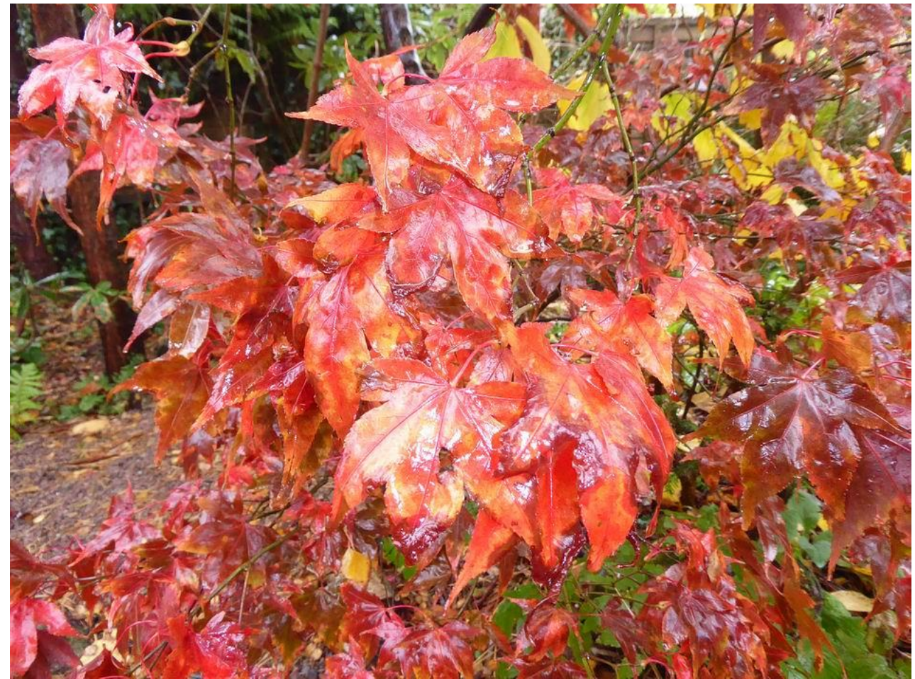
These two images show the effect that the small built in flash can have on a subject. Above, I was close on the normal focal length and the flash was a bit too strong burning out the highlights; below, I backed off around a metre zooming in to frame the subject with the effect of reducing the impact of the flash.