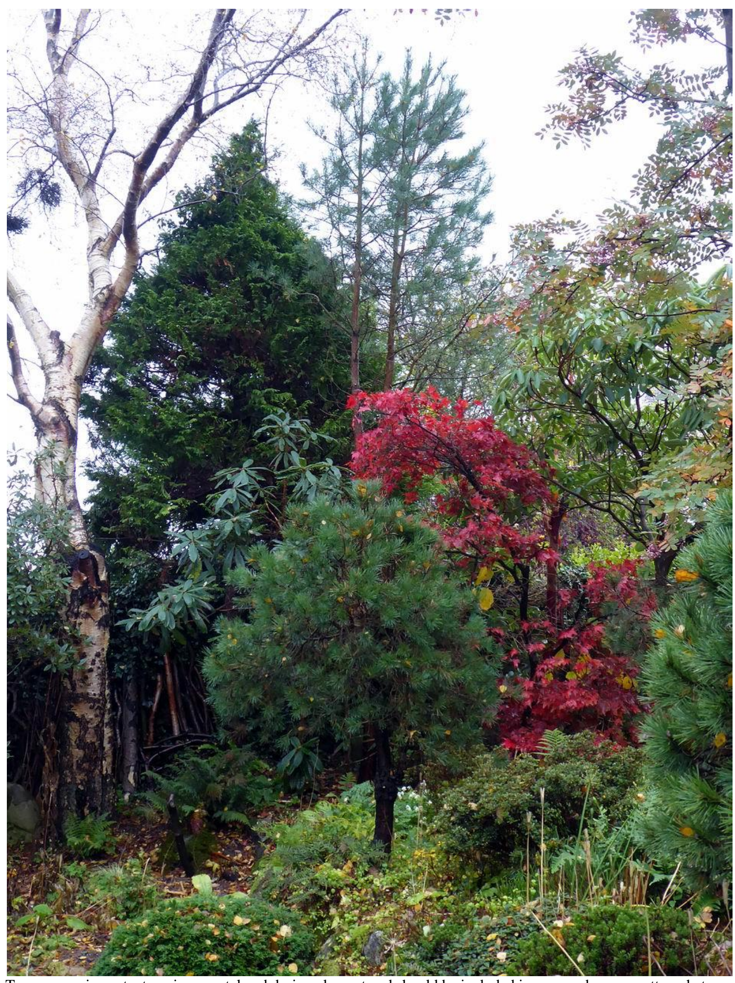
Trees are an important environmental and design element and should be included in any garden, no matter what size.

Click the link to walk with me in the latest <u>Bulb Log Video Diary Supplement</u>