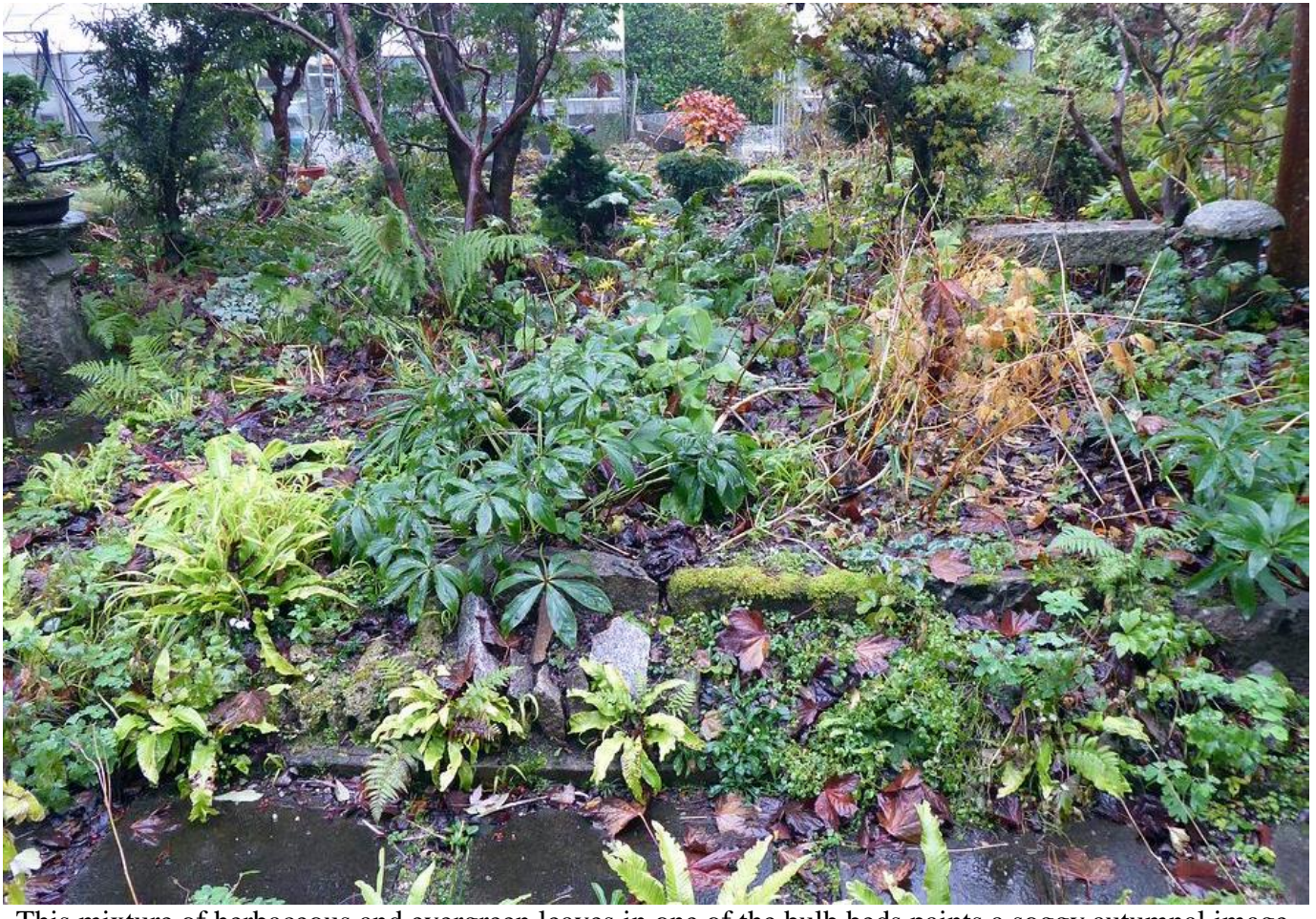
This mixture of herbaceous and evergreen leaves in one of the bulb beds paints a soggy autumnal image.