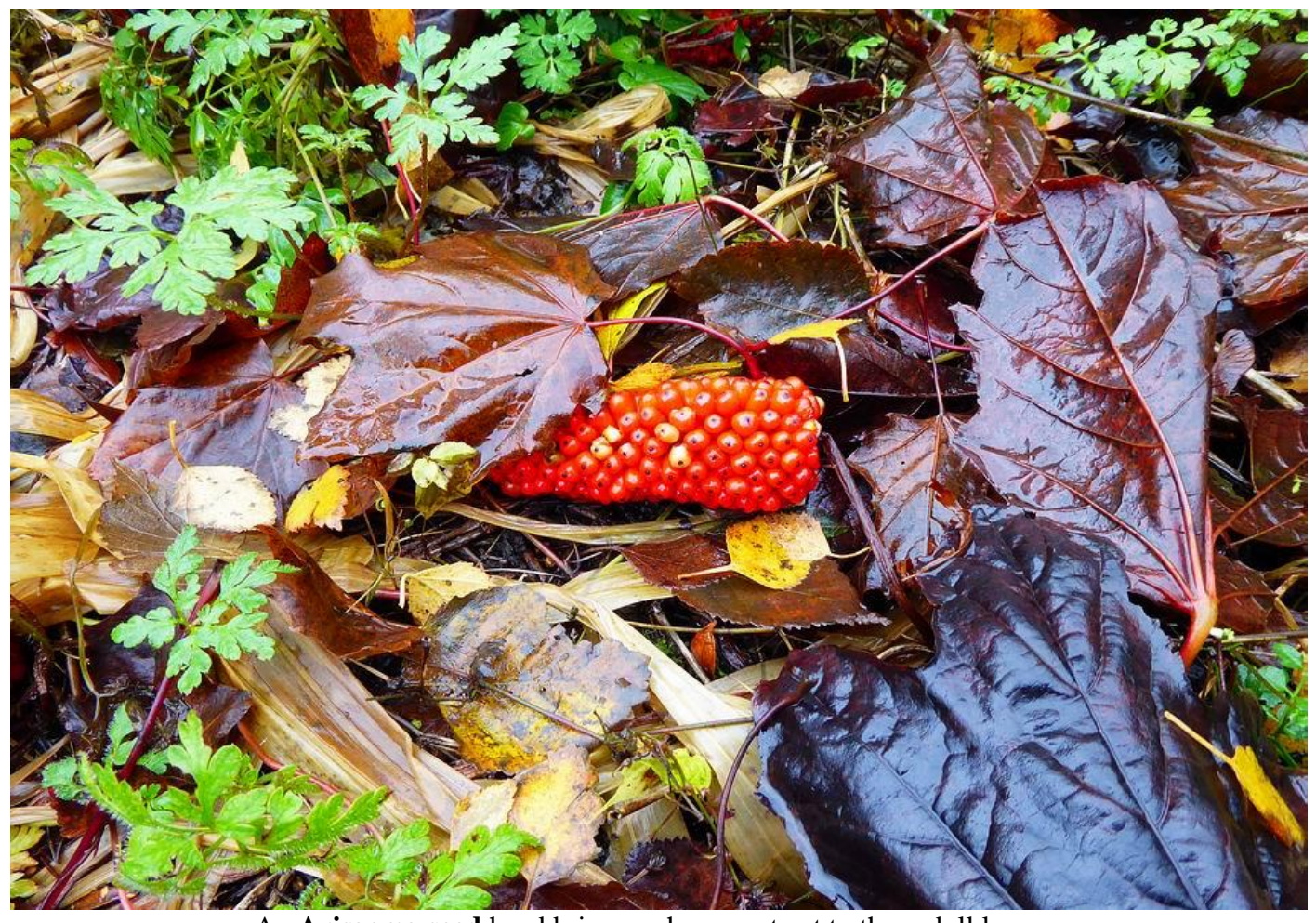
An Arisaema seed head brings a sharp contrast to these dull leaves.