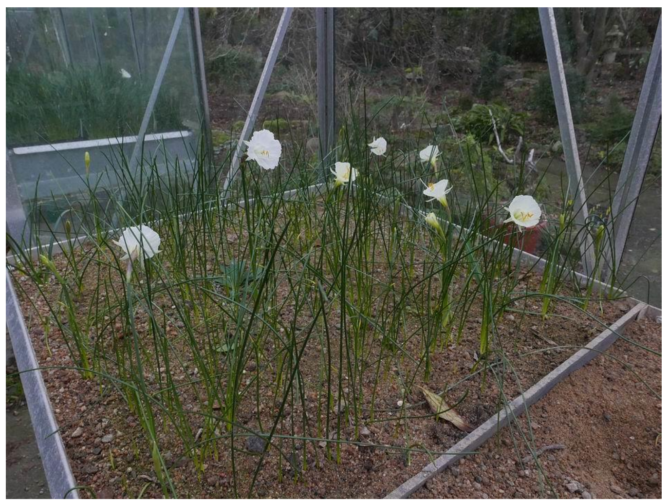
I converted this 60x60cm section of one of the benches into another sand bed to accommodate some of the surplus bulbs I had when I thinned out one of the original sand bed plantings.