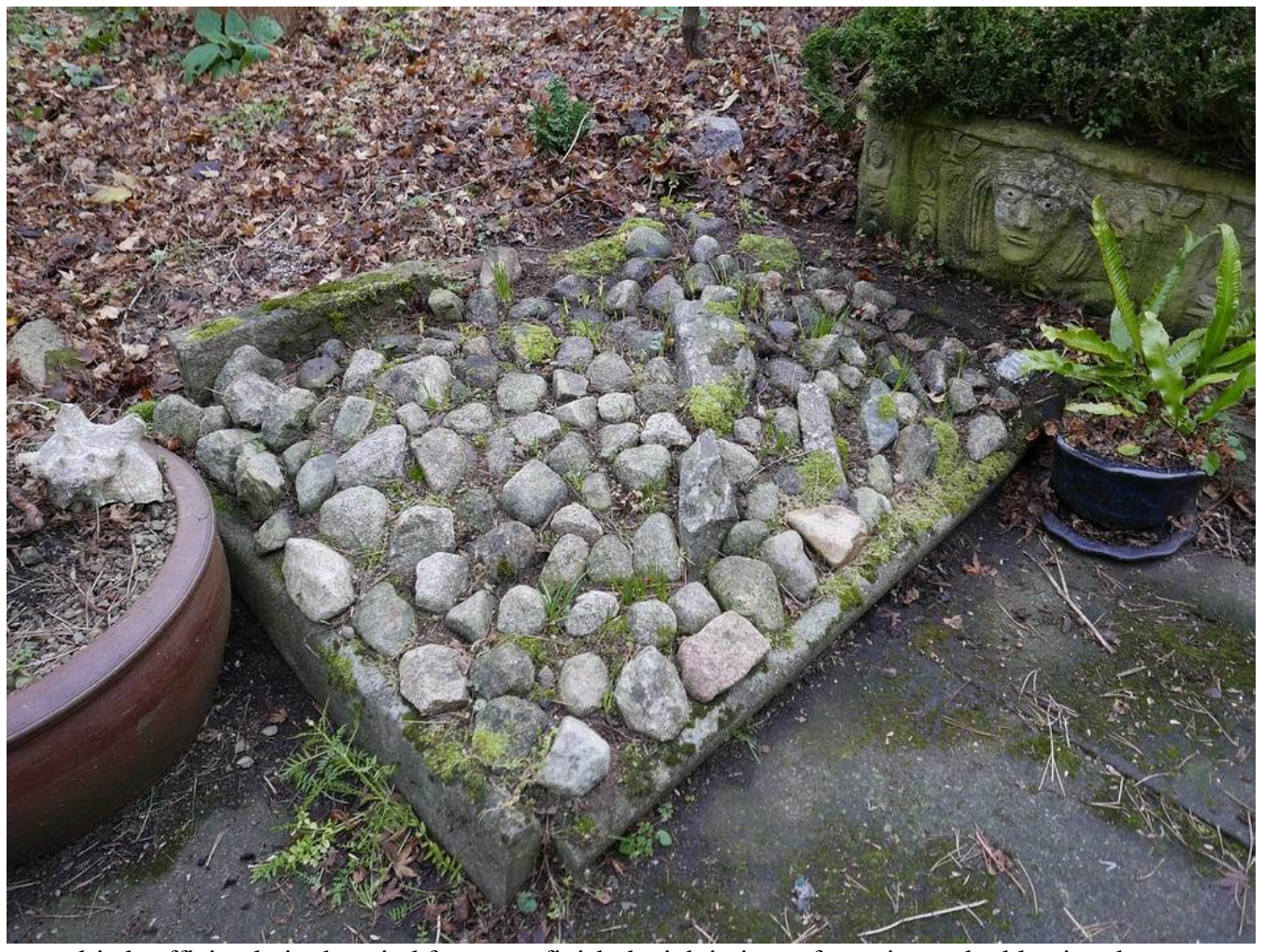
The leaves dried sufficiently in the wind for me to finish the job in just a few minutes by blowing them away with the leaf blower.