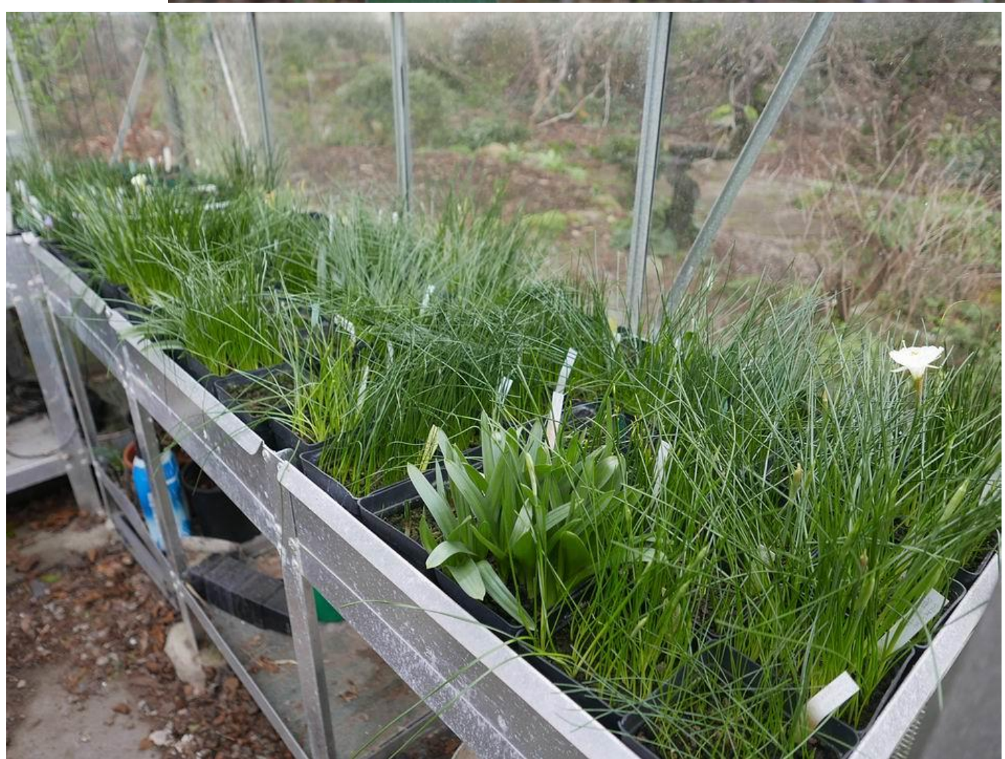
Interestingly all the first Narcissus flowers to open are those growing in the sand plunges even though we have the exact same clones growing in pots, shown above, where the very first flowers are just opening. The first Narcissus 'Craigton Chorister' flower can be seen on the right where there are two pots.