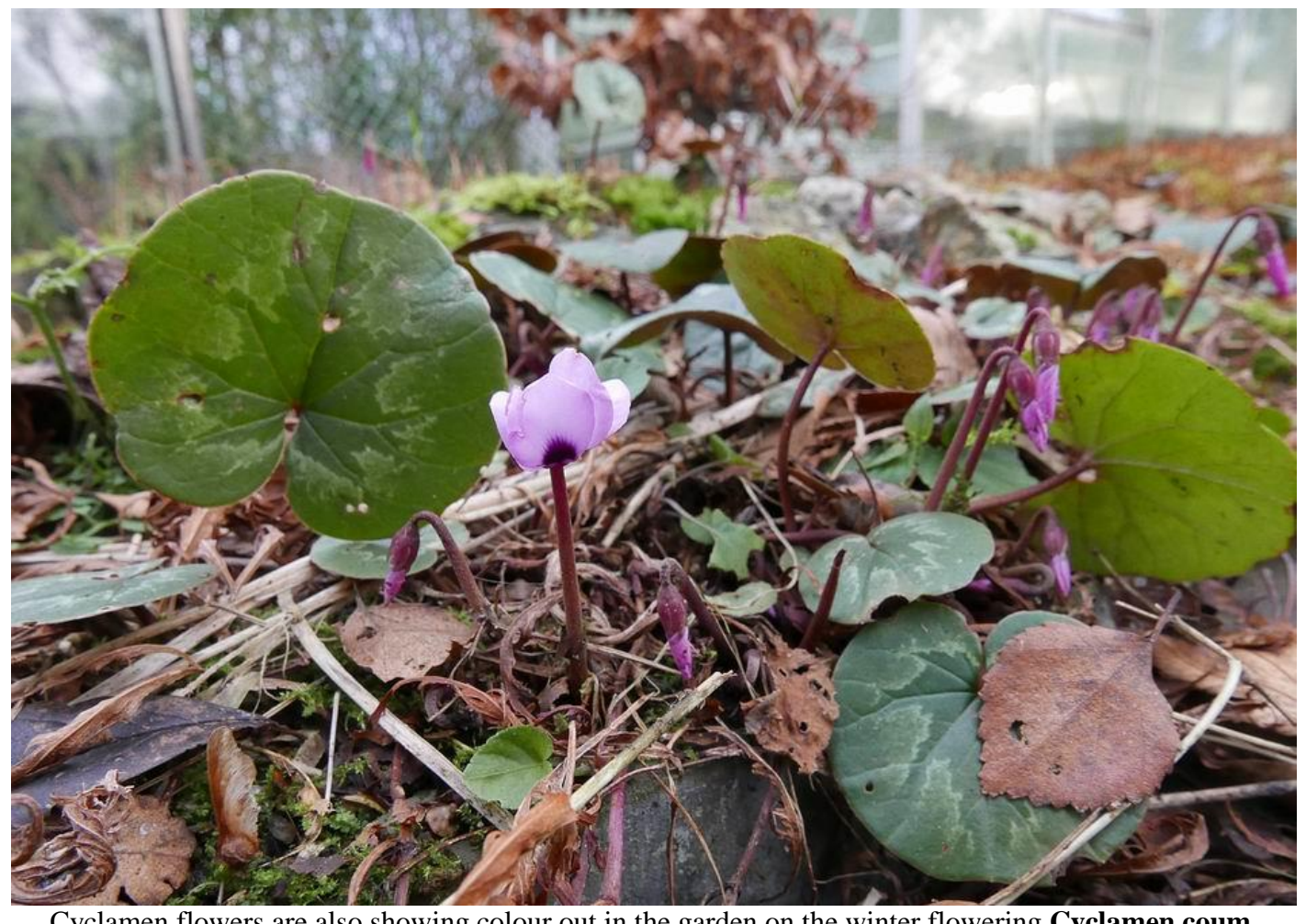
Cyclamen flowers are also showing colour out in the garden on the winter flowering Cyclamen coum.