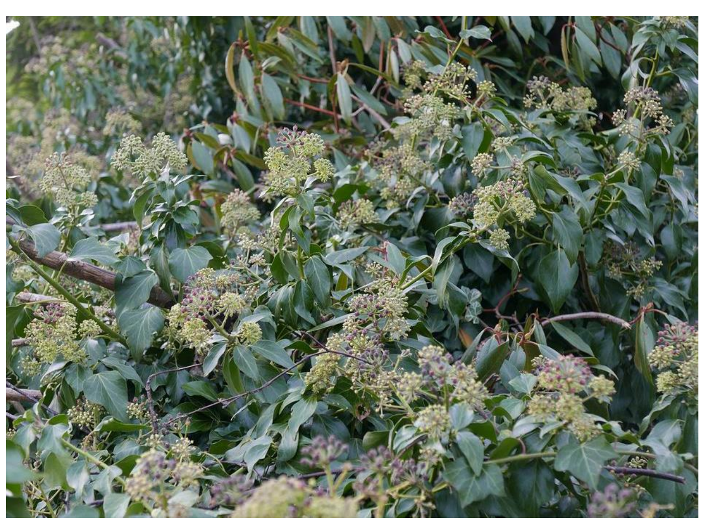
Hedera helix – not to forget the common plants that support so much of our wild life such as the winter flowering Ivy whose flowers and resulting berries provide food with the tangled growth of stems and evergreen foliage scrambling up the southern boundary wall form an excellent habitat for nesting birds particularly Robins and Wrens.