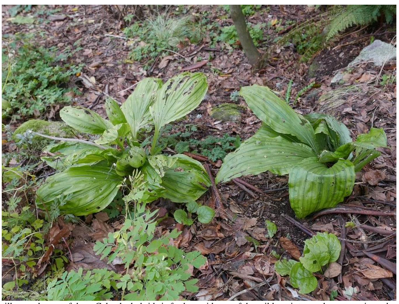
The still green leaves of these Calanthe hybrids is further evidence of the milder winter we have experienced so far.