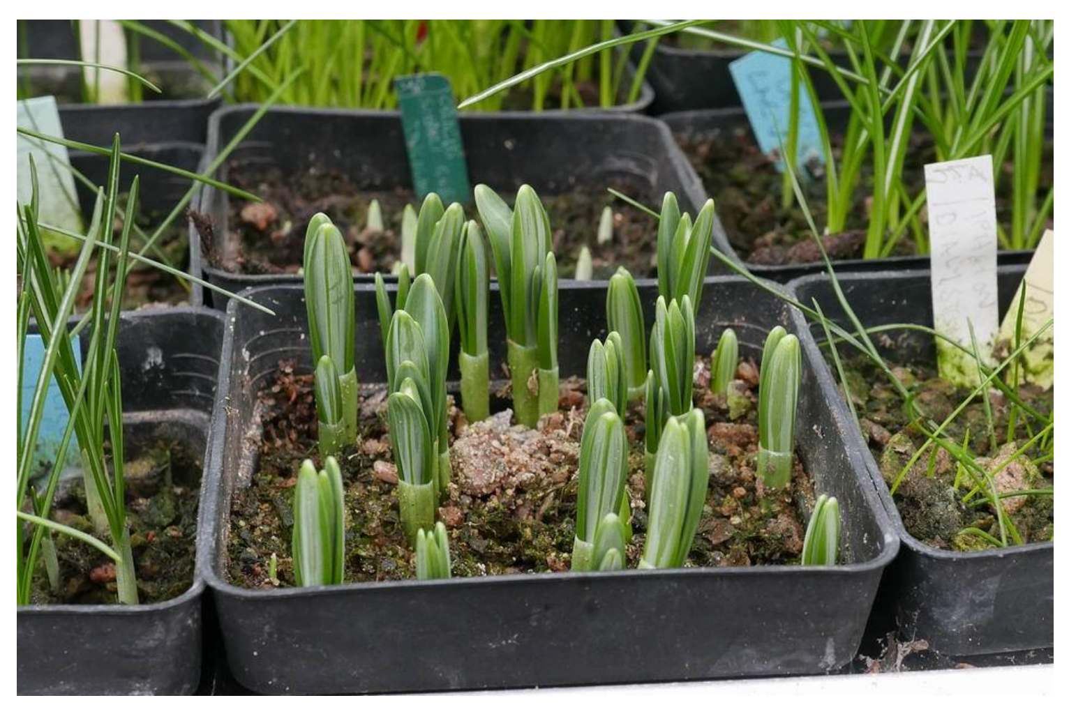
The flower buds in this pot of Galanthus 'E. A. Bowles' can be seen pushing their way up between the leaves.