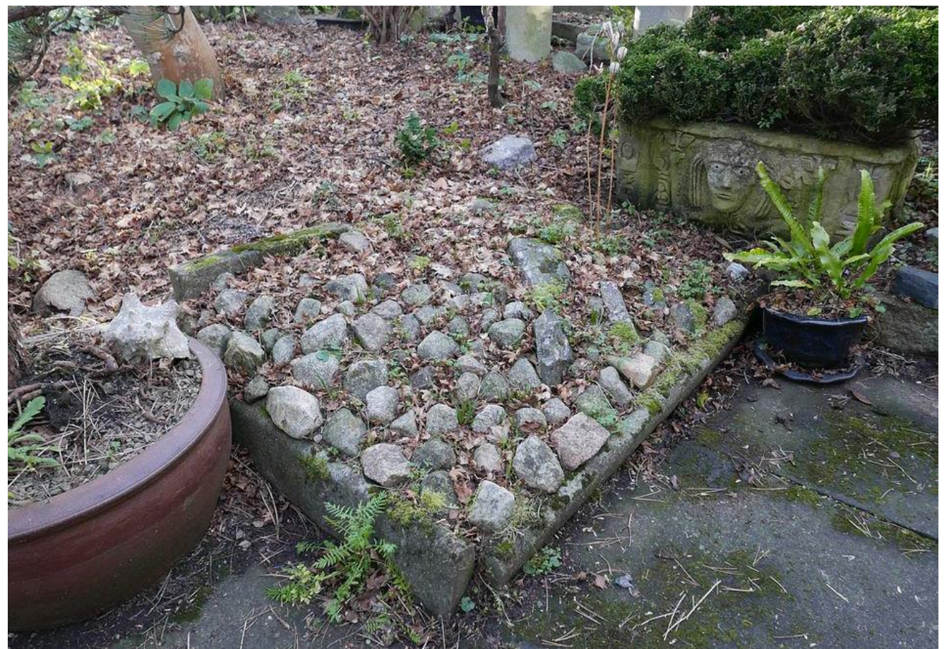
Eventually the mild weather front also brought a day without rain plus bit of wind to dry out some of the fallen leaves such as these which have been blanketing the cobble bed under their soggy or frozen mass making it very fiddly to remove them.