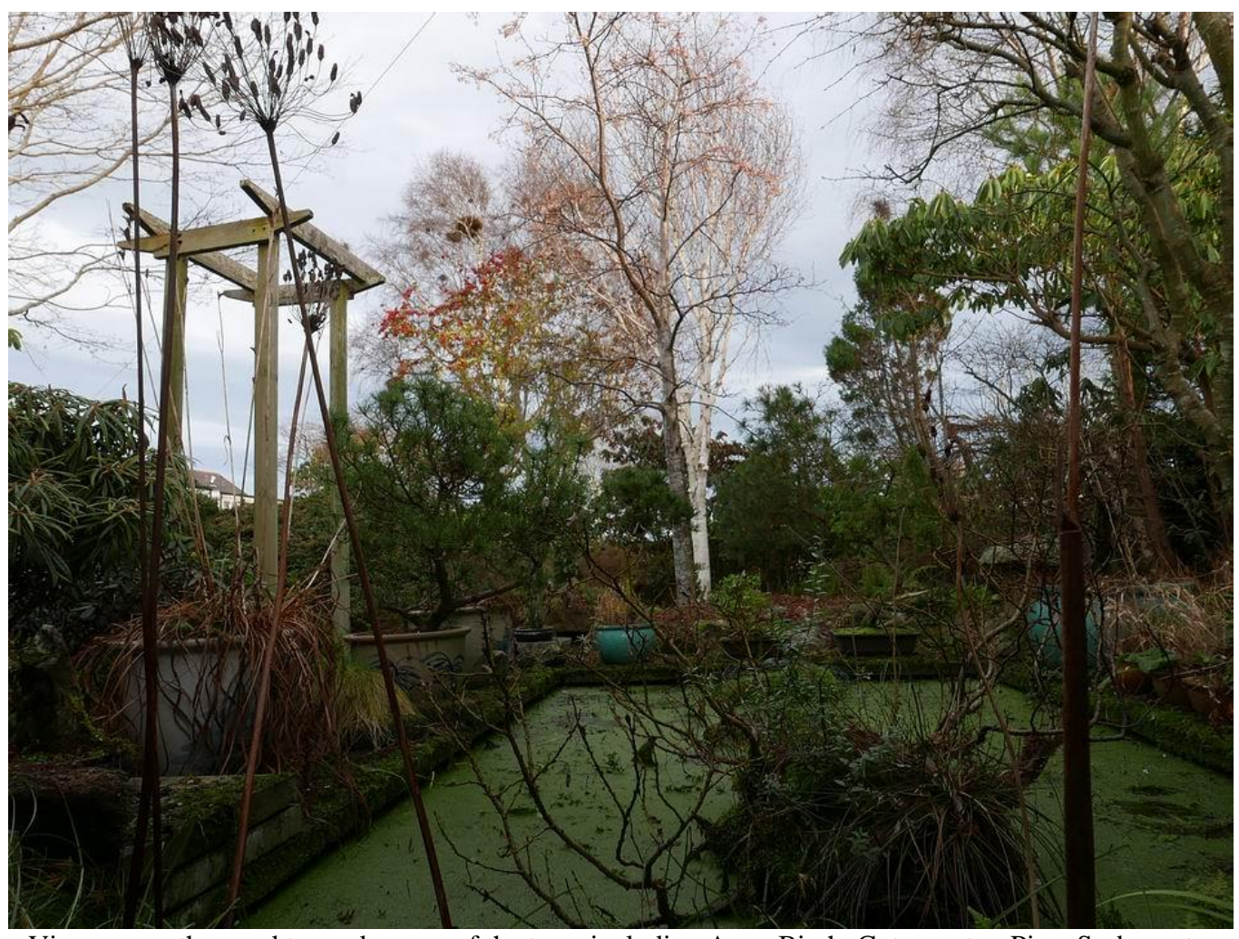
View across the pond towards some of the trees including Acer, Birch, Cotoneaster, Pine, Sorbus, etc.