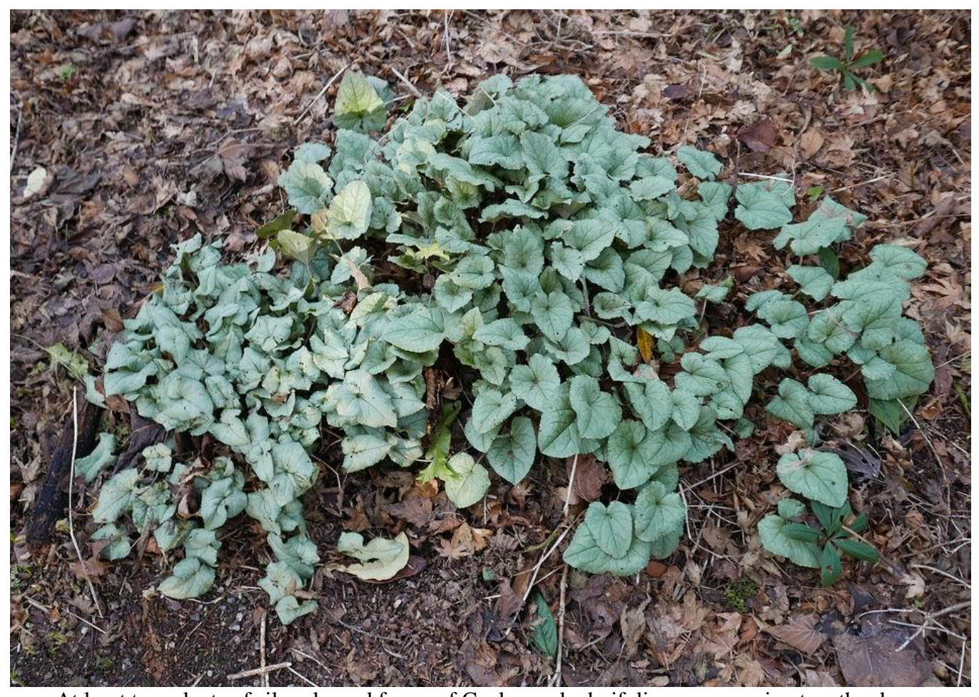
At least two plants of silver leaved forms of Cyclamen hederifolium are growing together here.