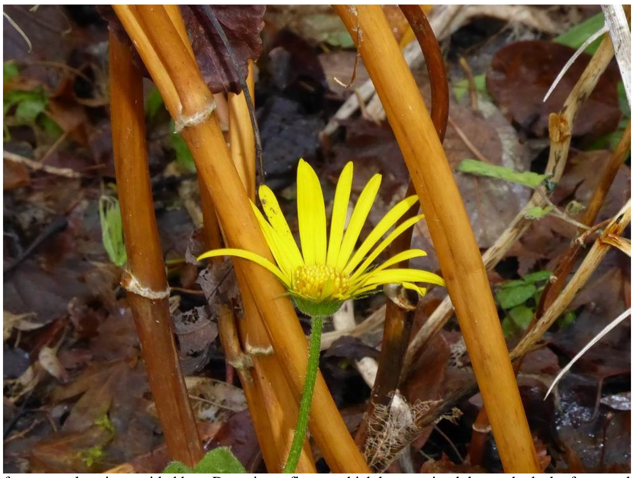
Out of season colour is provided by a Doronicum flower which has survived due to the lack of any real cold.