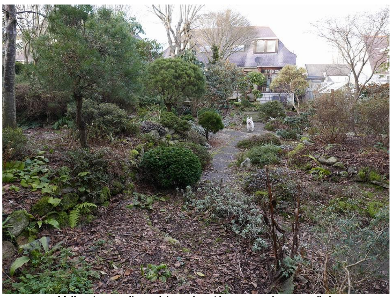
Molly enjoys a walk round the garden with me to see what we can find.