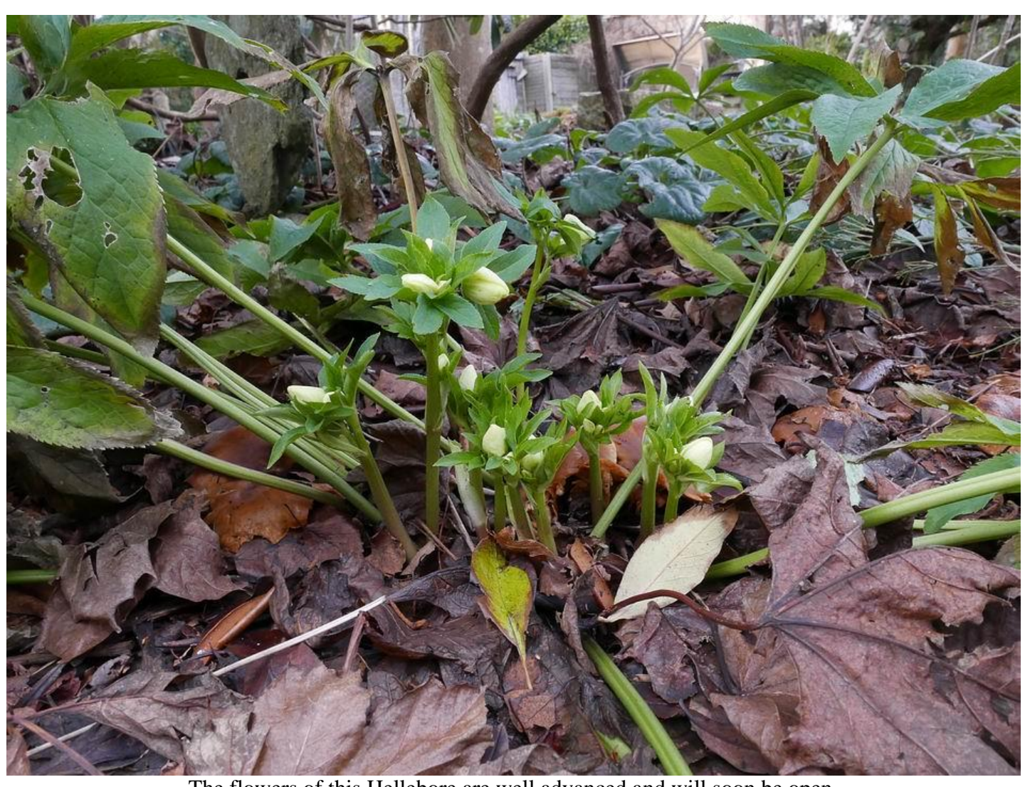
The flowers of this Hellebore are well advanced and will soon be open.