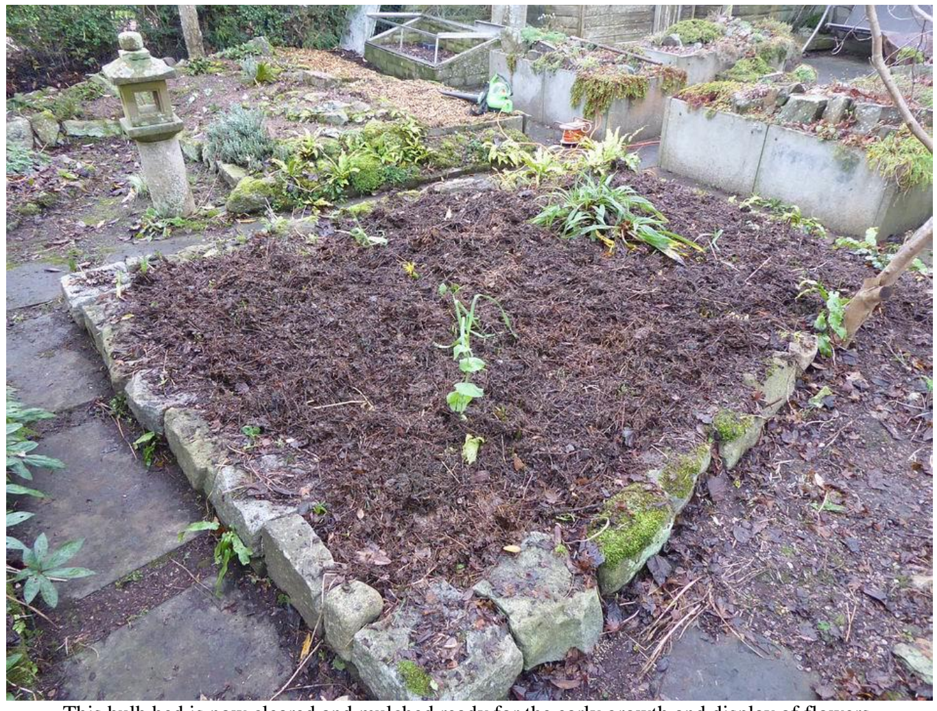
This bulb bed is now cleared and mulched ready for the early growth and display of flowers.