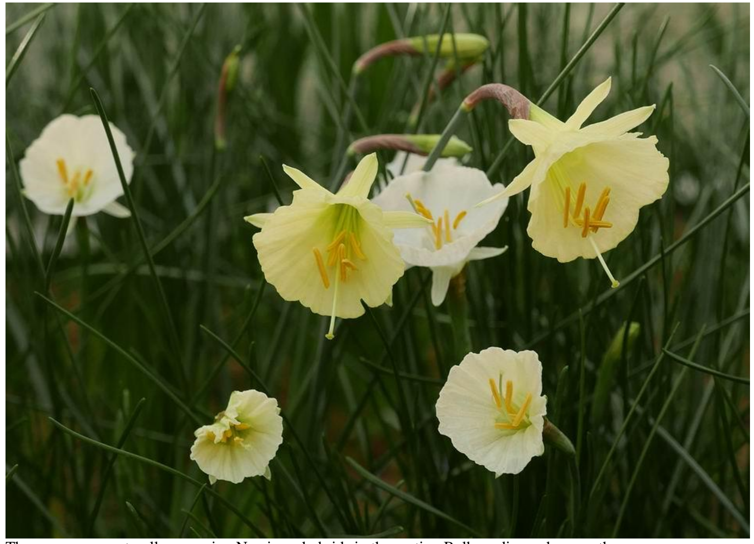
There are many naturally occurring Narcissus hybrids in the section Bulbocodium wherever they grow geographically close enough to be cross pollinated and this promiscuity is certainly the case when so many are growing in a small bulb house when each batch of seedlings brings new treasures.