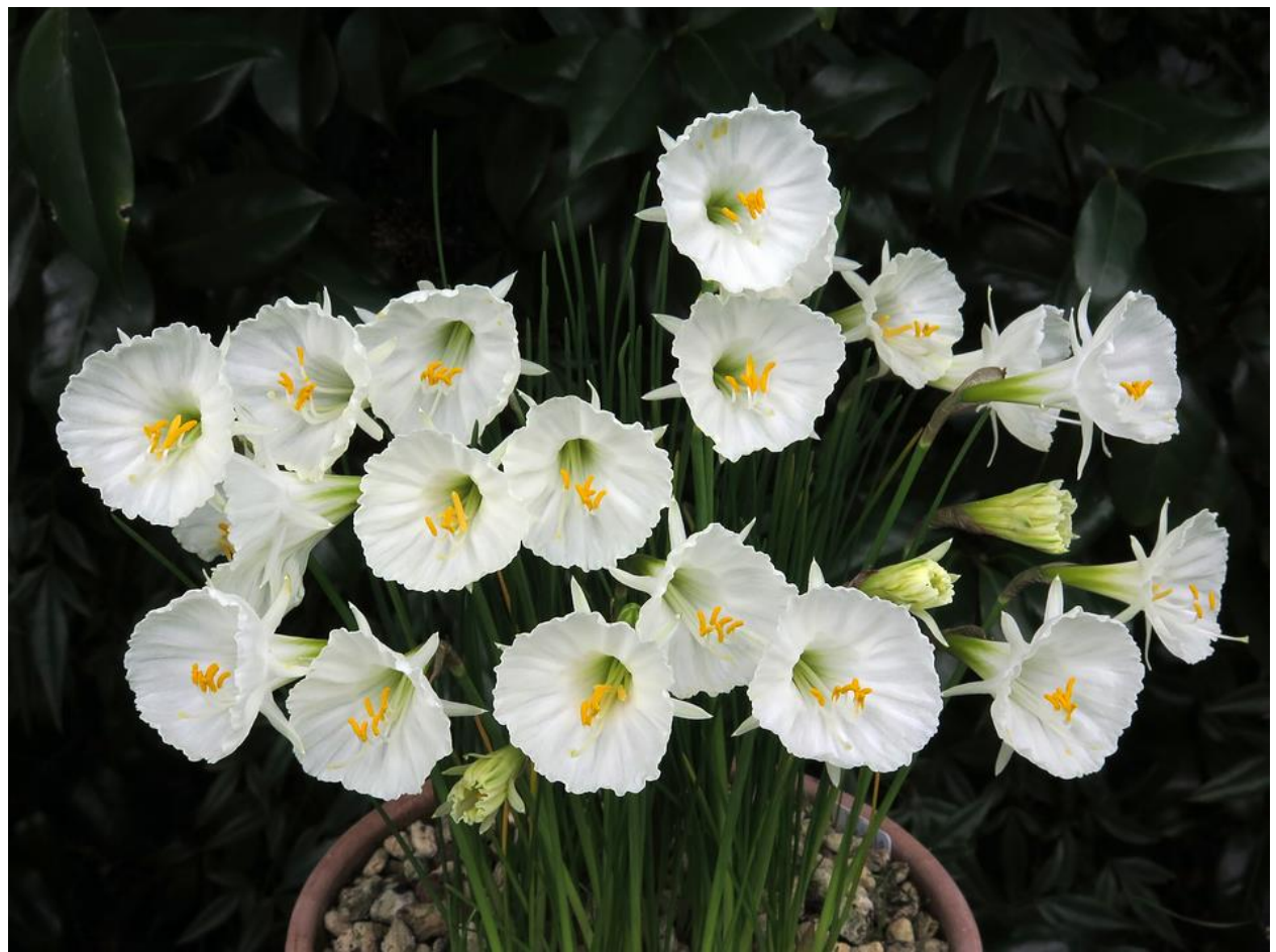
Narcissus 'Craigton Chorister'

The perfect reward for me is to see plants that I have raised growing so well in other gardens; often better than they will grow in our climate. This pot of 'Craigton Chorister' is grown to perfection by Tatsuo Yamanaka in Japan. I chose the name because the beautifully pleated pure white corona reminded me of the frilly starched collars worn by choristers.