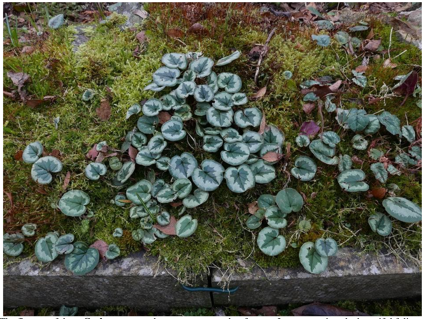
The flowers of these Cyclamen coum have yet to appear but for now I can appreciate the beautiful foliage.

the sides of pots, under troughs, between stones and such places where they gather to wait out the colder weather.