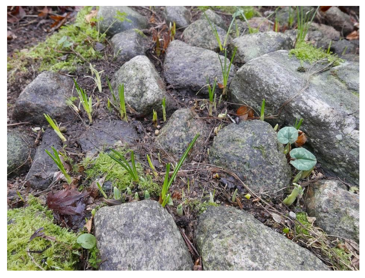
This allows me to see all the shoots emerging from the bulbs. Regular readers will remember this is a sand bed full of bulbs including many Crocus, however the mice found it too easy to dig in the sand and ate most of the crocus so, in attempt to deter the predation, I decided to cover the sand with small stones. The bulbs find it easy to come up through the gaps, even if they are planted directly under the stones