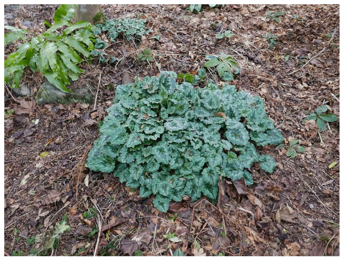
Cyclamen hederifolium flowered through late summer and into autumn and now their leaves stand out against the natural mulch of brown leaf fall. This is one old very large plant with a spread of over 80cms, some of the leaves are 8cms wide.