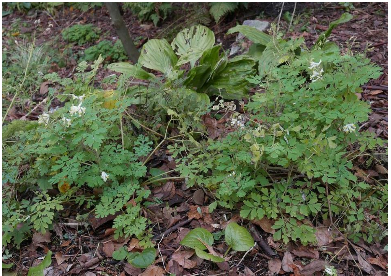
Pseudofumaria alba is one of those plants that seeds around the garden and can flower at any time of the year even in the milder days of winter.