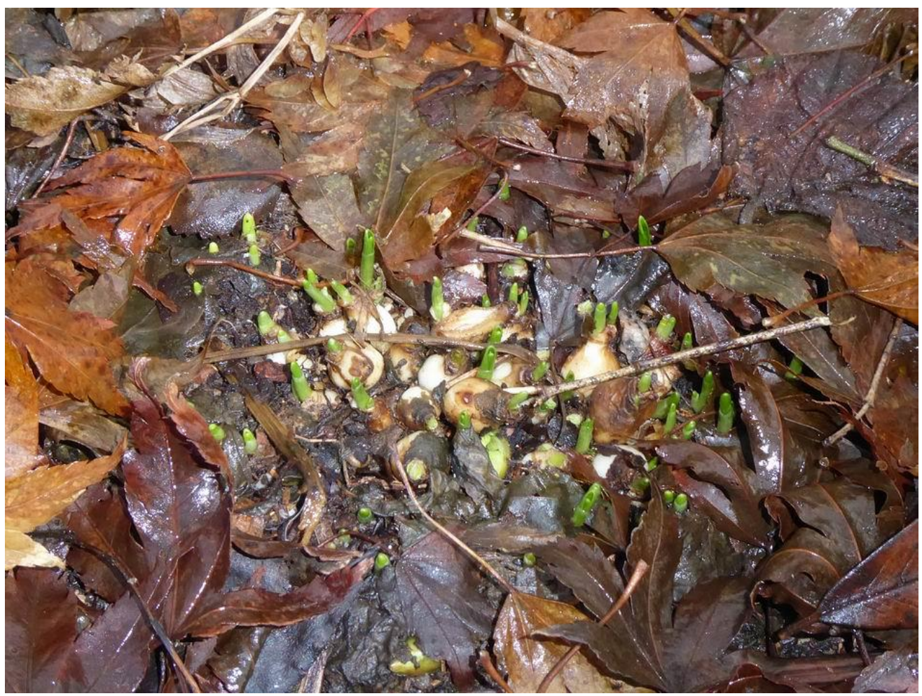
While clearing leaves in another part of the garden I found a group of Galanthus bulbs breaking the surface. This is the result of the bulbs clumping up to such an extent that they start to grow one on top of the other eventually pushing the topmost ones out of the ground – a sure sign that in this case lifting and splitting is overdue.