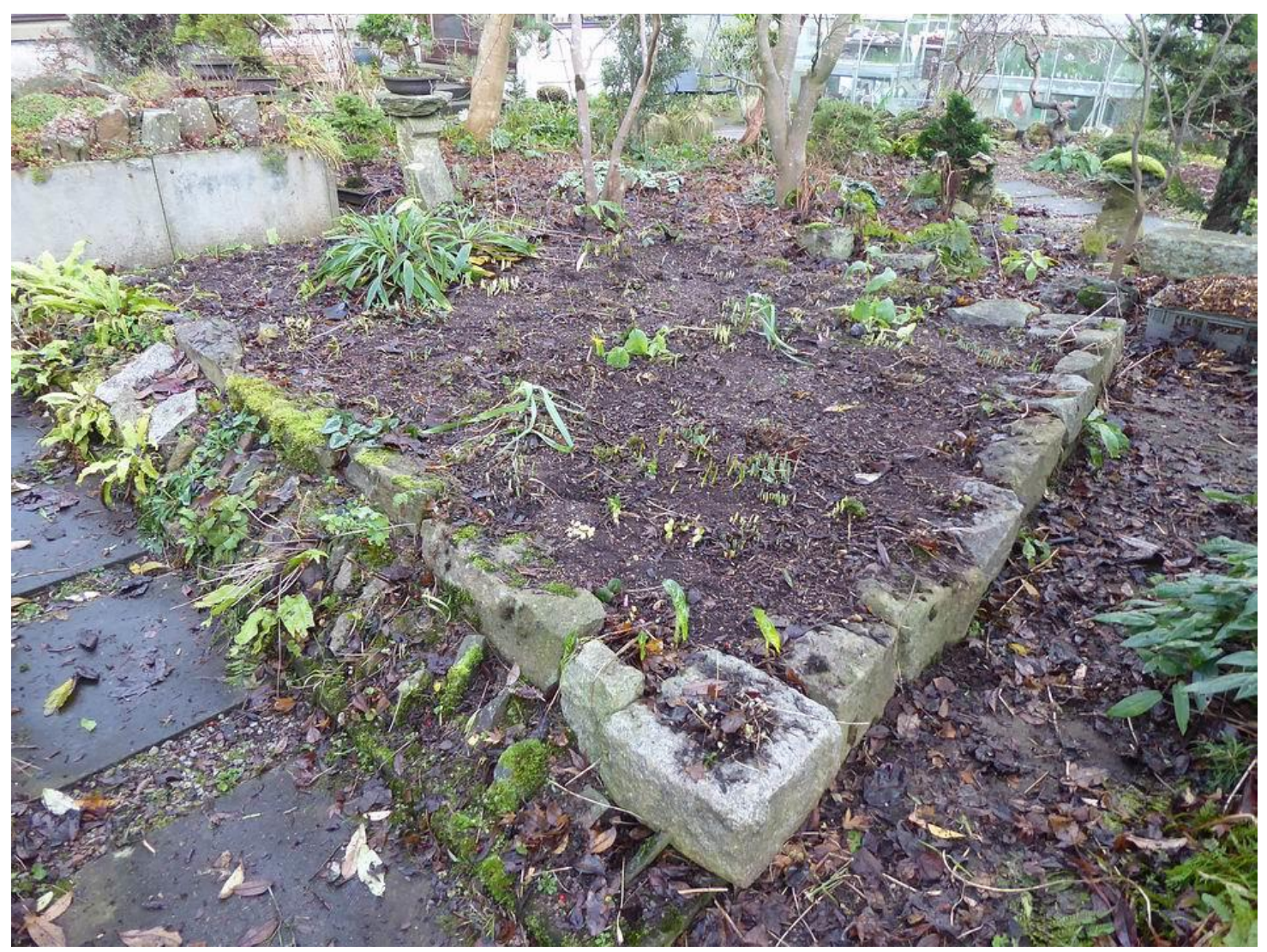
I also got the fallen leaves cleared from the bulb bed and at the same time cut the old leaves off the Hellebores again revealing the mass of shoots anxious, although maybe a bit premature, to get into growth.