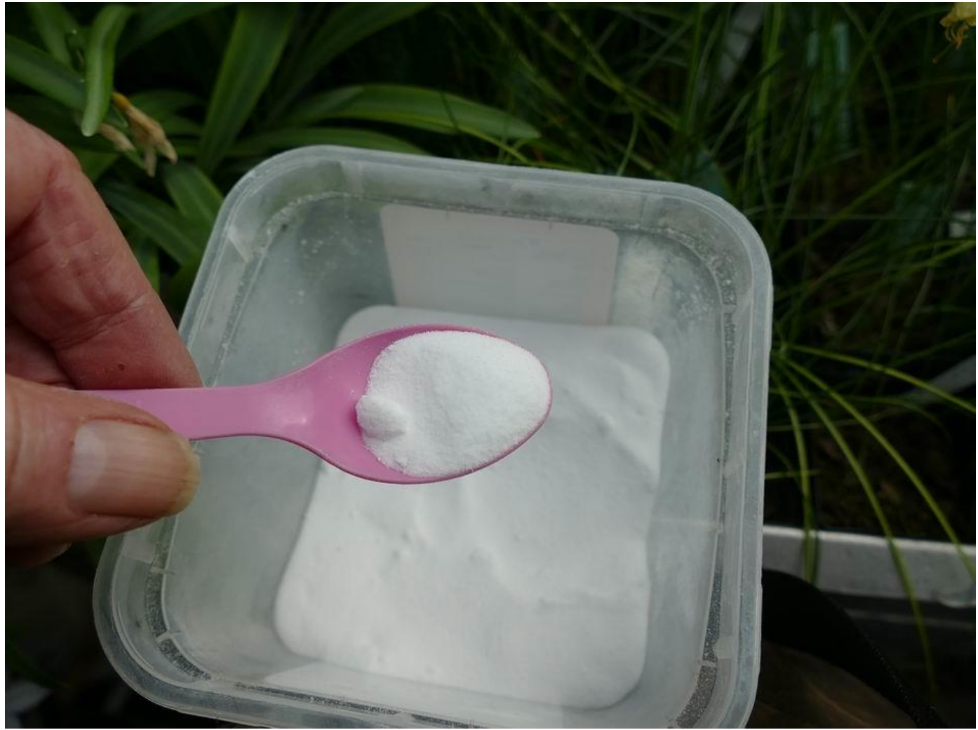
Whether they are growing in the sand or in pots I add a small sprinkle of the powdered potassium around the bulbs before watering it in – depending on how long they bulbs keep growing I may add a second dose later.