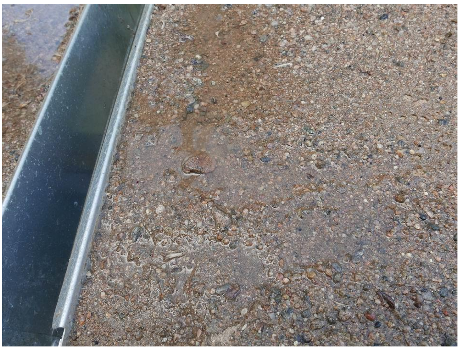
The initial pass of water is just to soak the surface and make it receptive to the water then I continue to water making floods which I leave to drain before going over it yet again.