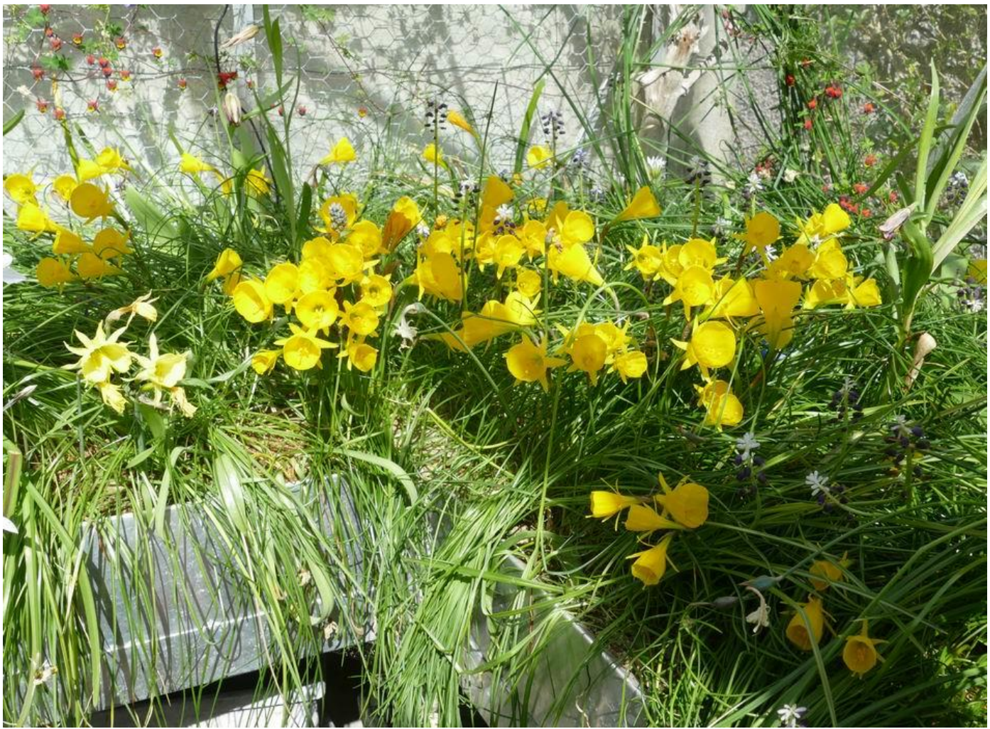
Narcissus obesus is among the last to flower.