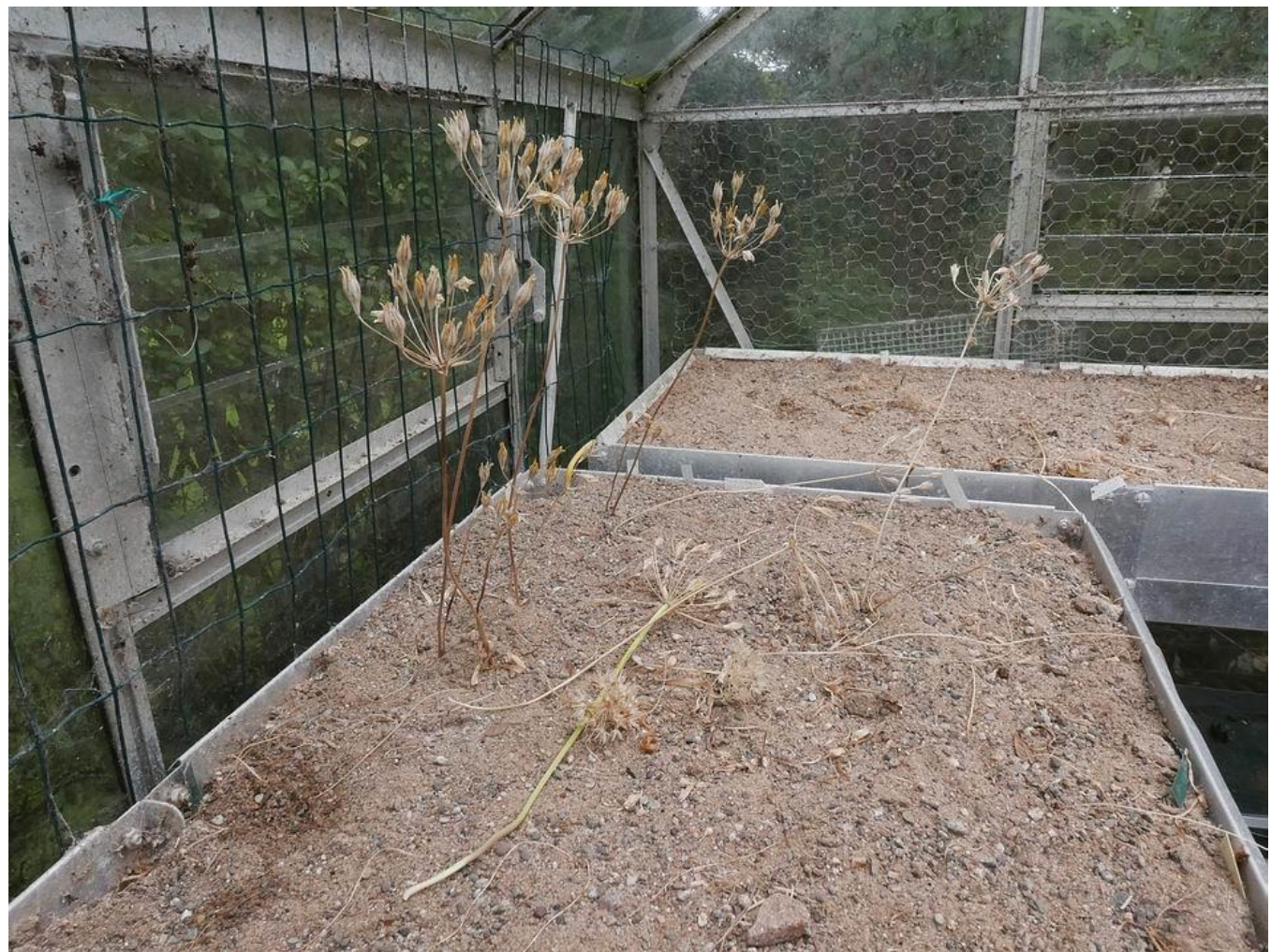
The appearance of the Autumn-flowering Crocus is a timely reminder that I need to prepare the bulb house sand beds for the first watering of the season - the storm. Before I water the sand beds I remove as much of the dried remains of the old growth as I can to prevent it attracting mould when it gets wet.