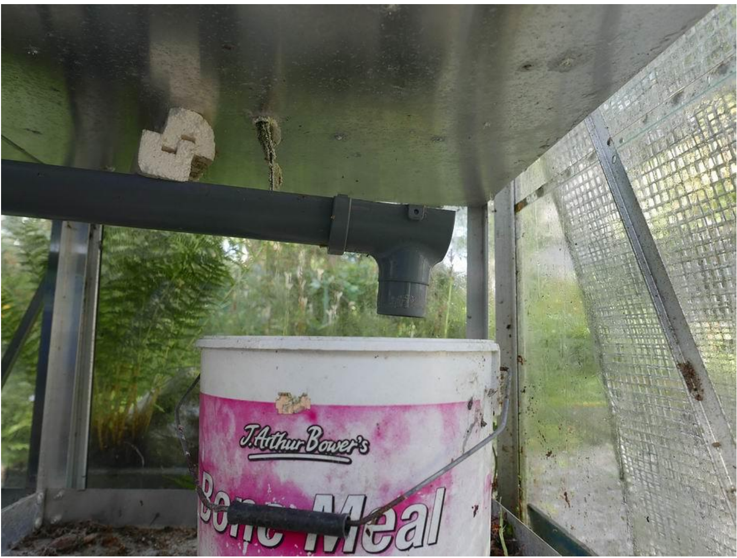
Bucket, collecting the surplus water.