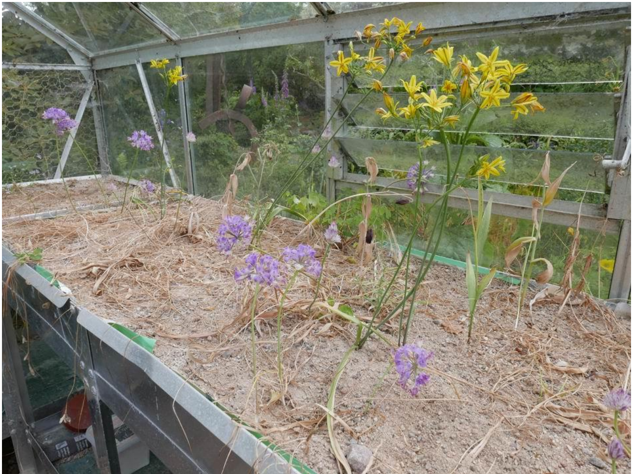
Triteleia ixioides, Allium crispum and Allium gomphrenoides

The Triteleia and Alliums stop flowering towards the end of July which brings the season to a close but at the same time I spot a Colchicum shoot pushing though the dry sand heralding the first of the new season of flowering. I continue to seek bulbs that will fit in with the Mediterranean type season that will flower in the dry summer months.