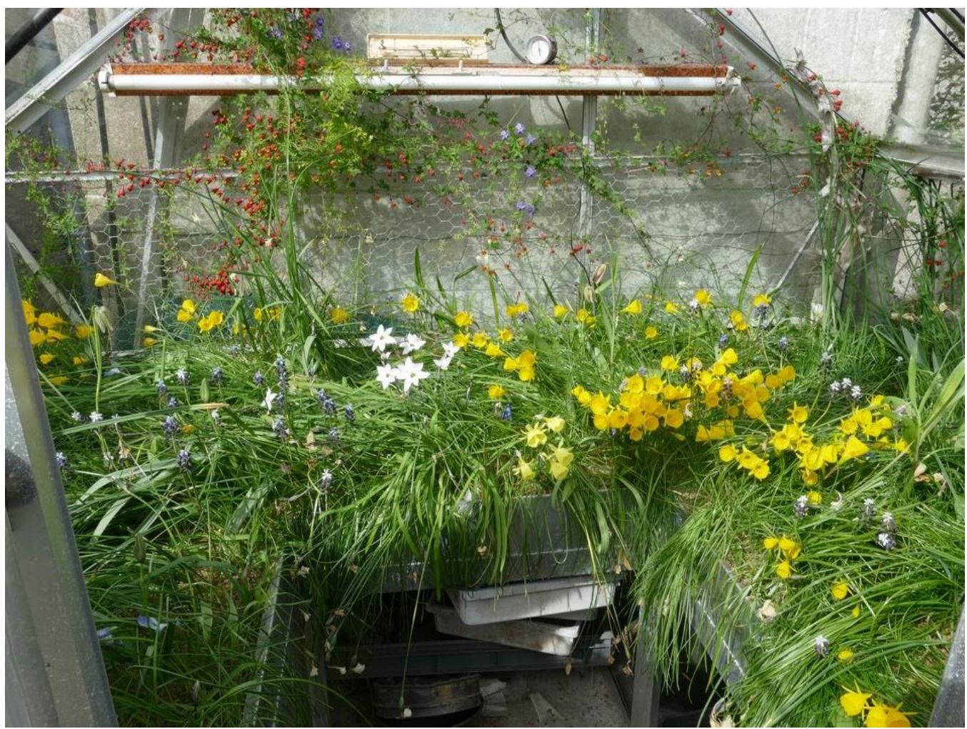
As we move through April the yellow hoop petticoat Narcissus flower in profusion.