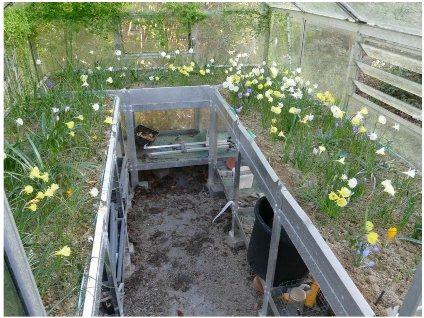
Moving on to the end of February.