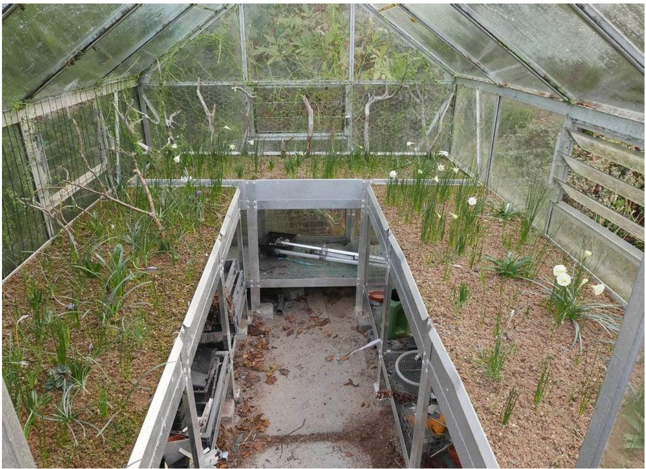
Moving over to what was the 'Fritillaria House' before we converted it entirely to mixed bulbs growing in sand beds. Our intention is to have flowers for as many weeks /months of the year as we can with the first two pictures showing the very first few flowers of the season that depending on the weather can appear as early as late September.