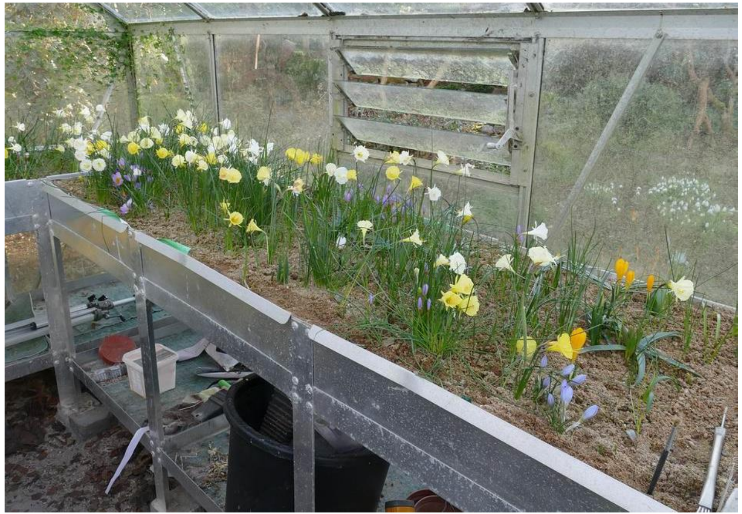
Now for a few pictures as a reminder of the bulbs flowering in the sand beds through the year – this is the stage of growth when I add the potassium.