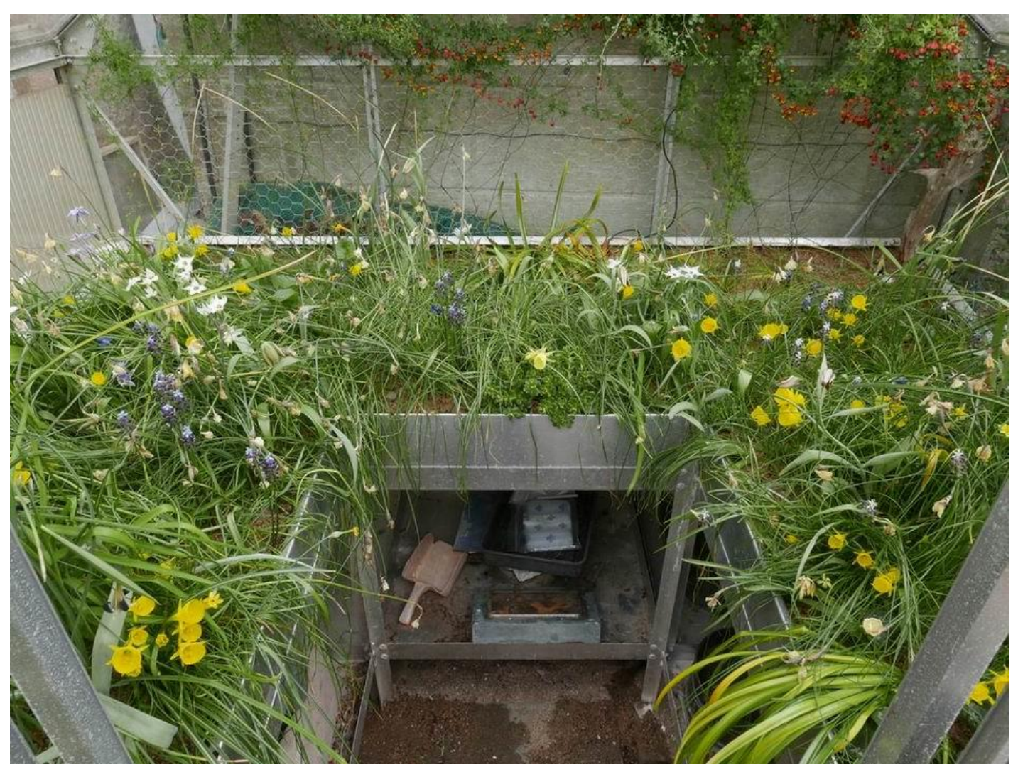
As the year progresses the flowers of those early bulbs fade and are replaced with waves of later flowering ones.

There now follows a photo-essay looking back at some of the sand beds trough the year starting with the 'U'shaped one. This picture, taken in mid-January illustrates what can be flowering at this time of year. The flowering time of these Narcissus varies considerably depending on the weather since the autumn watering.