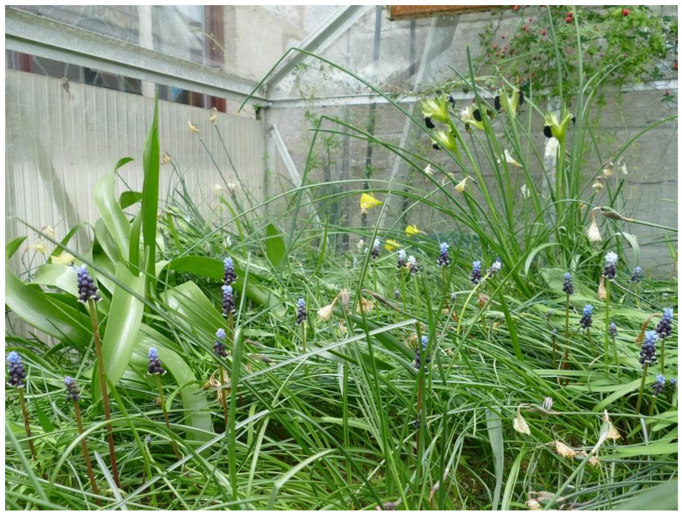
Eventually the Narcissus season starts to subside but there are plenty other bulbs flowering.