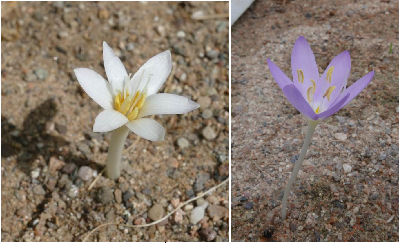
A white Colchicum species photographed on 28<sup>th</sup> July 2020 represents an early start of a new season of flowering in the sand beds - the only month we have not had a flower is when the sand is completely dry in August. On the right another Colchicum is the first into flower early in September after I have soaked the sand again.

The Triteleia and Alliums stop flowering towards the end of July which brings the season to a close but at the same time I spot a Colchicum shoot pushing though the dry sand heralding the first of the new season of flowering. I continue to seek bulbs that will fit in with the Mediterranean type season that will flower in the dry summer months.