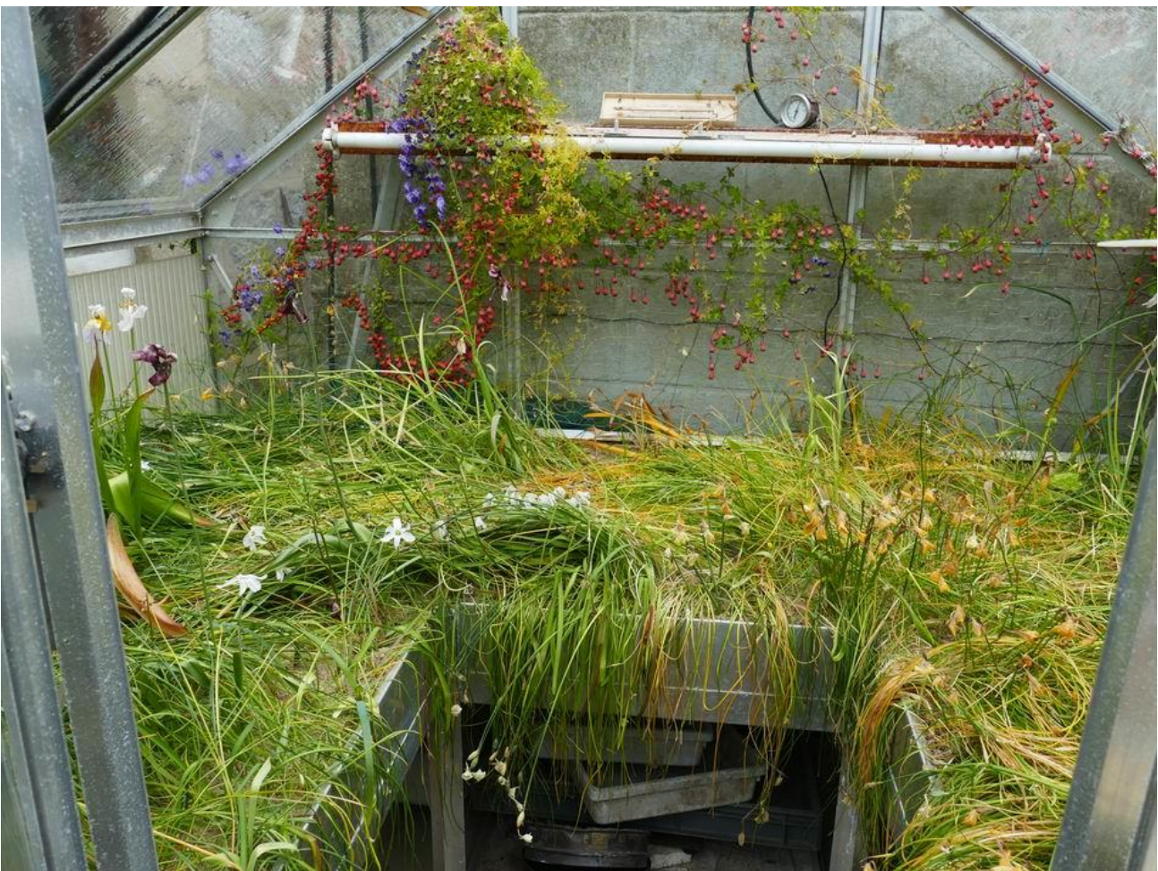
In this bed most of the flowering is over by the middle of May.