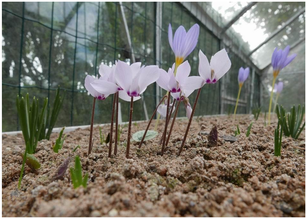
In September growth is apperaing both leaves and flowers such as Cyclamen mirabile along with Crocus species.