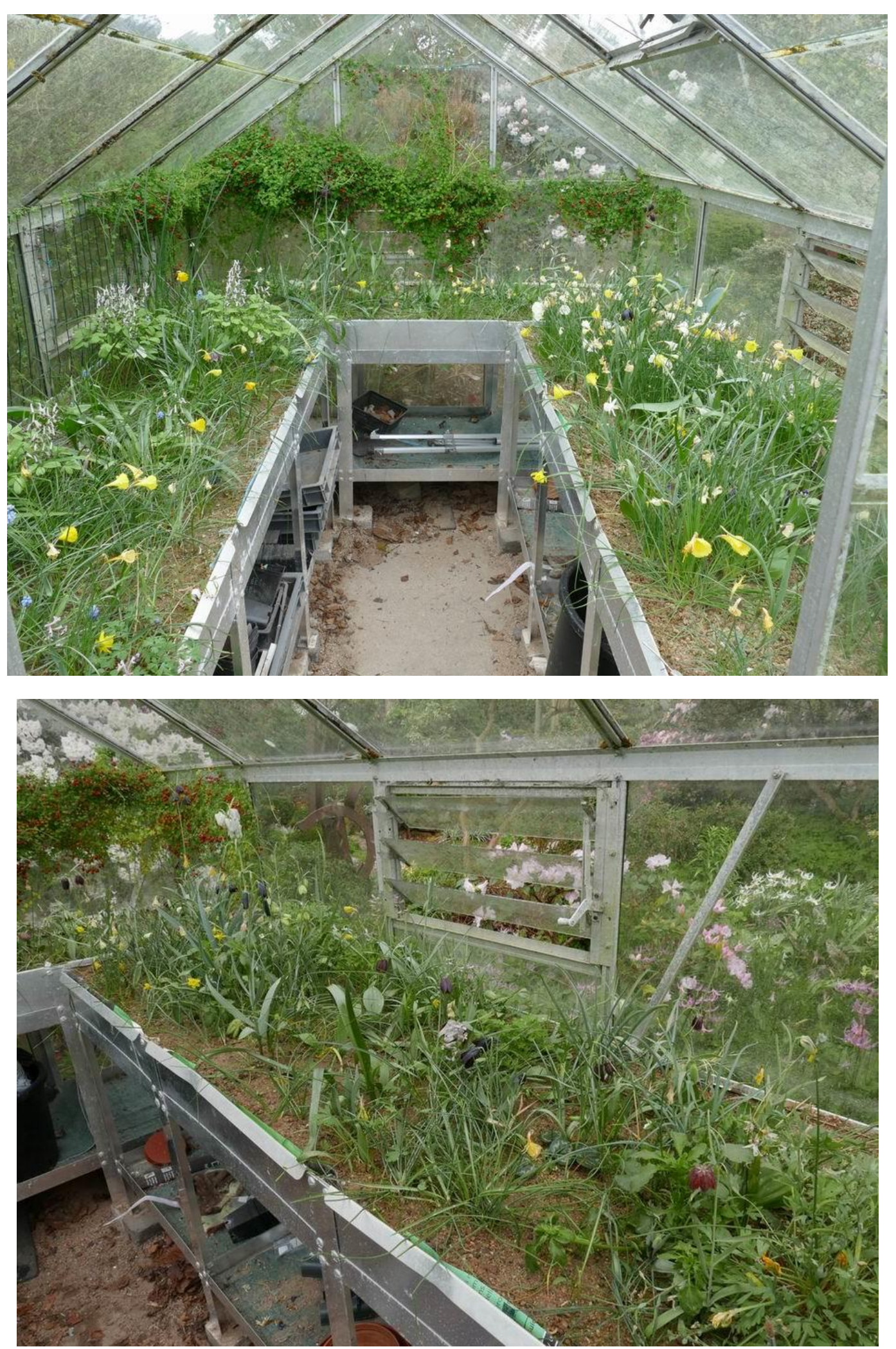
By mid-April some Fritillaria are in flower.