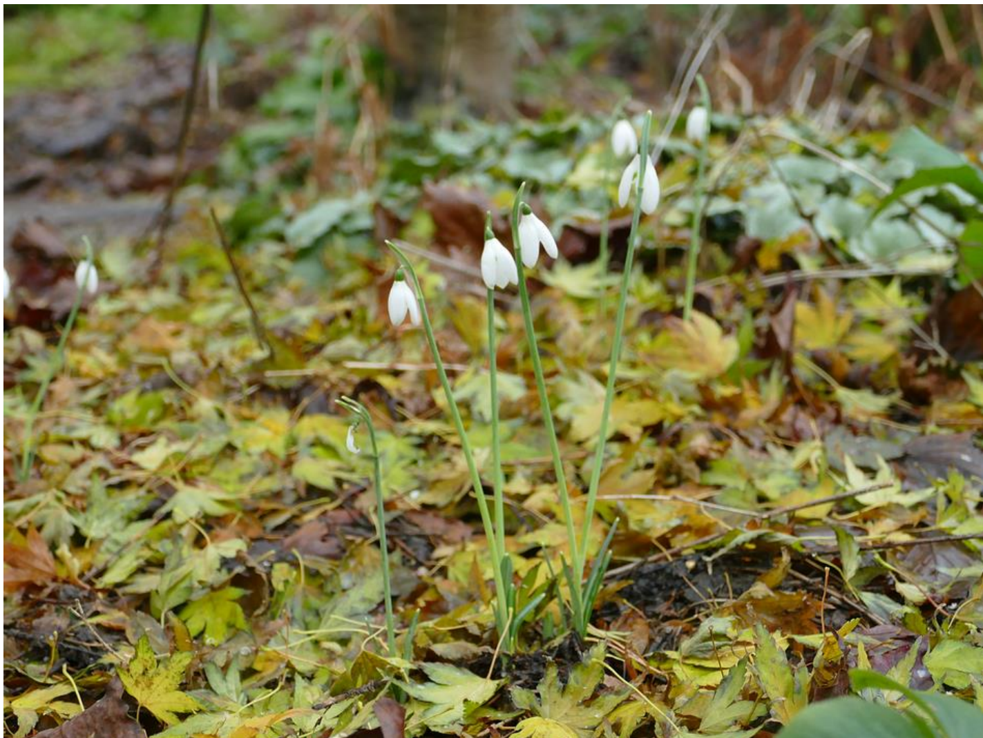
Our first of the new seasons Snowdrops is this form of Galanthus reginae-olgae which is the only one from a number we have tried over the years that has proven hardy in our garden.