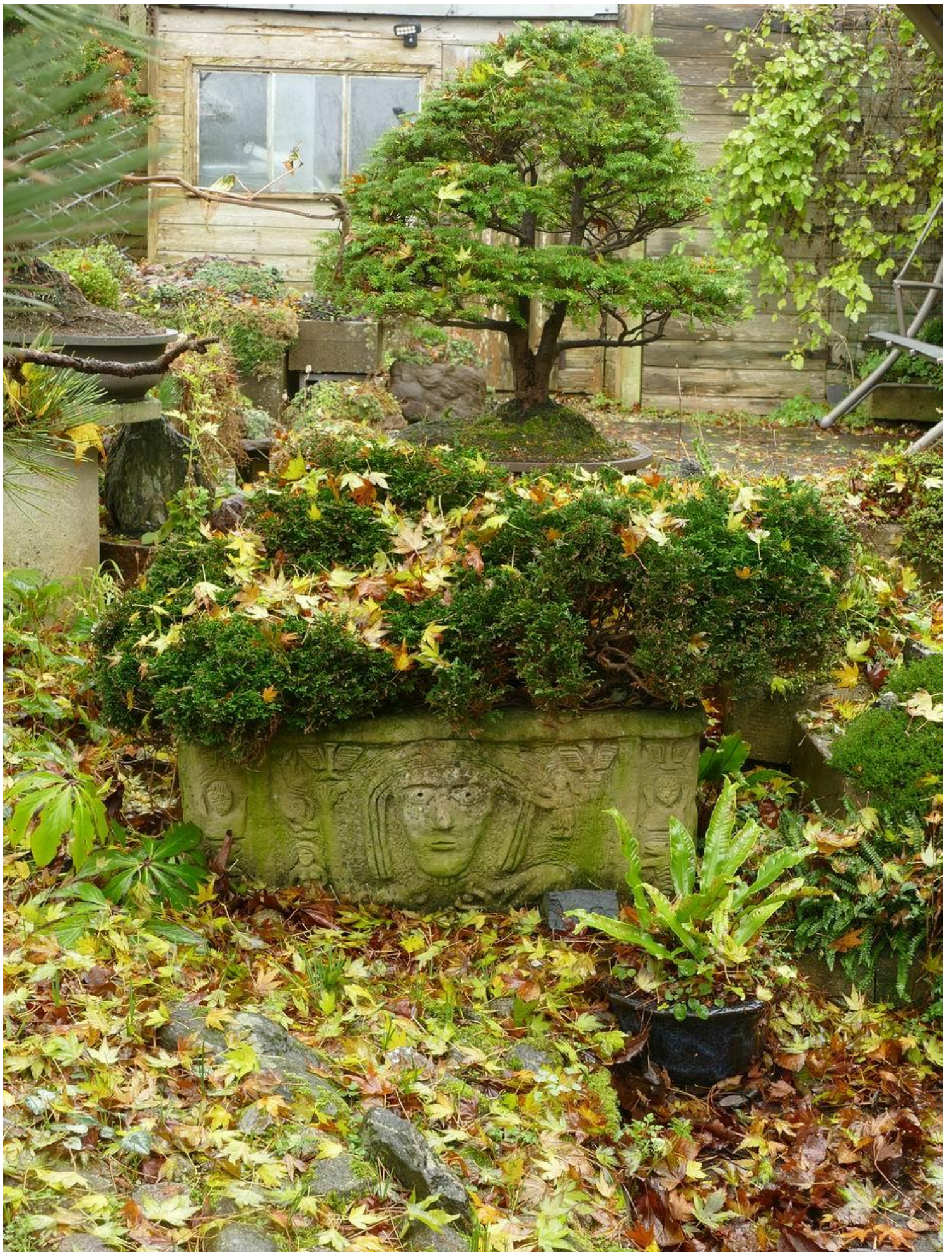
Looking to my right, east, as I sit writing at my work table gives this view over the cobble bed, to our 'Gundstrup cauldron' trough and Bonsai.