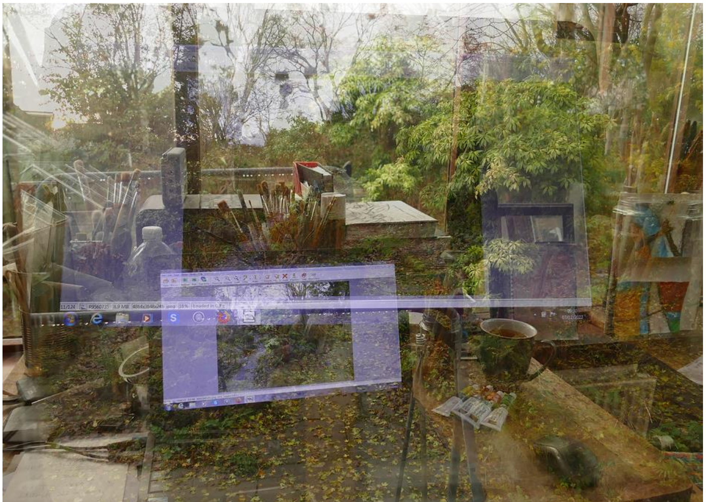
Getting creative with the camera as I write this week's Bulb Log.