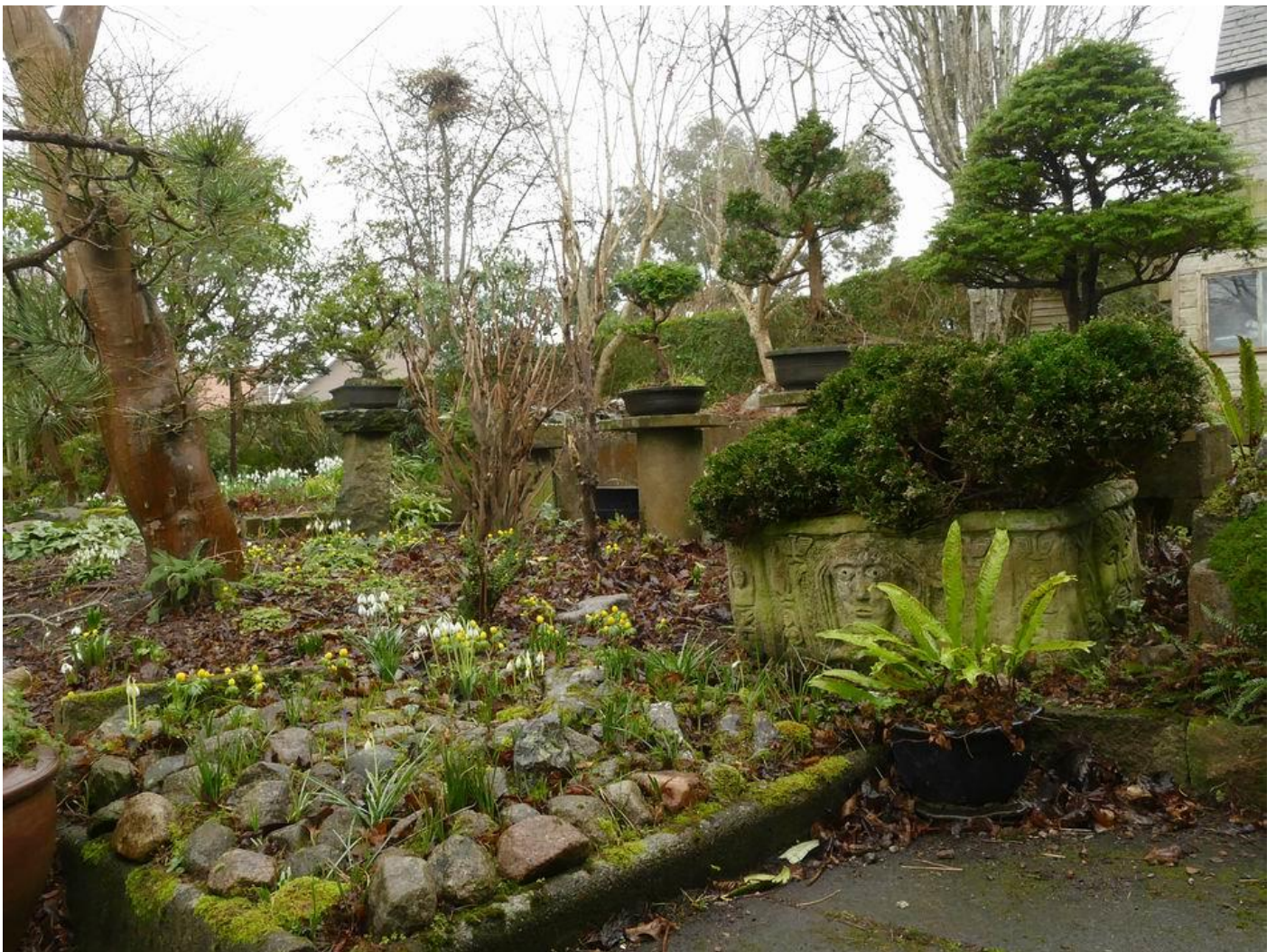
To give a flavour of this small bed through the seasons I have selected a few images taken earlier this year.