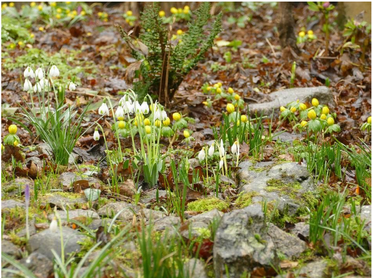
Early in the year Galanthus and Eranthis are among the first to flower - their stems and leaves making their way up between the closely placed cobbles.