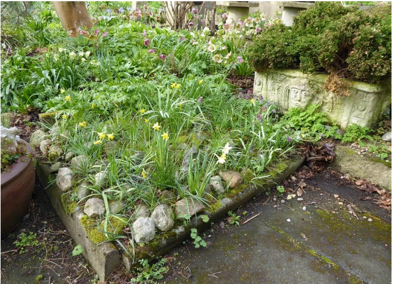
Later it is the turn of some of the trumpet daffodils as the cobbles almost disappear under the growth of foliage.