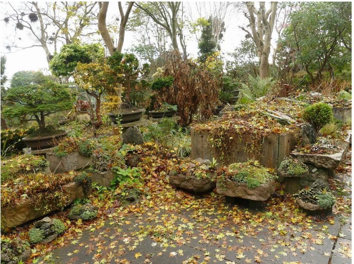
The winds blow the leaves making random patterns on the slabs, troughs and slab beds.