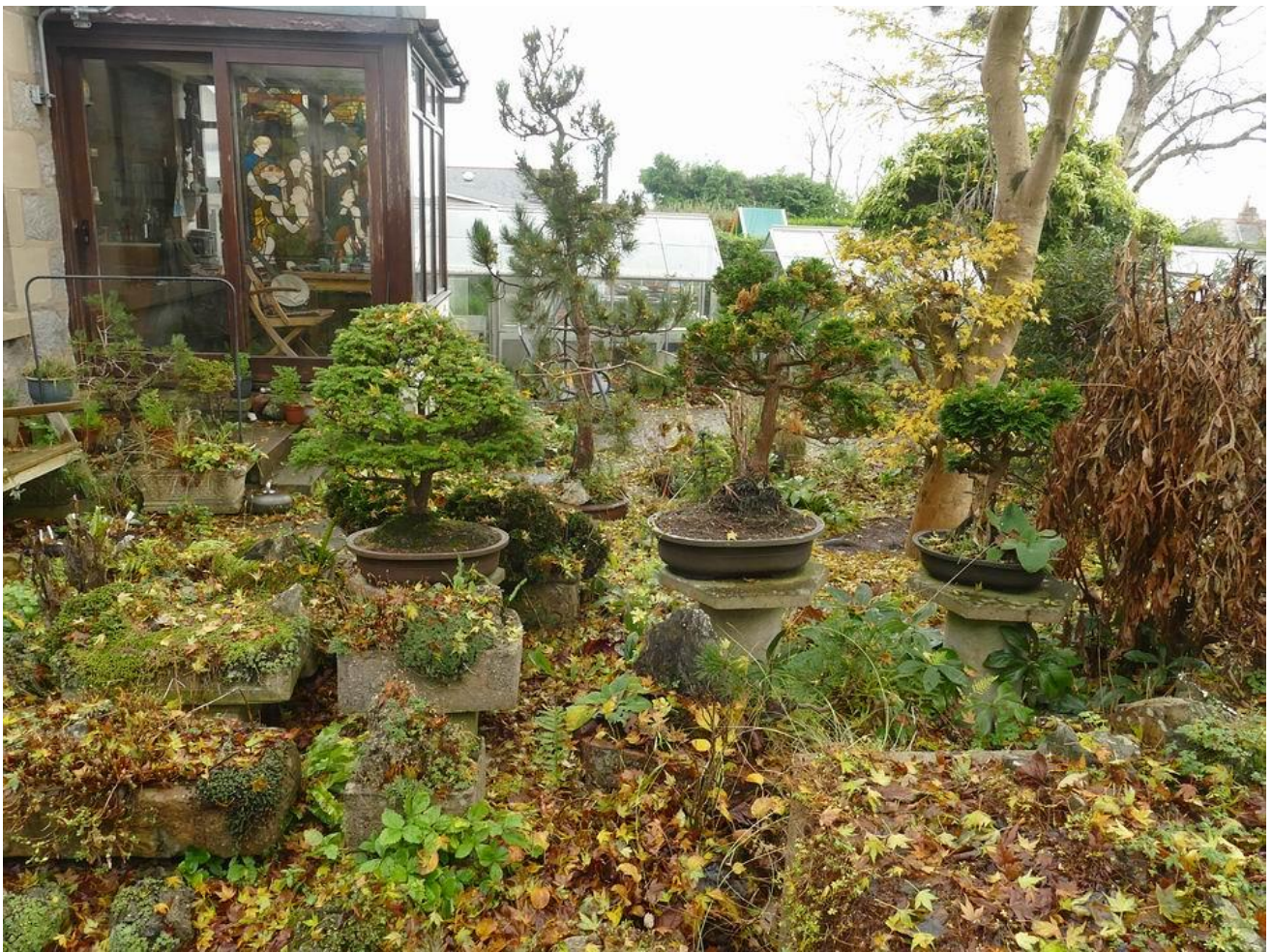
Looking back from the slabs towards my work table, in front of the stained glass, from where I get a panoramic view into the garden towards the bird feeders.