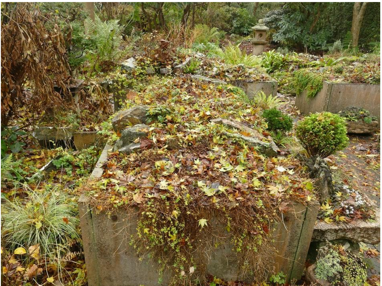
When I clear the leaves from this slab bed I will also remove the sprawling mats of old Cyananthus growth to allow the leaves of the bulbs planted below plenty of light to grow into.