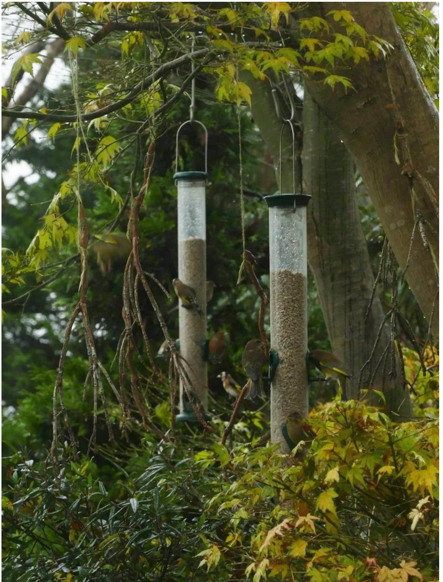
We feed the birds with sunflower hearts and I have to top the feeders up at least every other day as they eat them down below the top feeding port. These pictures are a bit fuzzy because they were taken through the window in very low light.