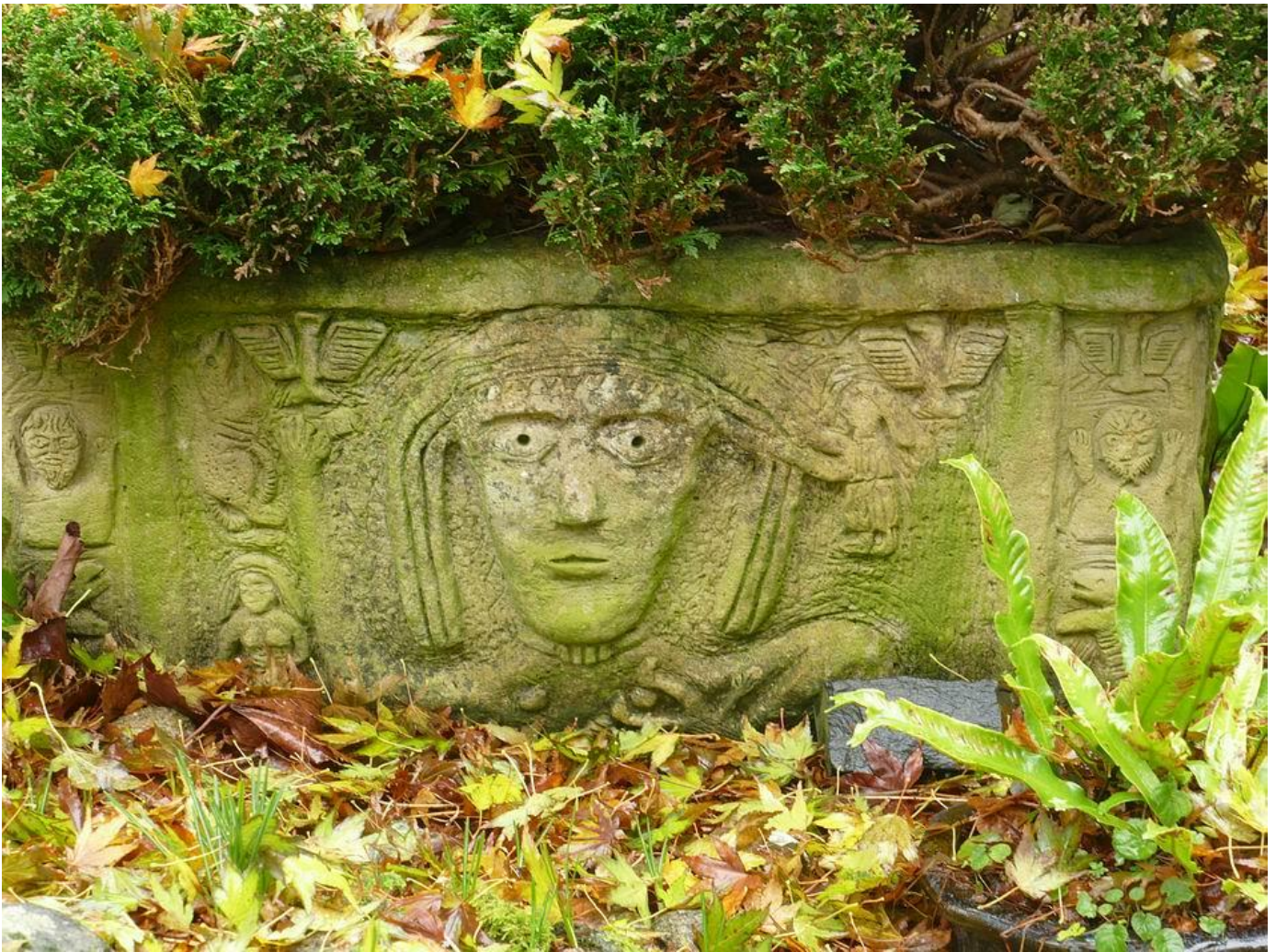
Gundestrup cauldron trough