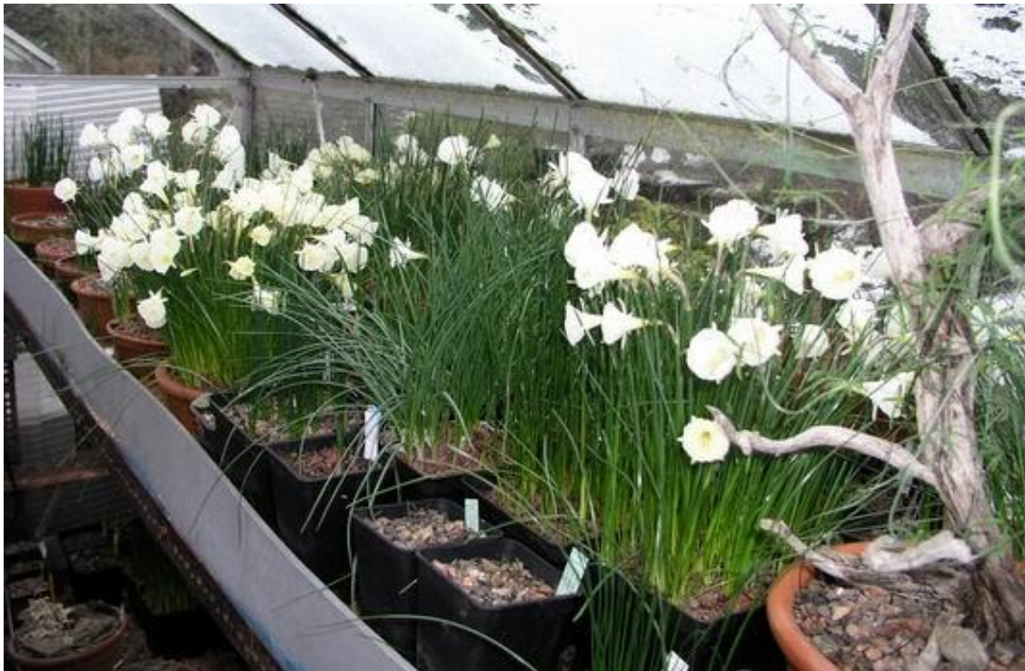
Bulb house December 2003

There is not much work required in the Frit house at the moment, other than checking on moisture levels, but I can see the gravel rising up on many of the pots. This is a sign that they are in growth and the shoots will not be far below the surface ready to appear soon.