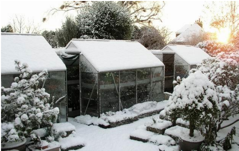
Sun rising on bulb house