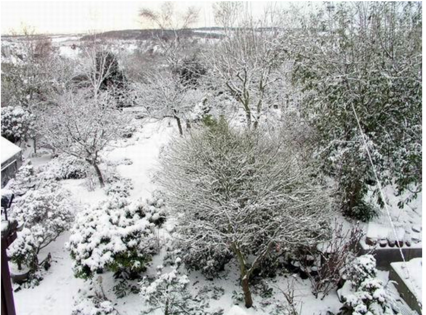
Overhead view of the back garden.

It does make the garden look pretty with all the branches and shrubs hanging with snow and it is a good time to stay indoors and catch up on reading the books , Journals, seed lists and sorting out this year's slides and digital images. I will be back next year !