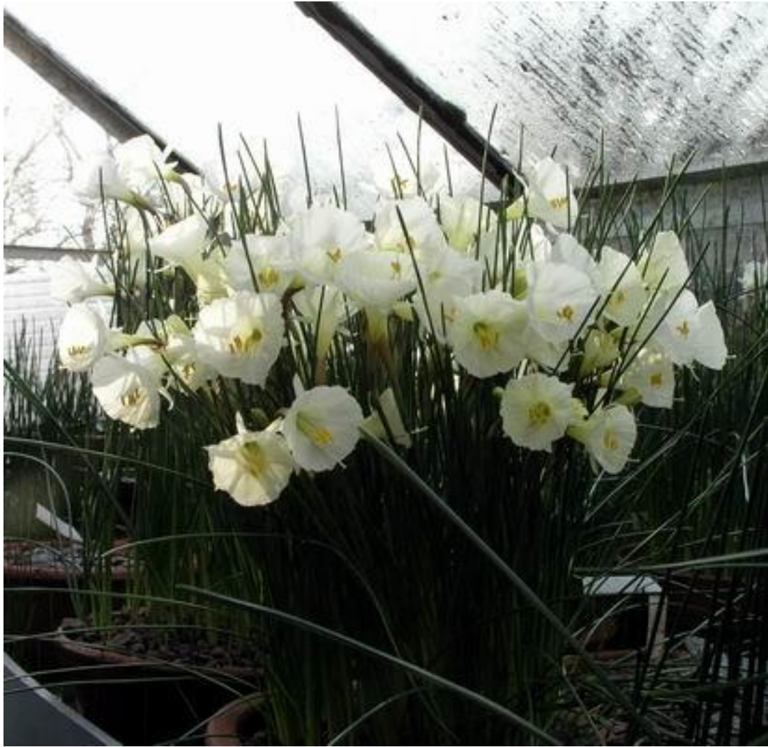
N. romieuxii mesatlanticus

Some of the pots of N. romieuxii mesatlanticus are just crammed full of flowers.