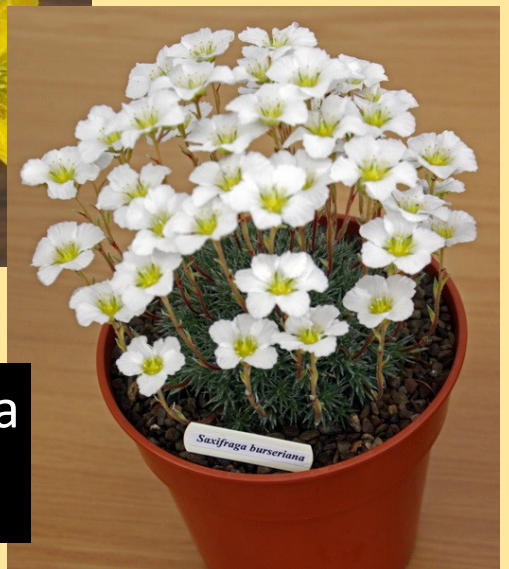
Saxifraga burseriana 'Sharon Lowe'