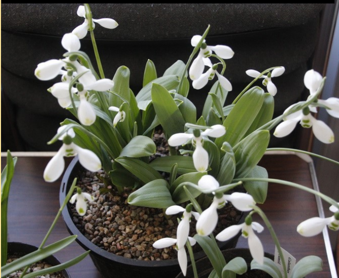
Galanthus 'Emerald Hughes'