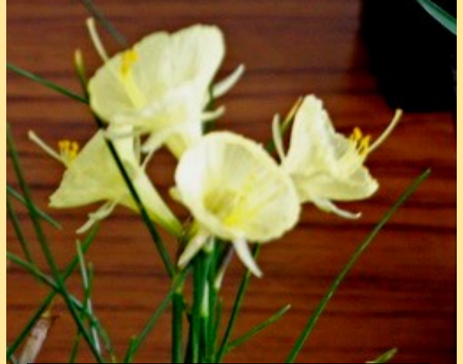
Narcissus 'Julia Jane'