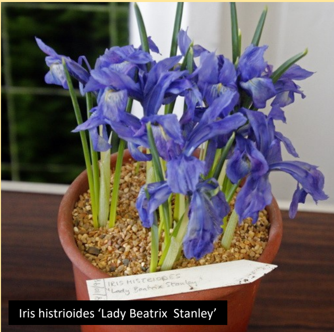
Iris historioides 'Lady Beatrix Stanley'