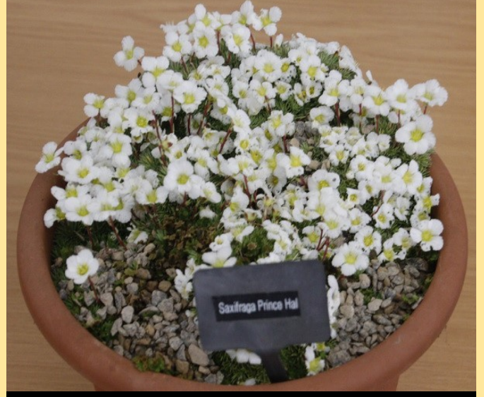
Saxifraga 'Prince Hal'