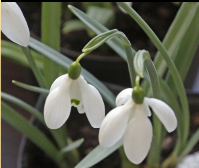
Galanthus 'White Admiral'