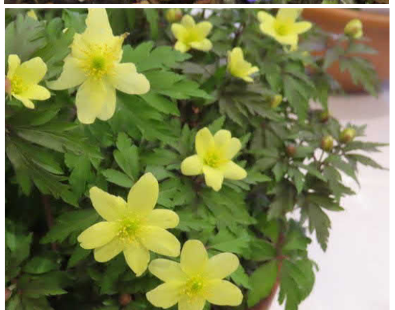
Pulsatilla vulgaris rubra Hepatica 'Millstream Merlin' Anemone seemannii