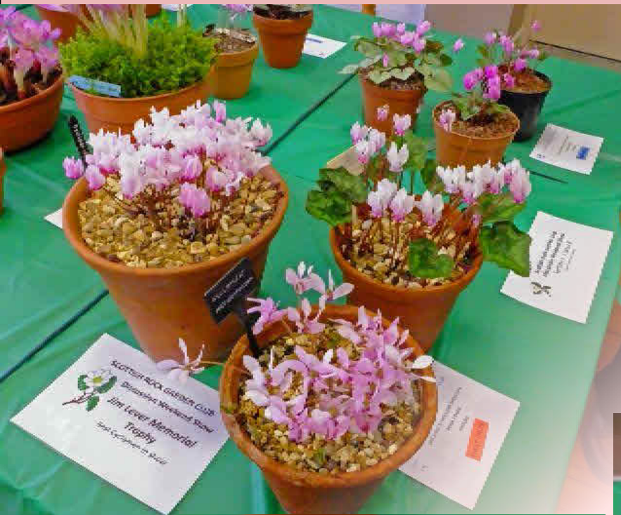
Two colourful Colchicum pots