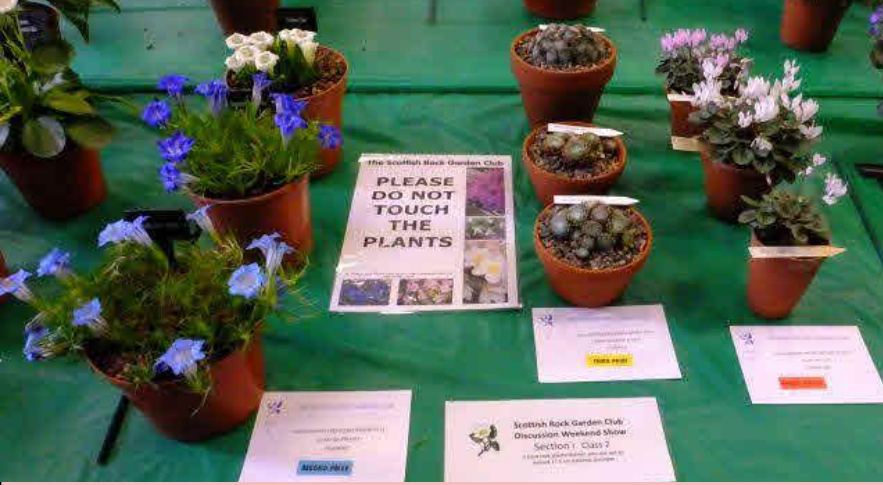
Then views of the gentians and Erica-ceous plants & finally Roma's three Cyclamen.