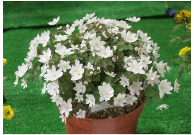
Tom Green showed this Anemone thalictroides