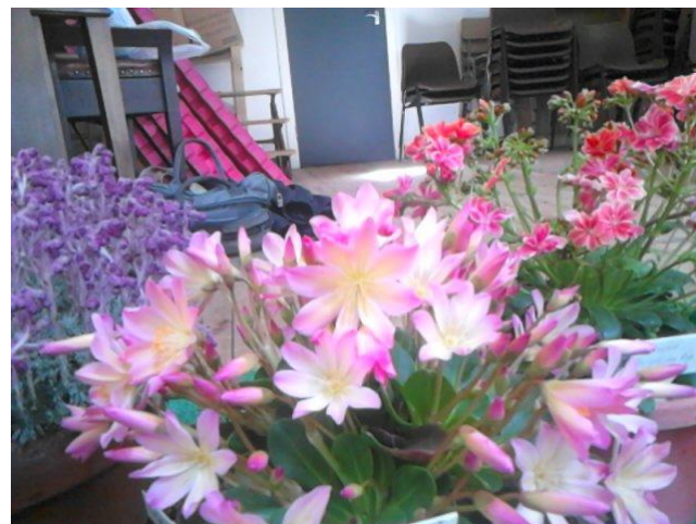
Lewisia tweedyi with L. cotyledon , behind.