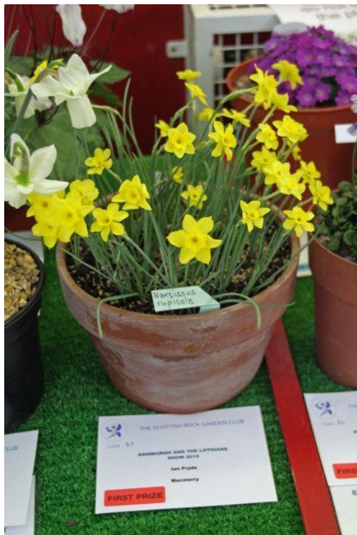
Narcissus rupicola from Ian Pryde