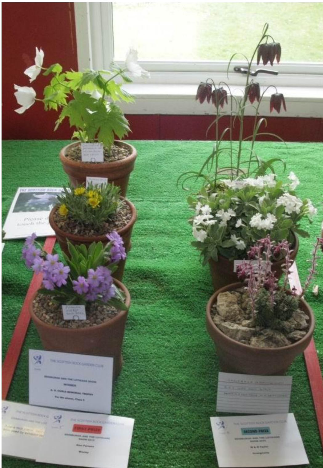
In Class 5 for three plants grown from seed, Alan Furness won the “A. O. Curle memorial trophy” with Primula rusbyi , Hymenoxys torryana and Glaucidium palmatum var. leucanthum .