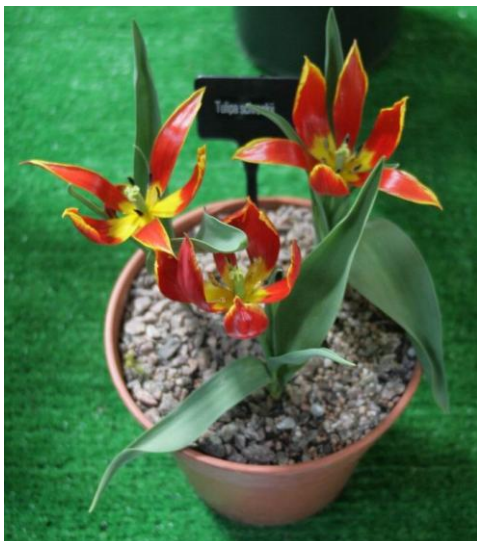
Left : Tulipa schrenkii Tulipa schrenkii Regel is a synonym of Tulipa suaveolens Roth.