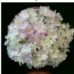
This is P. 'Pink Ice'