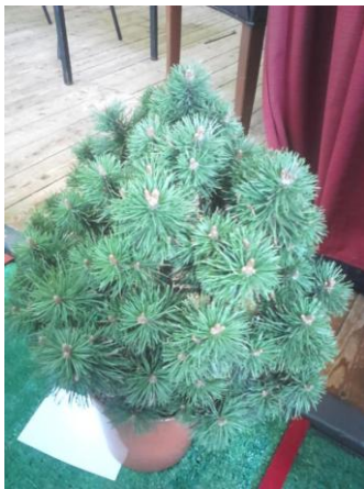
Dwarf Pinus sp.