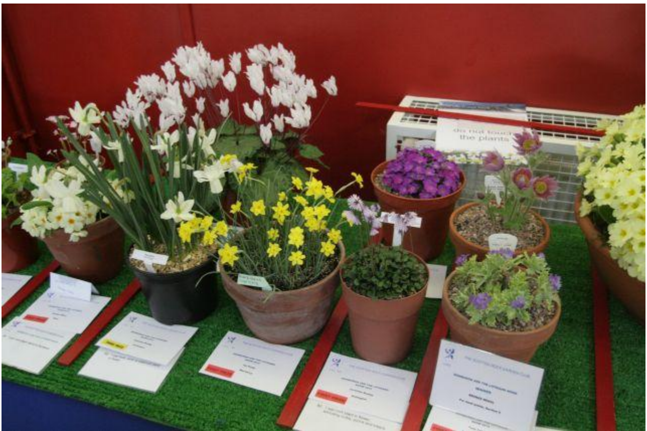
Section 2 was not large- but the quality was good, as this portion of the bench shows.