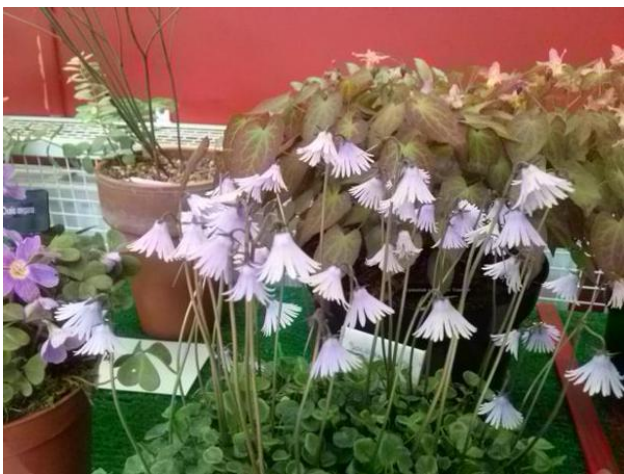
Below left: Soldanella in front of an Epimedium