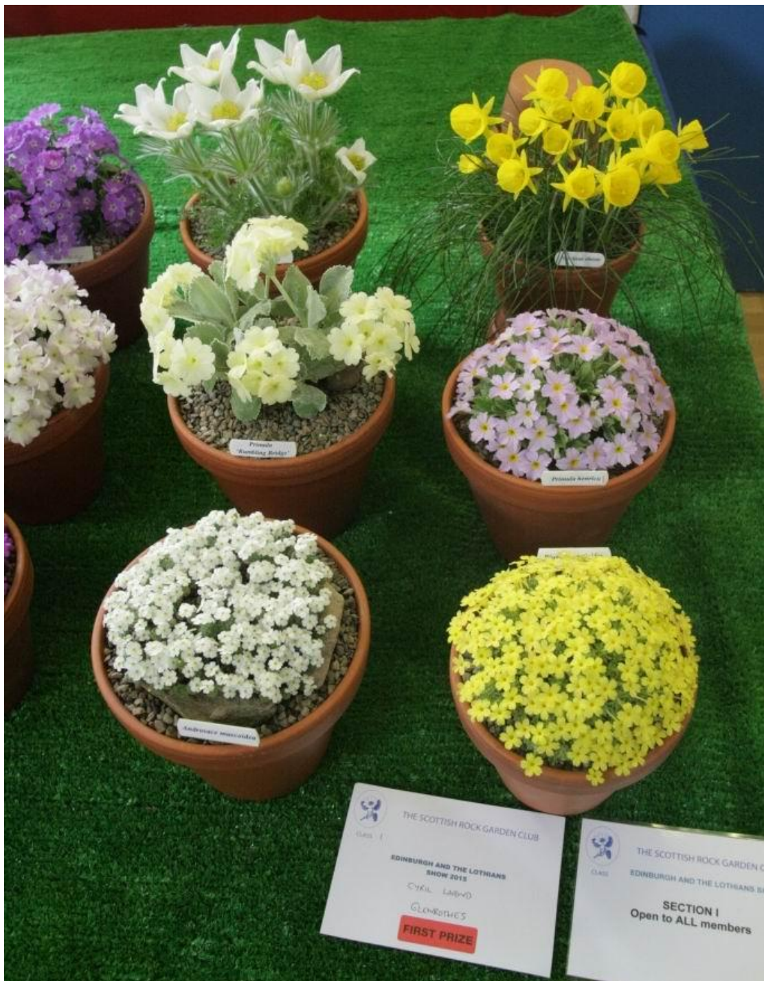
Cyril's entry in the "small 6 pan"

Class 2, the three pan class – Cyril's winning entry, including the Forrest medal plant, centre.