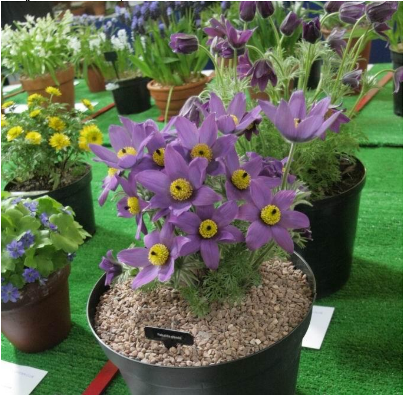
Pulsatilla grandis from Sue Simpson