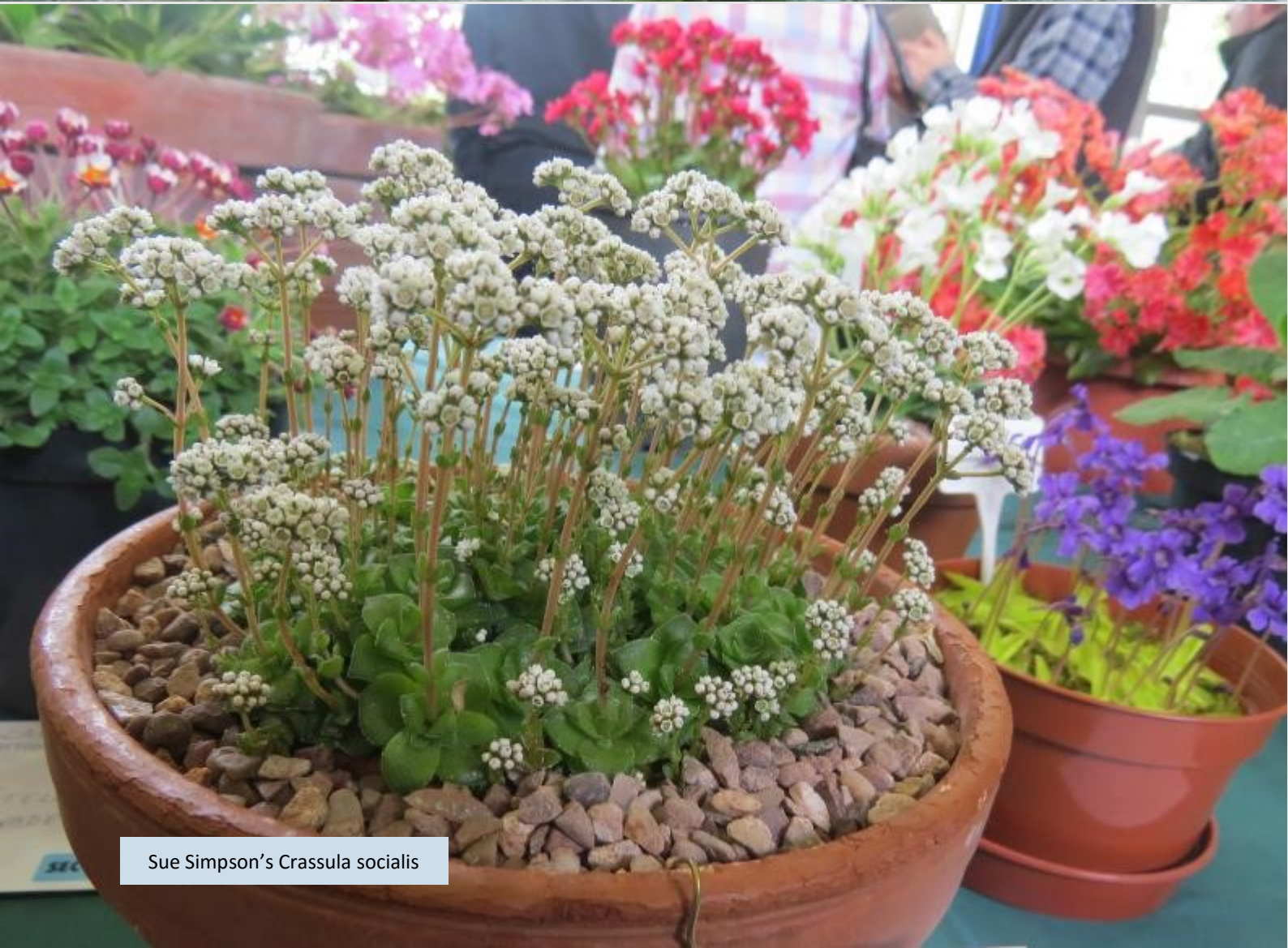
Sue Simpson's Crassula socialis