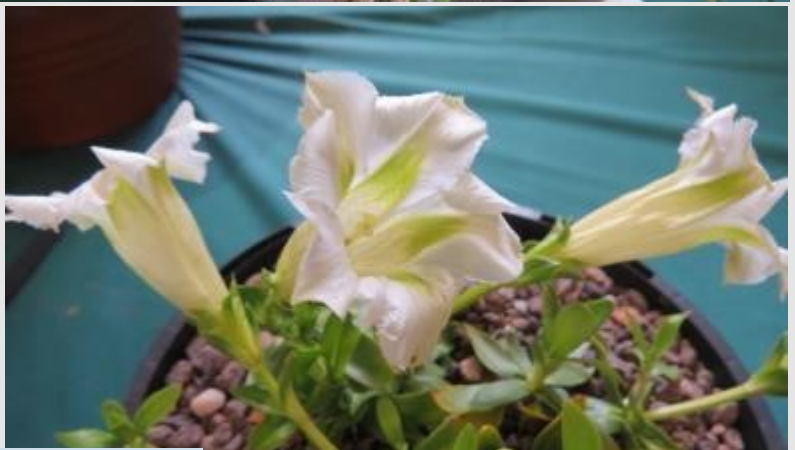
My favourite, a white Gentiana acaulis