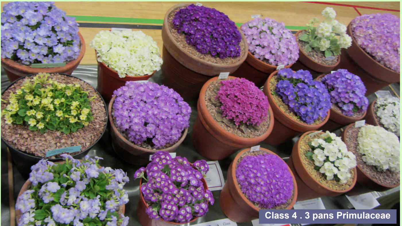
Class 4 . 3 pans Primulaceae