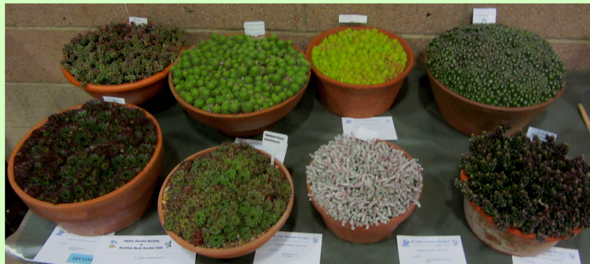
Class 39 . 1 Pan Crassulaceae