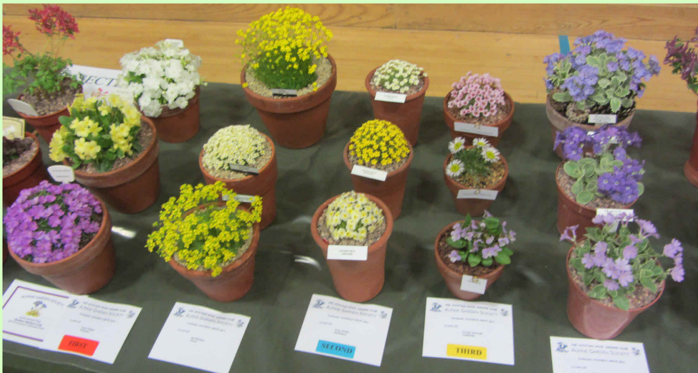
Section C 3 pan class