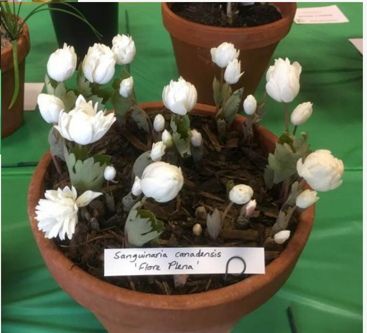
Sanguinaria canadensis Flore Plena