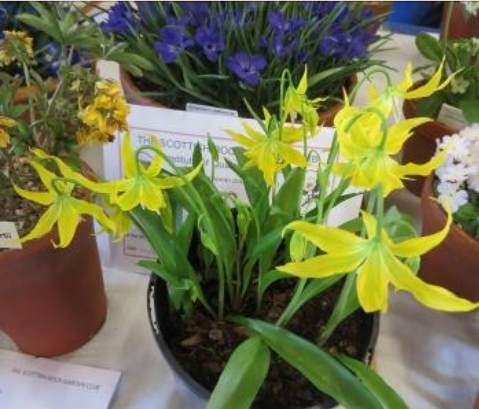
Two views of Ian Christie's Erythronium grandiflorum which I have always thought was difficult to flower away from its home in the American Rockies and western mountains.