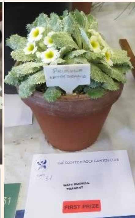
TOP ROW - Primula nana , P. 'Lismore Sunshine', P. 'Netta Dennis'