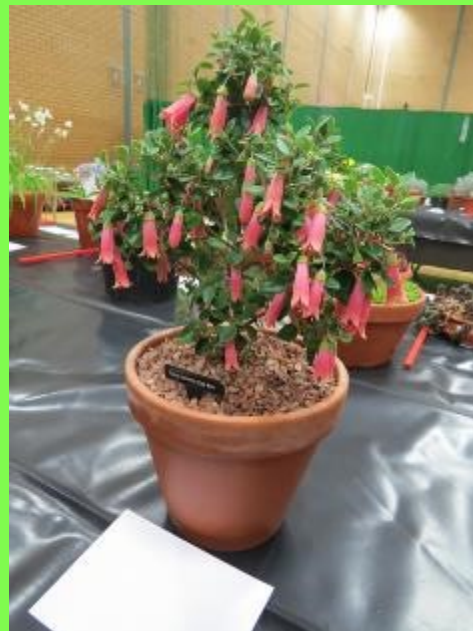
Top to bottom L to R Pulsatilla vulgaris White Swan Sanguinaria canadensis Corydalis wilsonii Trillium rivale Dionysia aretioides Dionysia 'Dompfall' Chamaecystus demissus Arum creticum ? Red stem Correa pulchella 'Pink Mist'