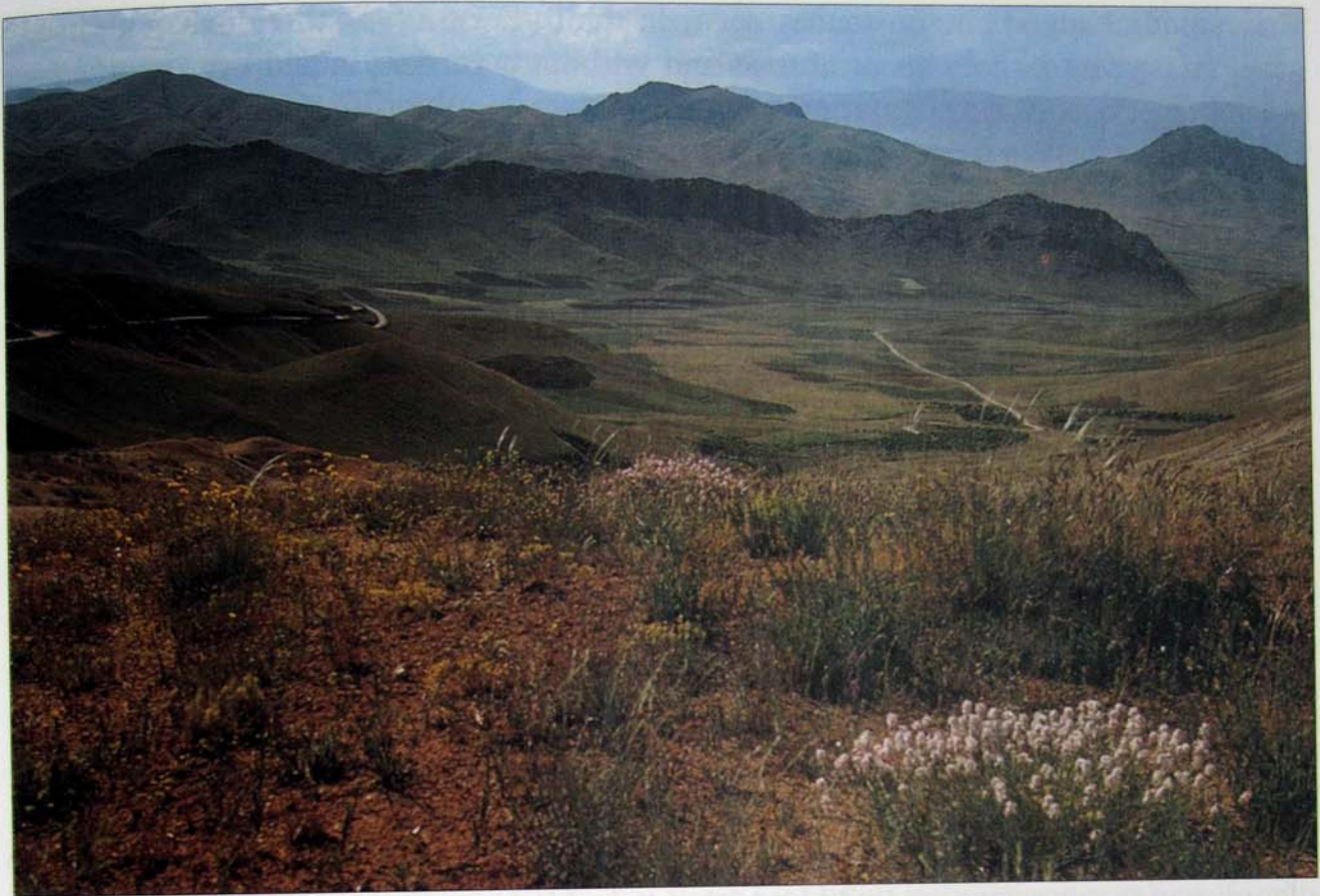
A view north of Rezaiyeh in N Iran, the habitat of Iris urmiensis (syn. I. barnumae subsp. barnumae forma urmiensis )