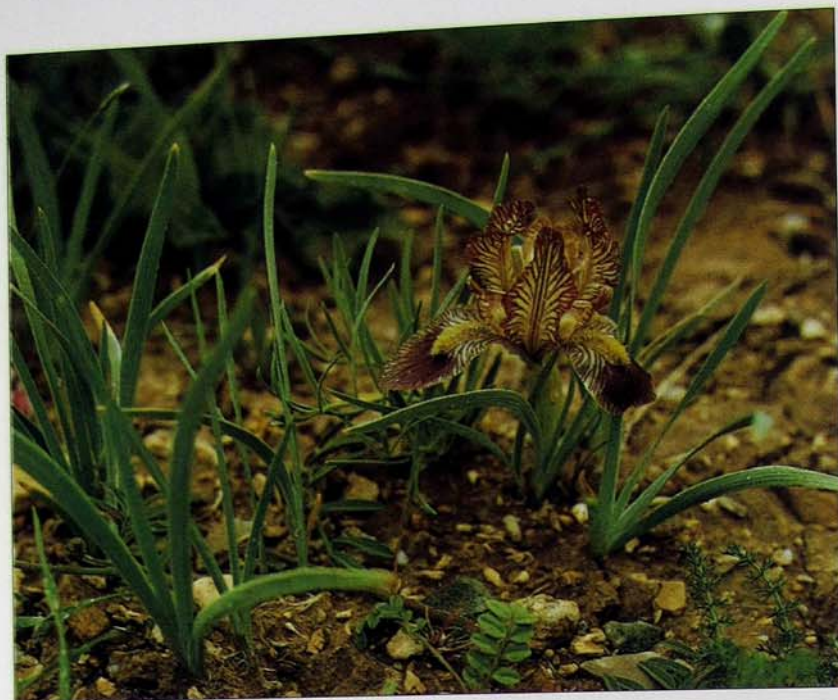
Iris meda , Iran, Kordestan, near Saqqiz