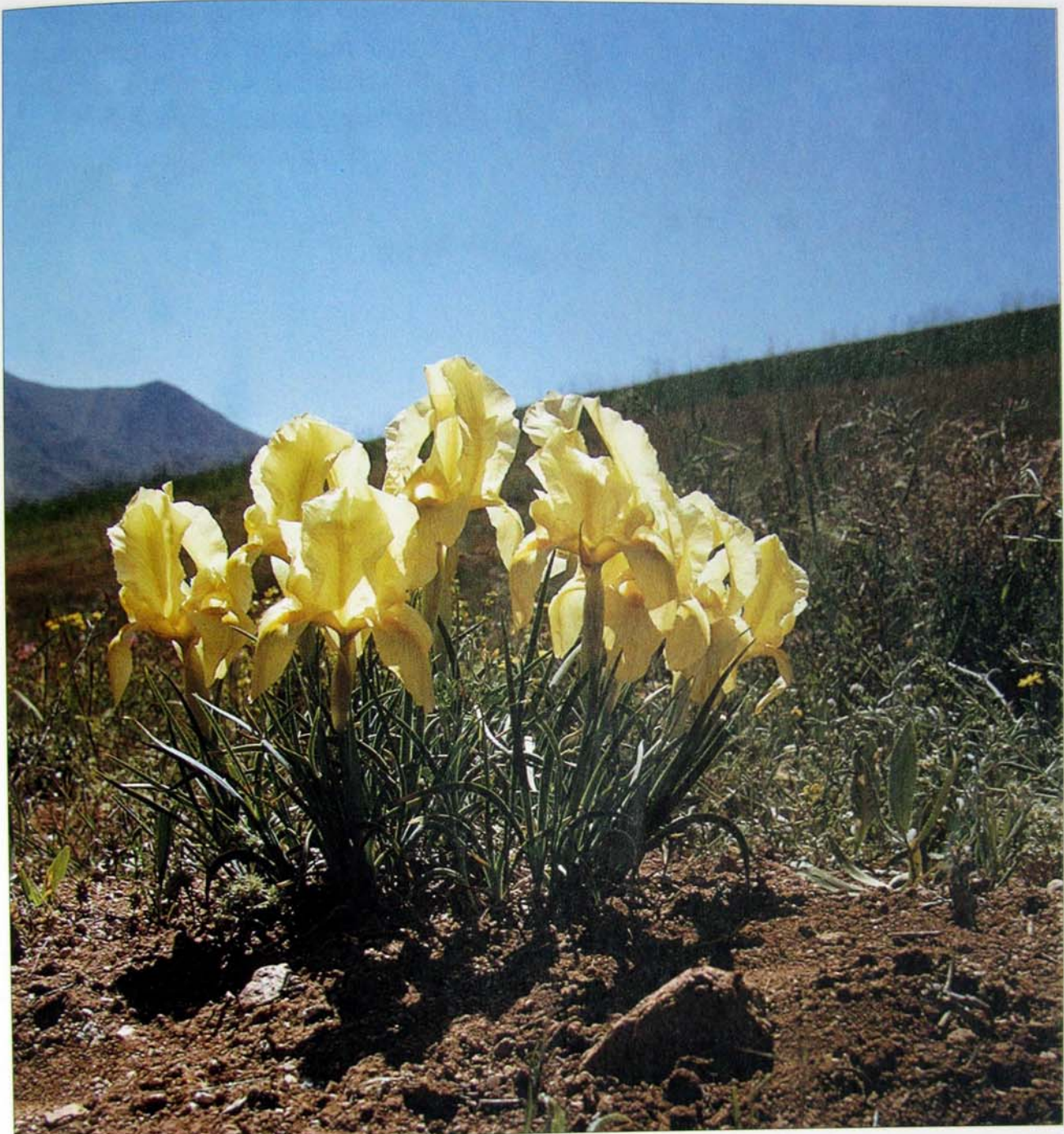
Iris barnumae subsp. barnumae forma urmiensis , NW Iran (Azerbaijan), north of Rezaiyeh