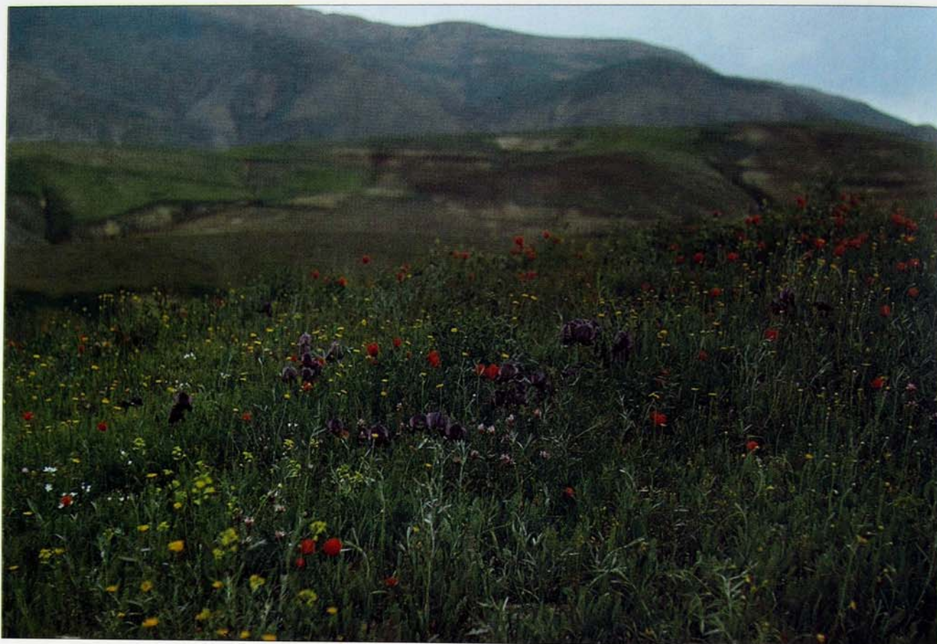
Iris barnumae subsp. barnumae forma protonyma in NW Iran, (Azerbaijan) Khamisian Pass north of Khoi