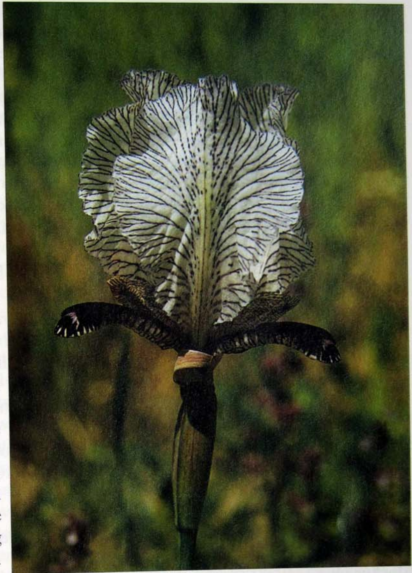
Iris paradoxa forma choschab , Iran (Azerbaijan), north of Khoi

Finally, we come to the most distinct of all the Oncocyclus Section, indeed the most distinct of all irises. I. paradoxa is like no other in its reduced, stiff, horizontal falls, each almost entirely covered with a black velvety beard, contrasting with the exaggerated, erect, rounded standards. In the Armenian type-race these are a violet-purple of varying intensity. The striking I. paradoxa forma mirabilis has yellow falls covered with an orange beard and palest blue