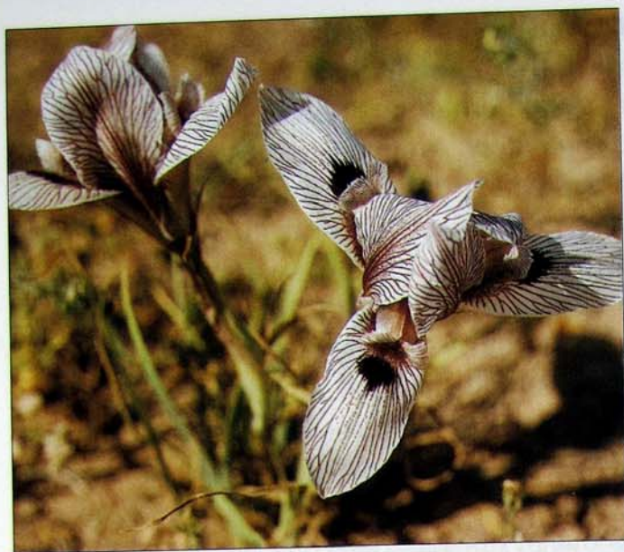
Iris acutiloba subsp. lineolata , Iran, N of Mahabad

small area of northern Azerbaijan, there is the possibility that other species may be involved there. The dwarf I. grossheimii from Nakhichevan, just north of the Iranian border, has a reddish ground colour and a large signal patch. It grows in an area where I. iberica subsp. lycotis is found and hybrids made between this and I. acutiloba in cultivation have produced a similar plant.