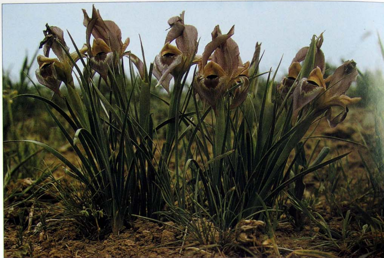
Iris aff. barnumae , the unnamed iris of the Kurdish steppe, north of Husainabad, NW Iran