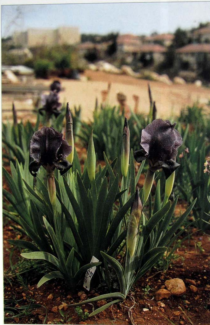
Iris jordana in cultivation in Israel

is its most likely wild relative. Dwarfier, at a little over 30 cm, I. sofarana , with its subsp. kasruwana , is another strong possibility. Described by John Watson as a "great folded silk scarf of a flower, intricately stitched and pearly with dense black-purple threadlines", it grows in several sites in the central Lebanon. Closely related to these but only known from about 1800 m above the cedars at Bsherrri is I. cedretii . It lay under a considerable amount of snow on the only occasion I visited its habitat but I grew it once without difficulty from material collected by Ken Aslet and have now received it again from Bob and Rannveig Wallis. Other montane plants near I. sofarana are I. damascena from the Syrian Jabl Qasyoun and I. westii from above the Beka'a valley, in the mountains east of Jezzin in the southern Lebanon. The last is more colourful than most, as the veining on the falls is on a light yellow ground with pale lilac on the standards. All these have dark, purple or brown beards but the high altitude I. antilibanotica from the Bludan area of Syria, in two-toned 'stern