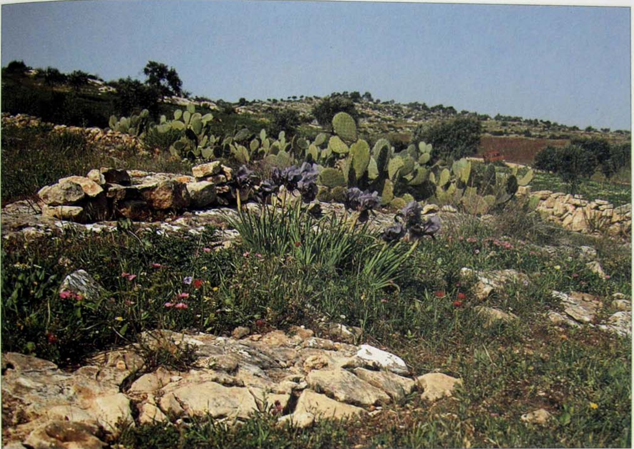
Iris biggeri growing in the wild in Israel

dark violet-blue', is yellow-bearded and may be closer to those around the Israeli I. atropurpurea . Further south, at lower altitudes, as the mountains tail-out in Palestine, there are tall, robust plants, like 'freckled purple' I. haynei and the possibly synonymous I. biggeri , which may be nearer to I. jordana and I. atrofusca .